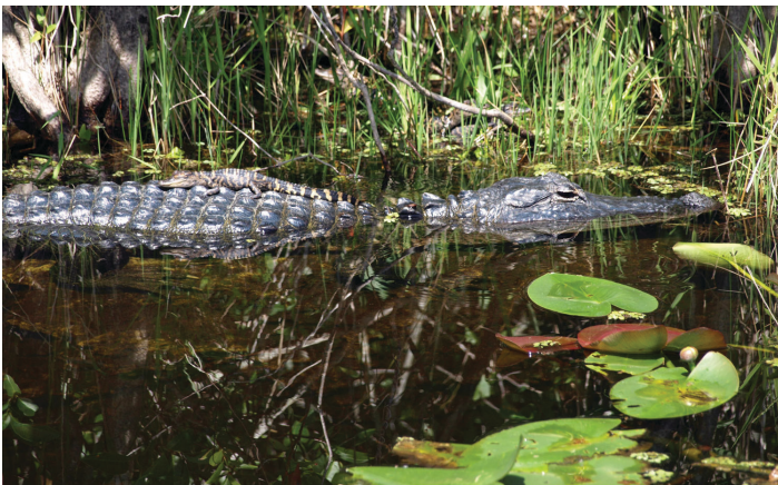
Figure 3. Adult alligator with hatchling.

No other species defines the Everglades as does the American alligator. It is an excellent indicator species because it is valued and understood by managers, decision-makers, and the public. Having the alligator on the list of system-wide, general indicators provides us with one of the most powerful tools we have to communicate progress of ecosystem restoration in Greater Everglades ecosystems to diverse audiences.