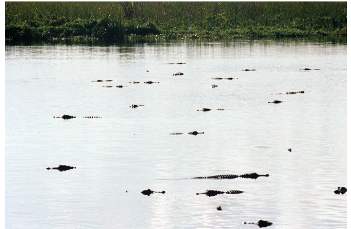
Figure 4. Canals provide habitat for dense populations of adult alligators, but not for hatchlings and juveniles.

Alligators are top predators and “ecological engineers” that affect nearly all aquatic life in the Everglades. The holes and trails that alligators build provide refuge for fish and food for wading birds during the dry season, and their nests provide elevated areas for nests of other reptiles and germination of plants less tolerant of flooding. Therefore, an increase in alligator holes and nests, and alligators maintaining them, will be an indicator of Everglades restoration success.