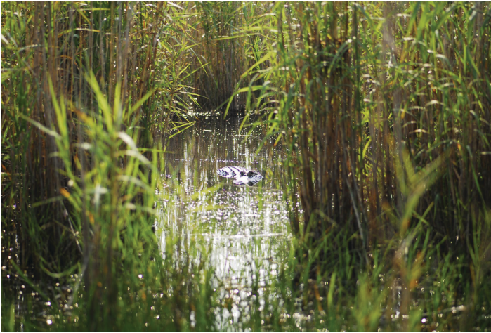
Figure 2. The alligator is a “keystone species” that affects nearly all aquatic life in the Everglades.