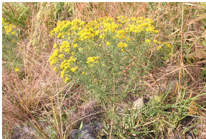
Figure 1. Flat-top goldenrod is a perennial plant that often infests poorly maintained pastures. Multiple branches give the plant a flat-top appearance.

Flat-top goldenrod is a perennial plant that grows to approximately 3 feet in height. Plants tend to grow in colonies and spread by both seed and a creeping rhizome root system. Leaves are alternate, extremely narrow, and similar in width and length to the leaves of dogfennel. Leaves are often shed during flowering, except near the top of the plant. Flat-top goldenrod appears as a single stem when it emerges in the spring, but the stem begins to branch as early as mid- to late May. The branches grow to produce a flat-topped appearance (Figure 1). Flowering occurs from September through November, and the flat-topped inflorescence consists of many yellow ray and disk flowers (Figure 2).