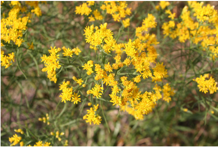
Figure 2. Flat-top goldenrod inflorescences contain many disk and ray flowers.