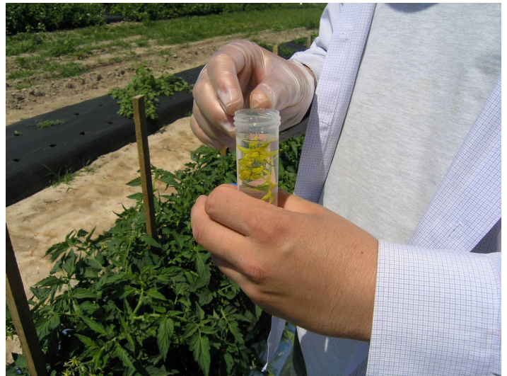
Figure 4. Placing tomato flowers in vials with 70 % alcohol

Because the native flower thrips occur in large numbers in the flowers of fruiting vegetables where they out-compete the damaging invasive species, it is necessary to accurately identify the species in order to make management decisions. A few flowers should periodically be placed in a small container with 70% alcohol (Figure 4). The container can be shaken to dislodge the thrips, which can then be examined under a microscope with at least 40X magnification to determine the species of the adults. Shifts in the relative abundance of species of thrips throughout the growing season can be determined in this way. It is best for growers to have a competent scout who can provide this service. Contact your county agent for advice and help.