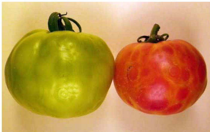
Figure 1. Tomato spotted wilt symptoms on fruit of tomato

TSWV is circulative and replicative, which means that the virus is circulated by the insect hemolymph (blood) and replicates in the insect's internal tissues. The cycle of virus acquisition and transmission begins with larval feeding on infected plant tissue (de Assis Filho et al. 2005). The virus passes through the midgut of the insect and spreads to various cells and organs, including the salivary glands. The virus is transmitted to an uninfected plant when saliva is injected into the plant tissue during feeding (Figure 1).