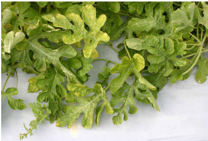
Figure 6. CYSDV in watermelon.

symptoms are seen on older leaves. The first symptom is a yellow spotting of leaves (Figure 6). Then, leaves turn yellow between the leaf veins, which remain green -the opposite of what happens when squash are infected with SqVYV. Leaves roll downward and become brittle. It can take up to four weeks for symptoms to develop after infection, so it is easy to move the virus long distances in infected but symptomless transplants without realizing that the plants are infected. Recently, CYSDV has been found infecting smellmelon in Florida (Adkins et al. 2009).