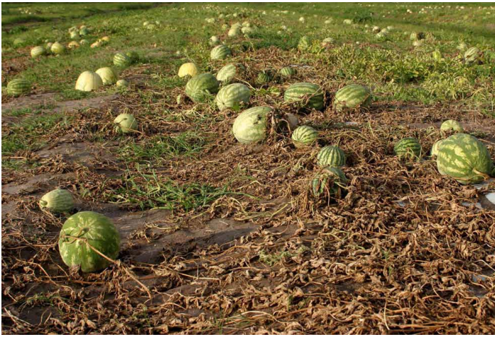
Figure 1. Watermelon plants killed by infection with SqVYV.