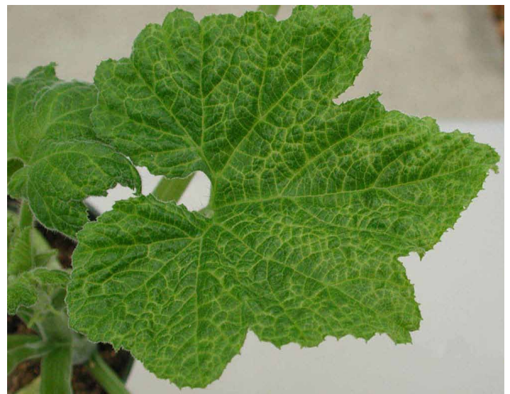
Figure 4. Vein yellowing symptoms on yellow summer squash in the greenhouse.

Cucurbit yellow stunting disorder virus (CYSDV) was originally reported from the Middle East and Spain. It was first found in the United States in Texas in 1999 and was widespread in the southwestern United States in the fall of 2006 (Brown et al. 2007, Kuo et al. 2007). CYSDV was found in Florida in 2007 (Polston et al. 2008). It is a crinivirus in the family Closteroviridae . It persists in the whitefly adult for up to 9 days, the longest time of any crinivirus (Wisler and Duffus 2001). It affects all cucurbit crops, causing reduced fruit size and sugar content. Symptoms resemble those of a nutritional deficiency or water stress; the most obvious