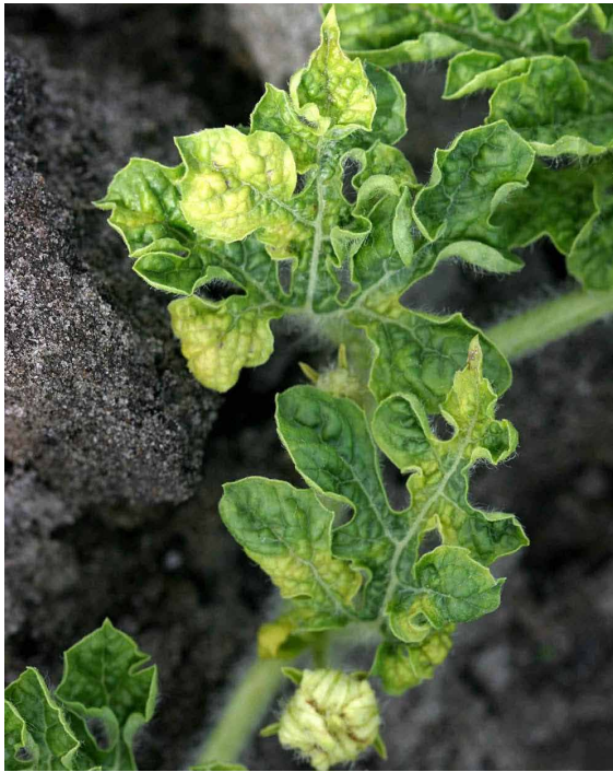
Figure 5. CuLCrV in watermelon.