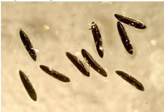
Figure 2. Mosquito eggs.

Eggs. Depending upon the particular species, the female mosquito lays her eggs either individually (Figure 2) or in groups called rafts. Any water-holding area, such as tree holes, ponds, puddles, ditches, and artificial containers such as discarded tires and flower pots can serve as a mosquito breeding site.