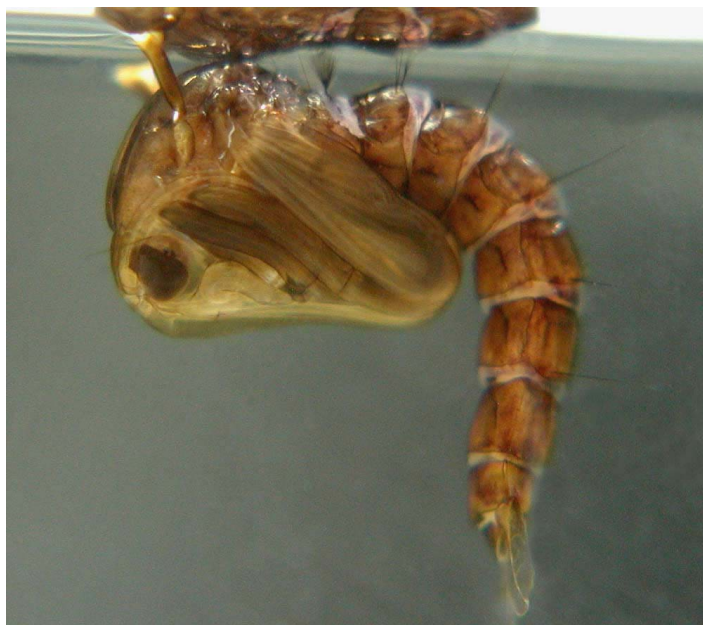
Figure 4. A mosquito pupa ( Toxorhynchites sp.)

takes a new shape — the pupa (Figure 4). The pupa can be considered to be a sealed envelope, where the adult organs are developed from larval tissues. The pupa does not feed or