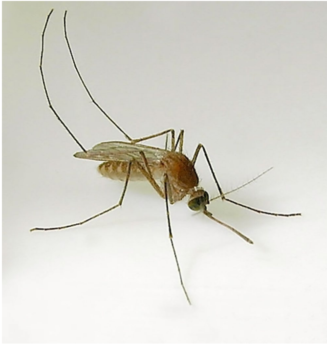
Figure 1. The Florida SLE mosquito Culex nigripalpus

an adult stage. All of the immature stages are aquatic, and adult females return to water to lay their eggs. The name mosquito comes from the Spanish “musketas,” meaning “little fly.” The native Hispanic-Americans called them “zancudos”, a term that is still used in parts of South and Central America; it means “long-legged.”