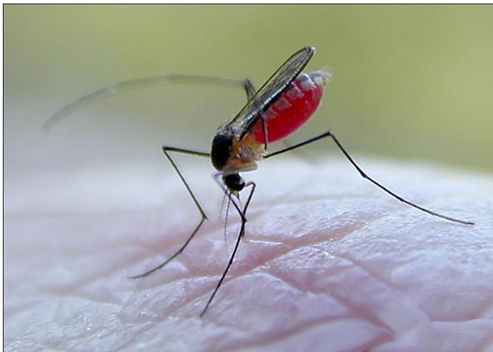
Figure 6. Adult mosquito bloodfeeding

Because mosquitoes tap into the host's blood supply (Figure 6), they can be very efficient in transmitting diseases to humans and animals.