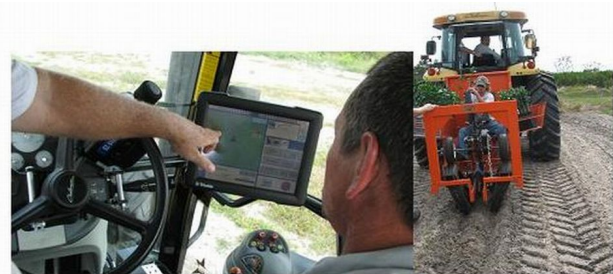
Figure 2. Tree planting unit attached to a tractor with RTK auto-steering system.

Figure 2 shows the tree planting unit with the plants being fed to the unit by a human operator. For such units, going too fast reduces the time for the operator to feed the plant to the system. Human reaction time optimally varies between 0.15-0.20 seconds. It should also be considered that it takes 0.35 seconds for a transplant to drop 2.0 ft in a free fall into the hole. If the planter's closing wheels are too close, the plant may not have enough time to reach the bottom of the hole and the wheels may damage the roots. At 1.5 mph human planting capacity, reaction delay plus free fall time will offset the plants more than 1.0 ft from intended locations (Table 1). The best planting speed is about 0.5 mph. Some auto-steering units may not be able to guide well at such low speeds.