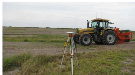
Figure 1. An RTK-GPS-based auto-steering with tree planting unit

Planting the trees in perfectly straight rows could be very useful for mechanical harvesting and can increase the efficiency of catch frame systems.