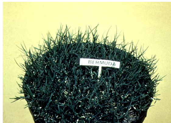
Figure 1. Bermudagrass.

Bermudagrass produces a vigorous, medium green, dense turf that is well adapted to most soils and climates found in Florida. Bermudagrass has excellent wear, drought, and salt tolerance. It establishes rapidly and is able to outcompete most weed species. It is readily available as sod or plugs, and some improved cultivars are available as seeded varieties. Common varieties are available as seed, sod, or plugs.