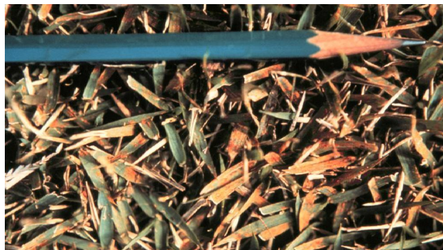
Figure 1. Rust symptoms on zoysiagrass. Credits: G. W. Simone

Cultural Controls: Maintain an adequate, balanced fertility program using slow-release nutrient sources. In shady areas, monitor irrigation closely to keep the leaves as dry as possible. It is best to water