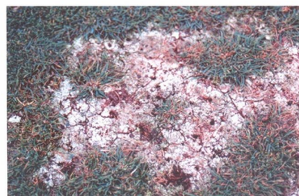
Figure 1. White surface crust on soil with high salt accumulation.