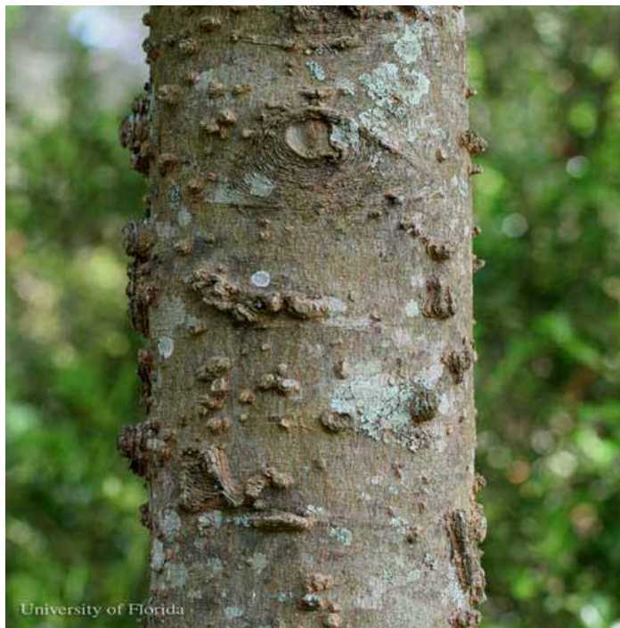
Figure 8. Warty trunk of the sugarberry, Celtis laevigata Willd., a host of the mourning cloak butterfly, Nymphalis antiopa (Linnaeus) in Florida.