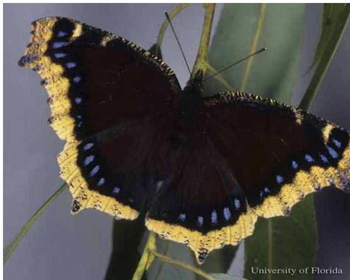
Figure 1. Dorsal view of wings of an adult mourning cloak, Nymphalis antiopa (Linnaeus), reared from larva collected by Don Hall in Beltrami County, Minnesota.

The wing spread of adults is approximately 3.0 inches. The upper surface of the wings is deep maroon with a sub-marginal black band containing a series of powder blue spots and a yellow marginal band. The ventral side of the wings is black — resembling charred wood and with a marginal whitish-yellow band.