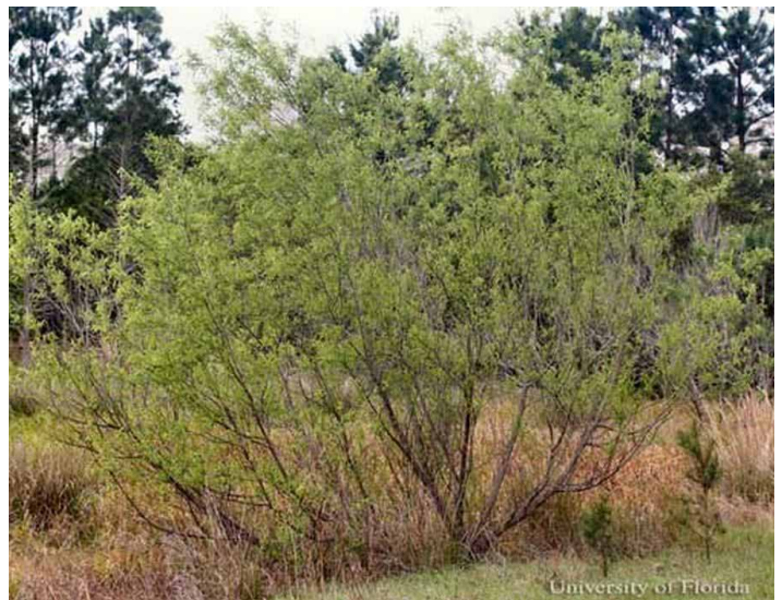
Figure 5. Carolina willow, Salix caroliniana Michx., a host of the mourning cloak butterfly, Nymphalis antiopa (Linnaeus).

In northern areas where it is common, mourning cloak caterpillars (sometimes called spiny elm caterpillars) may become pests on shade trees — seriously defoliating willows and elms and less frequently poplars, birches, hackberries and lindens, but they are readily controlled with insecticidal formulations of Bacillus thuringiensis (Johnson and Lyon 1988).