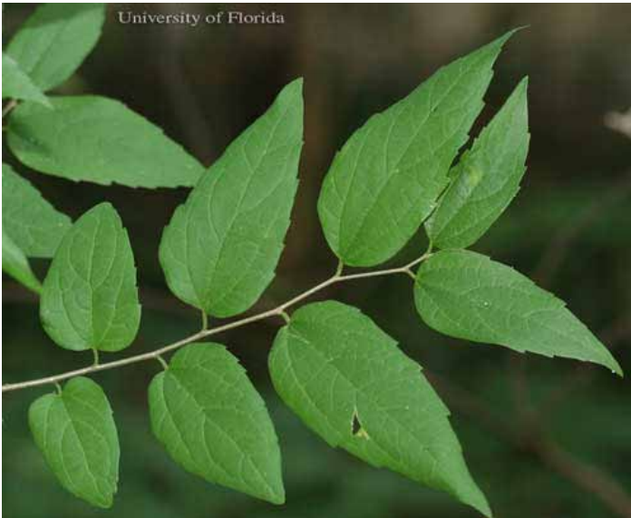
Figure 7. Sugarberry, Celtis laevigata Willd., a host of the mourning cloak butterfly, Nymphalis antiopa (Linnaeus) in Florida.