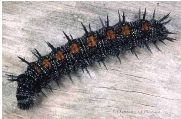
Figure 3. Larva of a mourning cloak, Nymphalis antiopa (Linnaeus), collected in Montgomery County, Virginia.

Full grown larvae are approximately 2.0 inches in length (Minno et al. 2005). The head is black with white hairs. The body is black, covered with small white dots and numerous white hairs. There is a transverse row of stout branched spines (scoli) on each segment, and most segments have a mid-dorsal reddish orange patch.