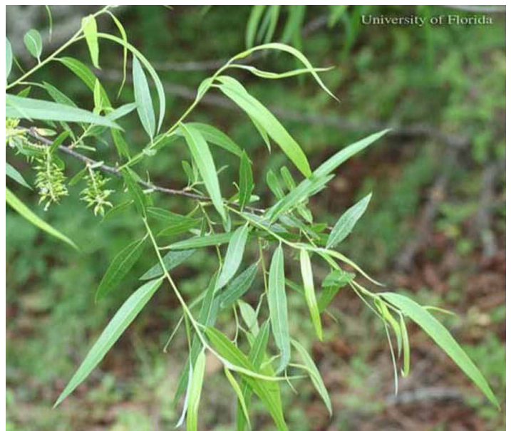
Figure 6. Carolina willow, Salix caroliniana Michx., a host of the mourning cloak butterfly, Nymphalis antiopa (Linnaeus).