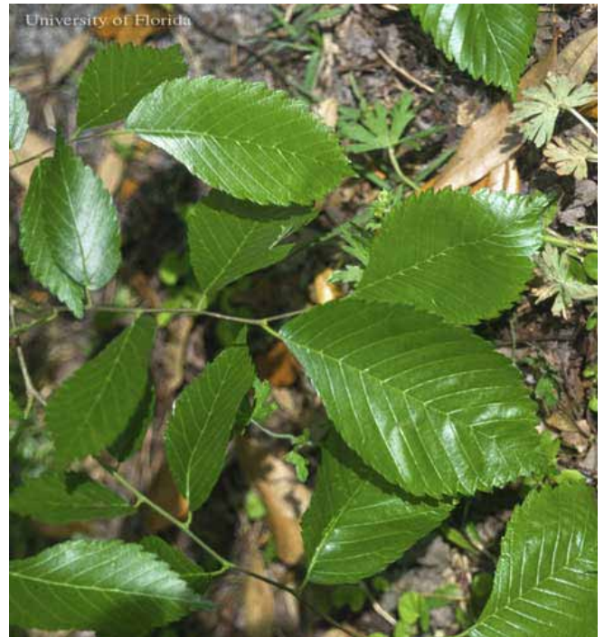
Figure 9. American elm, Ulmus americana L., a host of the mourning cloak butterfly, Nymphalis antiopa (Linnaeus).