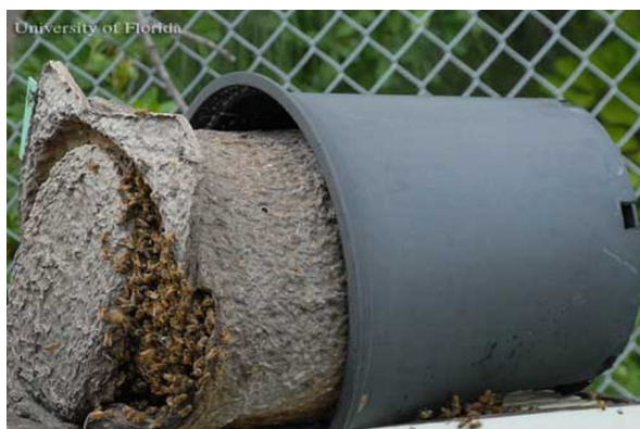
Figure 7. African honey bee, Apis mellifera scutellata Lepeletier, colony that has established itself in a swarm trap.

If an attack occurs, remembering a few simple recommendations will increase one's chances of minimizing the effects and severity of the attack. If attacked, a victim should run away from the area using his shirt to cover his head and especially airways. Running through tall grass or small trees will help to disrupt the attacking bees. The victim should not stand and swat at the bees. The bees are defending their nest, and the victim needs to get away from that nest as quickly as possible. It is important that the victim get cover in a bee-proof vehicle or structure if either is available. One should not jump into the water or hide in bushes. The bees can remain defensive and in the area for some period of time, thus increasing the risk to the victim. If stung, the victim should remove the stinger quickly by scraping it rather than by pulling it. One should see a doctor immediately if breathing is affected.