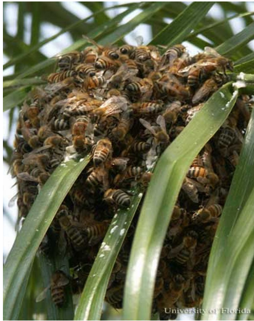
Figure 5. African honey bee, Apis mellifera scutellata Lepeletier, swarm on palm fronds.

considering a potential nesting site than are European bees. They will nest in a much smaller volume than European honey bees and have been found in water meter boxes, cement blocks, old tires, house eaves, barbecue grills, cavities in the ground, and hanging exposed from tree limbs, just to name a few places. One rarely finds European colonies in any of these locations because they prefer to nest in larger cavities like those provided by tree hollows, chimneys, etc. As one can imagine, humans inadvertently provide multiple nesting sites for African bees. Therein lies the primary reason African bees are encountered frequently by humans.