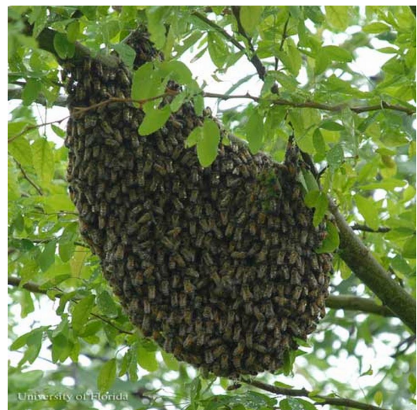
Figure 4. African honey bee, Apis mellifera scutellata Lepeletier, swarm in tree.

Another behavioral difference between African and European bees concerns colony level reproduction and nest abandonment. African honey bees swarm and abscond in greater frequencies than their European counterparts. Swarming, bee reproduction at the colony level, occurs when a single colony splits into two colonies, thus helping to ensuring survival of the species. European colonies commonly swarm one to three times per year. African colonies may swarm more than 10 times per year. African swarms tend to be smaller than European ones, but the swarming bees are docile in both races. Regardless, African colonies reproduce in greater numbers than European colonies, quickly saturating an area with African bees. Further, African bees abscond frequently (completely abandon the nest) during times of dearth or repeated nest disturbance while this behavior is atypical in European bees.