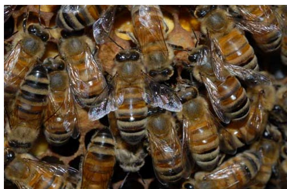
Figure 1. Adult African honey bees, Apis mellifera scutellata Lepeletier, on comb in colony.

Initially, only European subspecies of honey bees (hereafter referred to as European bees) were introduced into the Americas, where they were found to be productive in temperate North America, but less so in Central and South America where tropical/subtropical climates dominate. In response to