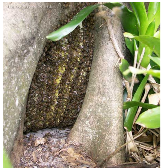
Figure 6. An African honey bee, Apis mellifera scutellata Lepeletier, colony between buttress roots of a tree.

Other behavioral differences between African and European races exist and are worth discussing briefly. For example, African bees are often more 'flighty' than European bees, meaning that when a colony is disturbed, more of the bees leave the nest rather than remain in the hive. African bees use more propolis (a derivative of saps and resins collected from various trees/plants) than do European bees. Propolis is used to weather-proof the nest and has various antibiotic properties. African colonies produce proportionally more drones (male bees) than European bees. Their colonies grow faster and tend to be smaller than European colonies. Finally, they tend to store proportionately less food (honey) than European bees, likely a remnant of being native to an environment where food resources are available throughout the year.