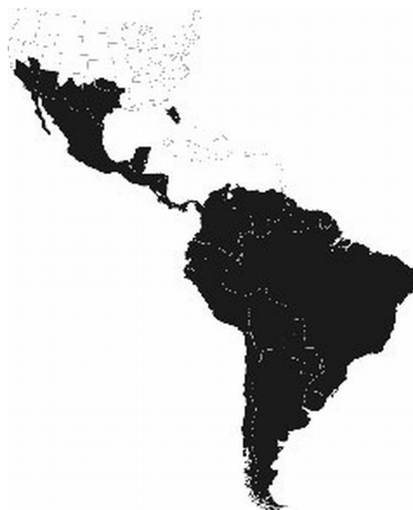
Figure 3. Distribution of Apis mellifera scutellata in the Americas as of 2007.