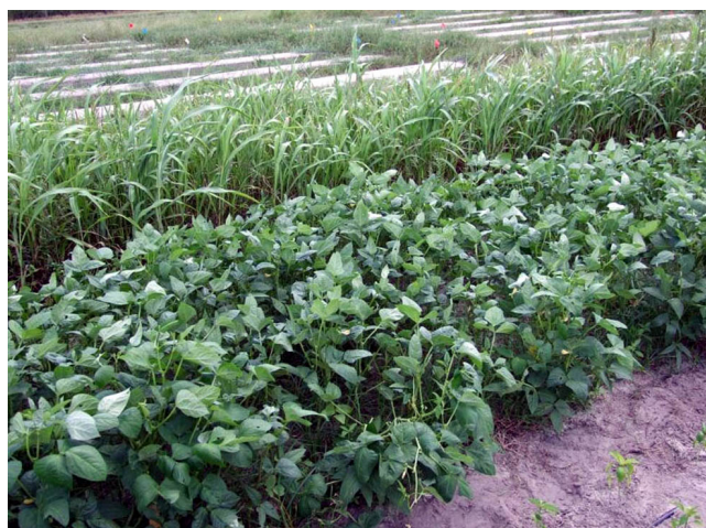
Figure 5. Cowpea with young sorghum x sudangrass in the back.

can be used as a rotation crop to reduce nematode numbers, has several cultivars that are quite different in their ability to support reproduction of the root-knot nematode Meloidogyne incognita . Planted into the sandy soils of Florida, the cultivars Tennessee Brown, Mississippi Silver, and California Blackeye #5 inhibited reproduction more effectively than the cultivar Purple Knuckle (intermediate). Population densities were high after planting the cultivars Whippoorwill, Pinkeye Purplehull, and Texas Purplehull (Gallaher and McSorley 1993). Iron Clay is another cowpea cultivar that is known to reduce population levels of M. incognita (McSorley 1999).