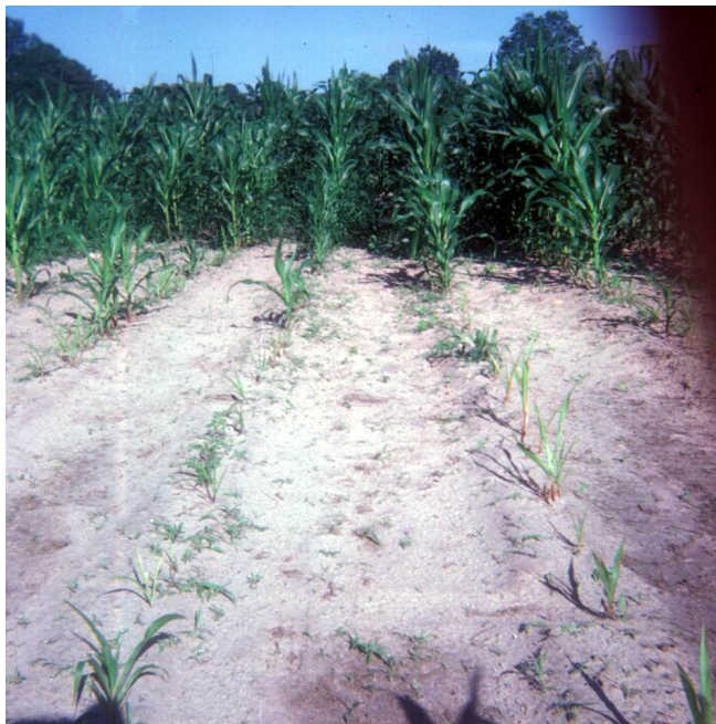
Figure 3. Symptoms caused by plant parasitic nematodes: severe stunting in corn.

provides an infection route for other organisms such as bacteria or fungi, since nematode activity creates an entryway into the root that would otherwise not be available. Nematode reproduction is very fast. On average, a typical life cycle may be only 30 days at summer temperatures. This means that even if nematode numbers are low at the beginning of the growing season, nematode populations can rapidly increase and can become harmful to the crop in a relatively short period of time.