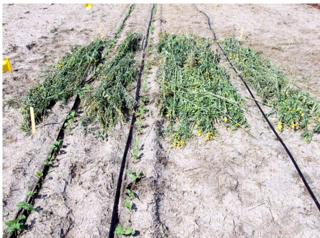
Figure 9. Organic amendments: Sunn hemp mulch applied to beans.

this was not necessarily due to reduced nematode numbers.