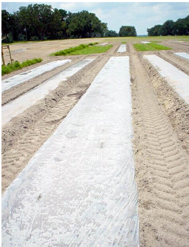
Figure 8. Solarization.

the success of solarization (DeVay 1991, Katan 1980). Soil temperatures only rise to detrimental levels in the first 10 to 30 cm of soil (Katan 1987), and even in this range temperatures drop off as depth increases. The plastic has to be sealed to prevent air movement underneath the plastic, which would prevent temperatures from rising sufficiently.