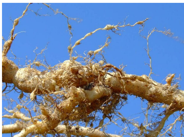
Figure 4. Root galls caused by root-knot nematodes.

Often, the most damaging nematodes in the southeastern United States and the tropics are root-knot nematodes ( Meloidogyne spp.). These nematodes are pests of nearly all major crops and are therefore widespread. Damage can be directly observed by examining the roots, because root-knot nematodes produce galls or knot-like swellings along the plant roots (Figure 4). These galls cannot be easily removed because they are part of the plant root tissue. In contrast, nodules caused by beneficial nitrogen fixing bacteria can be easily removed. Another method to distinguish nematode galls from nodules is to slice them in half and expose to air, which will cause nitrogen-fixing nodules to appear pink or red if the bacterial colony is active, or green or brown if the colony is inactive.