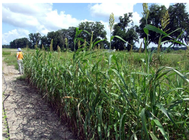
Figure 6. Mature sorghum x sudangrass.