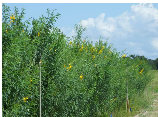
Figure 7. Sunn hemp starting to show flowers.

Tillage. Tillage and the practice of fallowing fields may appear as alternatives to cover crops for nematode management. Tillage inverts and mixes soil and exposes deeper soil layers to the sun. This practice is meant to kill nematodes by desiccation, since nematodes depend on moisture for survival. This practice may kill some of the nematodes that are in the upper soil layers, however it will not reach nematodes that have retreated into moderate or deeper soil layers. Nematodes can retreat to depths greater than 12 inches (30 cm) in Florida soils, and can migrate upward once a susceptible host is planted. Once a field has been fallowed, nematodes will move into deeper soil layers to avoid drying and may enter an inactive stage that enables them to survive periods without food and in addition protects them from desiccation. McSorley and Gallaher (1993) compared the effects of tillage versus crop rotation on nematode densities in tropical corn ( Zea