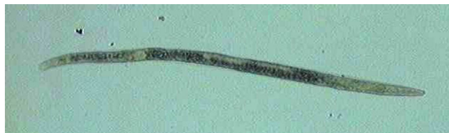
Figure 1. A typical plant parasitic nematode.

Nematodes are usually microscopic in size and are classified as unsegmented worms, belonging to the Phylum Nematoda (Figure 1). Plant-parasitic nematodes are a concern for growers of agricultural or garden crops. These plant-parasitic nematodes will mainly feed on the roots of plants. A few kinds will feed on foliage but this not common. Many other kinds of nematodes are present in the soil as well. These include decomposers, predators, insect parasites, and animal parasites. Some nematodes are aquatic and do not affect terrestrial plants. Other nematodes act as decomposers, predators, and insect parasites. In farming systems, nematode predators and parasites of insects are beneficial, while nematode parasites of animals and plants are considered pests in agriculture. Beneficial nematodes that feed on either bacteria or fungi help in nutrient cycling by accelerating the decomposition of organic matter (Figure 2). Predatory nematodes may keep harmful nematodes at lower levels by feeding on them. Entomopathogenic nematodes (nematodes harmful to insects) may help to reduce numbers of some insect pests by infecting them with bacteria. The objectives of this publication are to provide information on plant parasitic nematodes causing damage in organic agriculture and to introduce methods for their management.