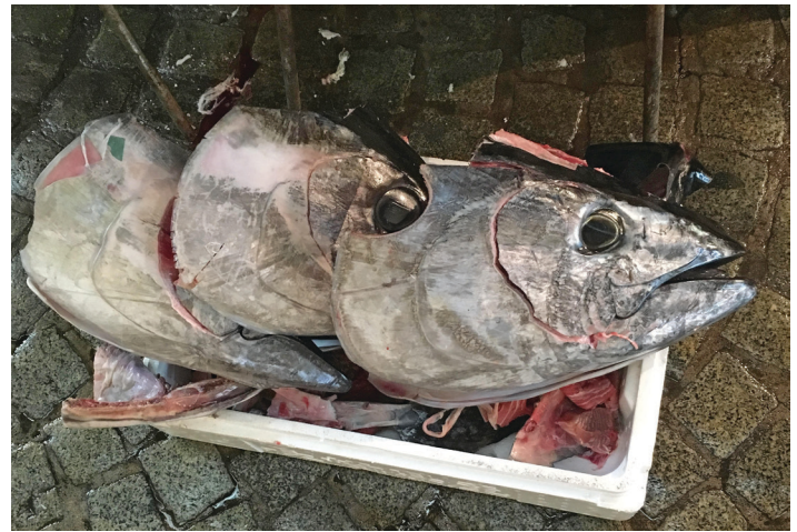
Figure 2. Sustainable fishing depends on stock assessments.

So what are stock assessment models? Similar to the way that meteorologists model hurricane trajectories to predict impacts, fisheries biologists are able to model fish populations to predict their response to fishing (or lack thereof). Stock assessments models are mathematical equations that describe how fish grow, how they reproduce, and how they die. How they die is often the key, because fisheries biologists usually separate out mortality due to natural causes from mortality due to fishing. That way they can tell what the stock might look like without fishing, and how the stock might respond to different levels of fishing. These mathematical representations of fish populations and fishing are fine-tuned or “fitted” to existing historical fisheries data through a statistical process. A stock assessment model is simply a mathematical representation that indicates a fishery’s status, the historical productivity of a stock, and how components of the stock have changed over time. They allow scientists to make the best possible predictions about the effects of fishing on fish populations, and eventually, the most appropriate management actions.