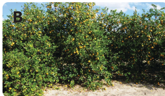
CLas-positive Valencia trees in central (A) and southwest (B) Florida (high psyllid pressure) under an intensive nutrition and irrigation program. These trees yielded more than 2.5 boxes per tree.