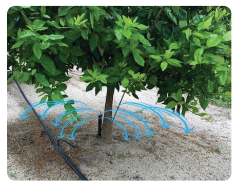
Fertilizer should be applied in the wetted zone of the soil where the irrigation water falls.

The Institute of Food and Agricultural Sciences (IFAS) is an Equal Opportunity Institution authorized to provide research, educational information and other services only to individuals and institutions that function with non-discrimination with respect to race, creed, color, religion, age, disability, sex, sexual orientation, marital status, national origin, political opinions or affiliations. For more information on obtaining other UF/IFAS Extension publications, contact your county's UF/IFAS Extension office. U.S. Department of Agriculture, UF/IFAS Extension Service, University of Florida, IFAS, Florida A & M University Cooperative Extension Program, and Boards of County Commissioners Cooperating. Nick T. Place, dean for UF/IFAS Extension.