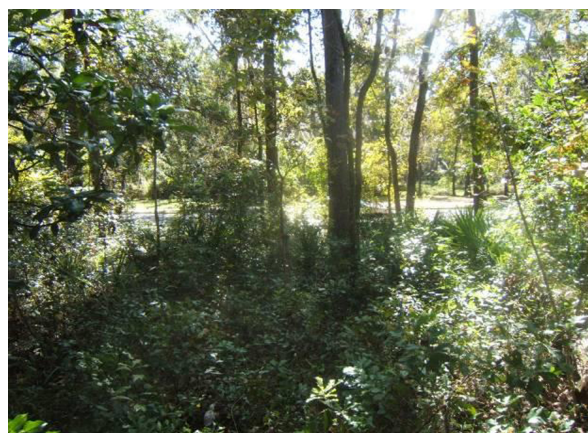
Figure 2. The edge of an urban forest remnant on the University of Florida campus. Note the densely vegetated understory with seedlings of mature overstory species (largely water oak, Quercus nigra , and vines).

Even though their sizes, shapes and locations often mean that forest remnants do not contain a functional "interior" habitat, the remaining habitat in such remnants may still provide cover from predators, foraging and breeding opportunities, and migration stop-over habitat. Moreover, such habitat can also act as a refuge from human disturbance for a