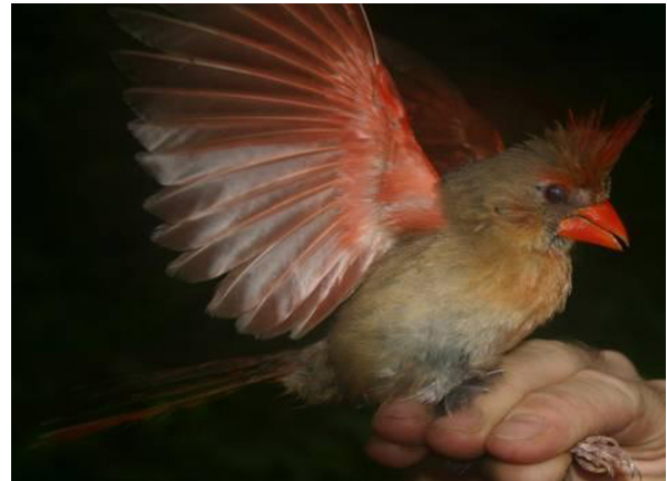
Figure 3. Northern Cardinal ( Cardinalis cardinalis ), a common summer resident of urban forest remnants.

30 species were observed during the summer, out of a total of 66 for the year (Table 1).