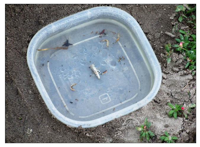
Figure 1. Plastic sandwich box used as pitfall trap.

surface (Figure 1). These containers were filled three quarters with water, along with 3 to 4 drops of any kind of dish detergent to break surface tension, to ensure that the insects would remain in the trap. We set traps out in the morning and collected them at a similar time the next day, so that insects were collected for one whole day. Traps were brought back to the laboratory, contents removed, and preserved in 70% ethanol in vials for future examination. It is important to check traps daily to prevent decay of the specimens and evaporation of water.