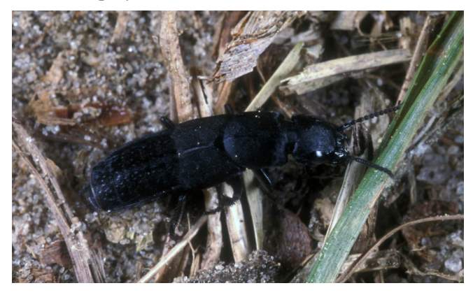
Figure 7. Rove beetle, Family Staphylinidae.

predators. Some of the more common beetles on the soil surface are: rove beetles (Staphylinidae) (Figure 7), ground beetles (Carabidae) (Figure 8), and tiger beetles (Cicindellidae) (Figure 9), which are predators that feed on other insects. Click beetles (Elateridae) (Figure 10) and leaf-feeding beetles (Chrysomelidae) (Figure 11) feed on vegetation. Many different species are present within these families. Chrysomelid beetles may be found on the soil surface around the base of plants, where they may have fallen from vegetation. Higher numbers of Staphylinidae and Carabidae were found in un-mulched plots than in mulched plots, possibly because it was easier for them to move around to hunt and locate prey.