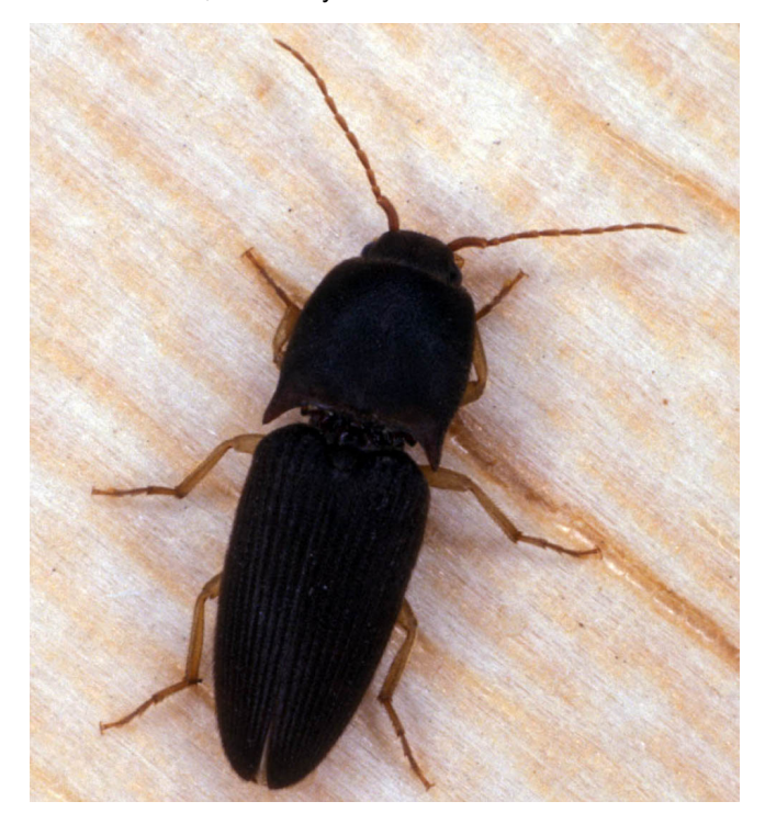
Figure 10. Click beetle, Family Elateridae.

more information on spiders, see http://edis.ifas.ufl.edu/mg206.