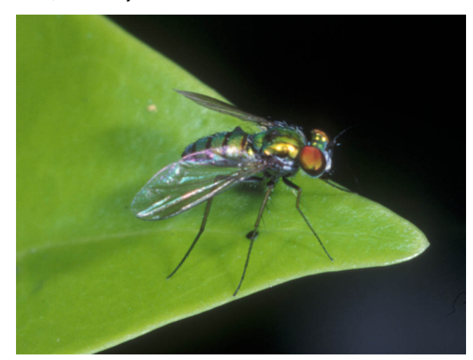
Figure 16. Long-legged flies, Family Dolichopodidae.