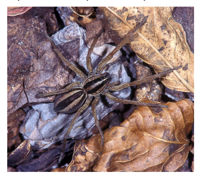
Figure 12. Spiders are generalist predators of different insects.

Lesser cornstalk borer (Lepidoptera, family Pyralidae): The caterpillar of the lesser cornstalk borer feeds at the base of the plant, sometimes tunneling inside the stem. Their feeding can lead to heavy plant mortality on many economic crops. The lesser cornstalk borer prefers dry and hot conditions and is called a pest of dry land. In north Florida, we observed heavy mortality to bean plants in spring and summer, with fewer problems in the fall. For more information on the lesser cornstalk borer, see http://edis.ifas.ufl.edu/in312.