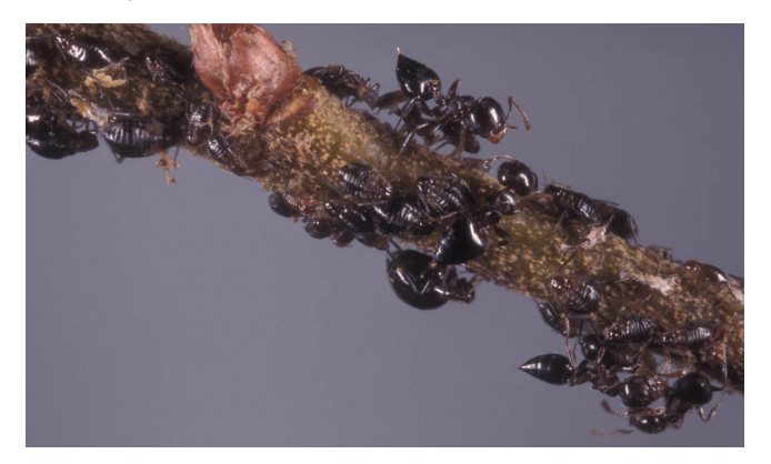
Figure 5. Ants tending aphids, which act as source of honey dew.