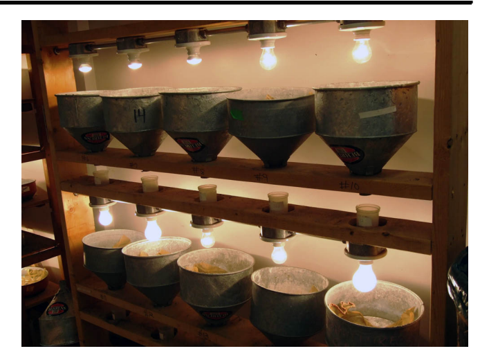
Figure 3. Berlese funnel set up.

3) Berlese funnel: This method can be helpful in sampling insects in debris and leaf litter on the soil surface. However, this method is more often used for sampling insects living in soil and leaf litter rather than on the soil surface. Also, it requires more equipment than the more simple pitfall or board traps. The trap looks like a funnel containing a piece of screen or cloth with a killing jar of alcohol below the funnel. An electric bulb is placed above the funnel and the material to be sampled is placed on the screen or cloth (Figure 3). As the upper part of the material dries from the heat of the bulb, insects move downward and eventually fall into the killing jar. Berlese funnels are useful for sampling leaf litter on the soil surface. The low amount of litter is one reason why these traps are not very useful for agricultural fields. Also, the sandy soils of Florida lead to dirty samples in Berlese traps, because of the amount of sand that falls through into the killing jar.