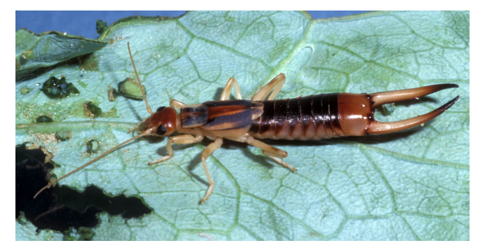
Figure 13. Earwigs, Order Dermaptera.

Earwigs hide in dark places such as cracks, crevices, under bark, and in plant debris, and therefore are easily collected under wooden board traps. For more information on earwigs, see http://edis.ifas.ufl.edu/ig093.