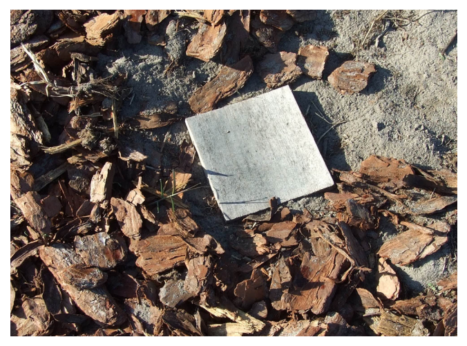
Figure 2. Flat piece of wood used as board trap.

2) Board traps: These "traps" can provide a hiding place for insects on the soil surface. They are simply flat pieces of wood, and were first used by Cole (1946). We used a wooden board (15cm x 15 cm x 2.5 cm thick) temporarily placed on the soil surface (Figure 2). Boards were left in place for several weeks, and then the boards were lifted and the soil surface underneath was quickly examined for insects that had been hiding under the board. Arthropods must be identified, counted, or collected quickly, before they run away. Usually a pitfall trap will collect more insects in a day than a board trap will collect in several weeks.