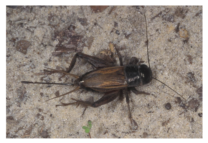
Figure 15. Field cricket, Family Gryllidae.