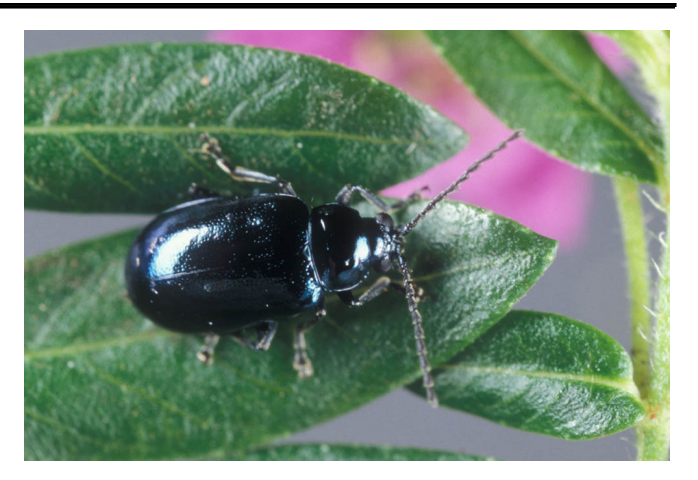
Figure 11. Leaf feeding flea beetle, Family Chrysomelidae.