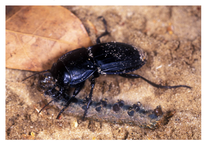
Figure 8. Ground beetle feeding on caterpillar, Family Carabidae.

Spiders (Araneae): Their size varies from small to large depending on species. Some spiders hide under wood or other materials, while others move actively on the soil surface. Spiders are generalist predators of small-sized insects (Figure 12). For