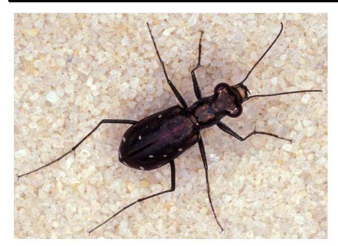
Figure 9. Tiger beetle, Family Cicindellidae.