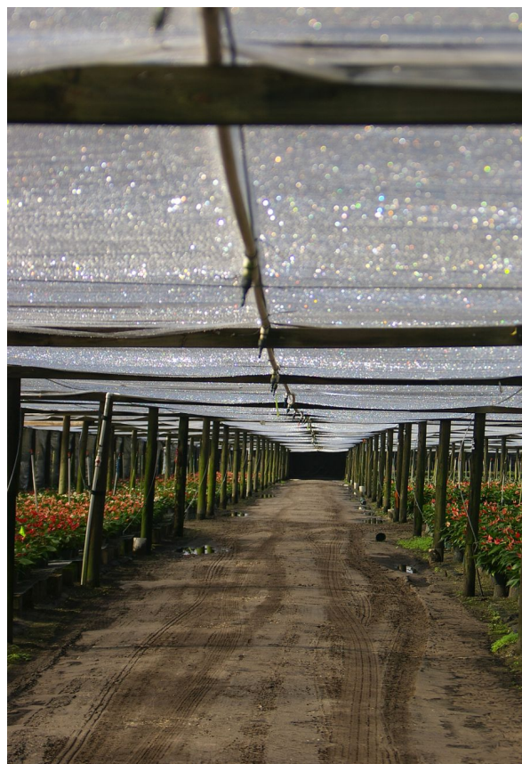
Figure 2. Over-the-roadways mist cold protection system

Over-the-Roadways Mist Systems. Water is applied using mist nozzles installed over the roadways so that the water neither leaches through the plant beds nor directly wets the crop foliage (Fig. 2). This increases the moisture and heat content of the air and results in the formation of fog inside the shadehouse. In one shadehouse where an over-the-roadways mist system was used, water consumption was reduced by more than 50% compared to using the conventional over-the-bench mist irrigation system.