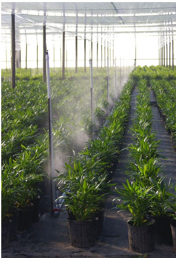
Figure 3. Among-the-plants low-pressure fog cold protection system.

Among-the-Plants Fog Systems: With these relatively new systems, the water is applied using low-pressure fog nozzles arranged among the plants (Fig. 3). Fog quickly fills the shadehouse and creates a radiant heat loss barrier. These systems have been shown to greatly reduce water requirements, compared even to the mist-based cold protection systems. It has been determined that a low-pressure fog system uses 86% less water compared to the over-the-roadway mist system mentioned above (Fig. 4).