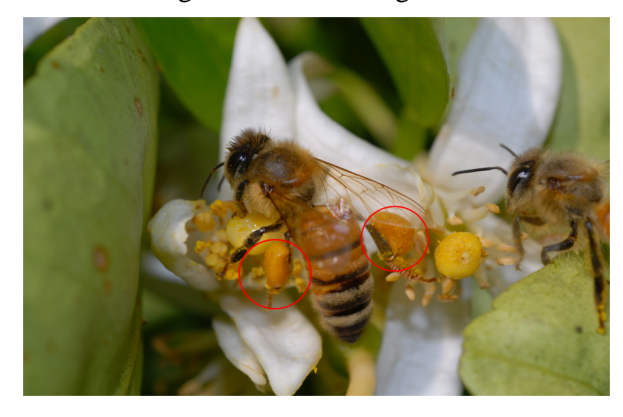
Figure 3. Worker bee carrying pollen in her pollen baskets.

colony's annual requirement for pollen has been estimated to range from 15 to 55 kg.