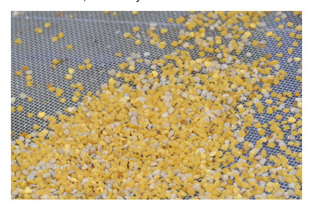
Figure 4. Pollen that has been collected from a pollen trap placed on the bottom board of a bee hive.

Bees require pollen for growth and development. Immature (larval) bees are fed a mixture of brood food and bee bread. Newly emerged bees consume bee bread so that their bodies can complete development. The amount of pollen required to rear a single worker larva has been estimated at 124-145 mg, this containing about 30 mg of protein. The minimum level of protein required for honey bees has been estimated to be between 20-25% crude protein. Pollens with protein levels in this range are more useful to colonies and allow them to meet their protein requirements readily. A diet of high protein pollen increases worker bee longevity, while brood rearing is reduced when supported by pollens low in protein.