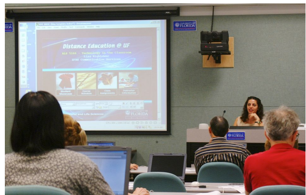
Figure 1. Computers and data projectors can place an image—such as this website—onto a screen for large audiences to see.