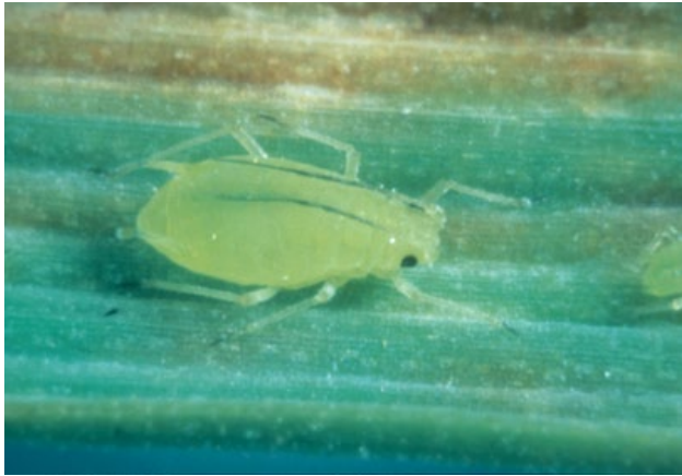
FIGURE 10. Greenbug ( Schizaphis graminum [Rondani])