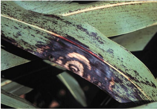
FIGURE 8. Zonate Leaf Spot ( Gloeocercospora sorghi ) Photo courtesy of the University of Georgia College of Agriculture and Environmental Sciences. Available at: http://plantpath.caes.uga.edu/extension/plants/fieldcrops/zonateleafspot.html .