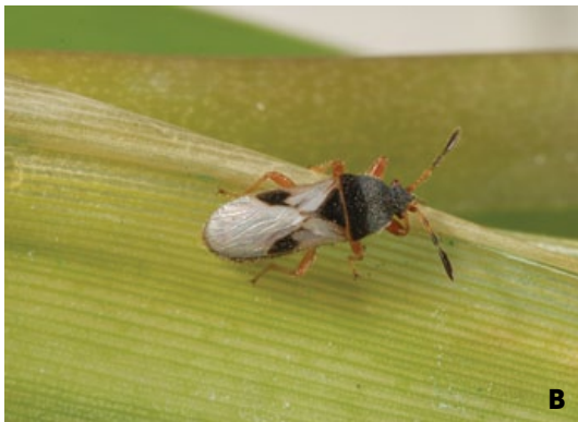
FIGURE 11 A, B. Chinch Bug ( Blissus insularis ); A. Nymph and B. Adult