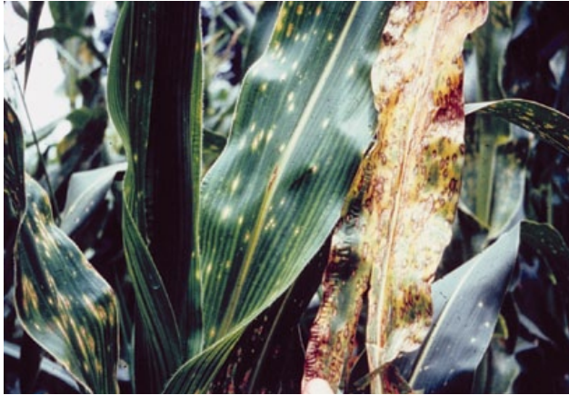
FIGURE 6. Northern Corn Leaf Blight ( Exserohilum turcicum ); pathogen also known as Bipolaris spp. or Helminthosporium spp.

Photo courtesy of Division of Plant Industry Archive, Florida Department of Agriculture and Consumer Services, Bugwood.org. Available at: http://www.ipmimages.org/browse/subimages.cfm?area=72&sub=16546 .