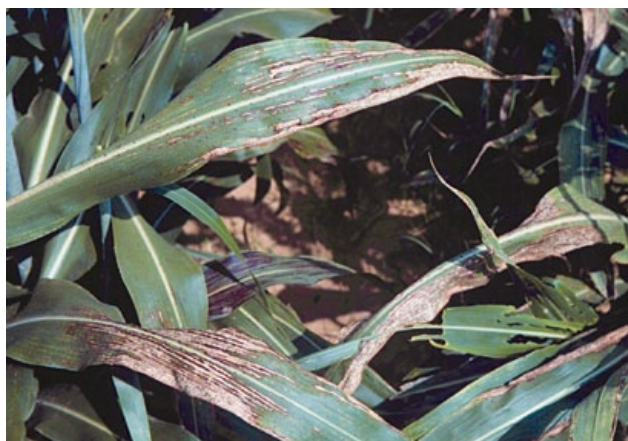
FIGURE 5. Bacterial Leaf Stripe ( Pseudomonas andropogonis )

Photo courtesy of the University of Georgia College of Agriculture and Environmental Sciences. Available at: http://plantpath.caes.uga.edu/extension/plants/fieldcrops/Bacterialleafstripe.html .