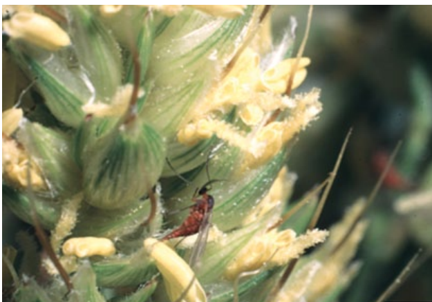
FIGURE 9. Sorghum Midge ( Contarinia sorghicola [Coquillett]) Photograph by Alton N. Sparks, Jr., University of Georgia, Bugwood.org. Available at: http://www.ipmimages.org/browse/detail.cfm?imgnum=1327122 .