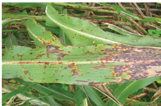
FIGURE 2 A,B. Anthracnose ( Colletotrichum sublineolum )