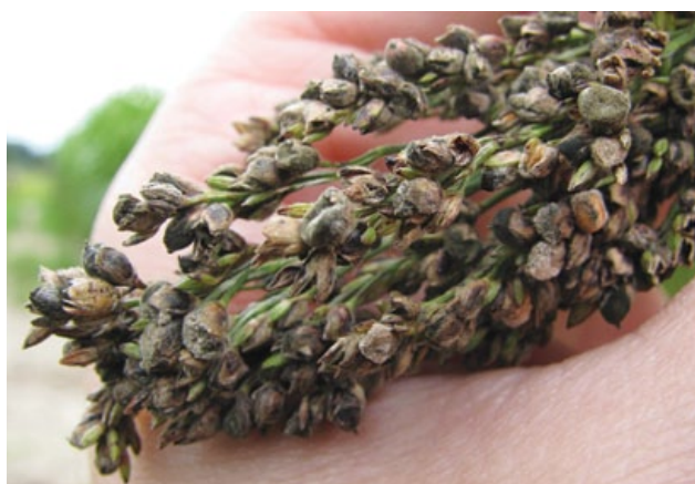
FIGURE 3. Head Mold ( Fusarium , Curvularia , Colletotrichum , Alternaria , and Bipolaris spp.)