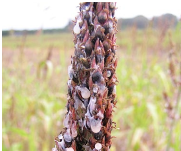
FIGURE 4. Ergot ( Claviceps africana )