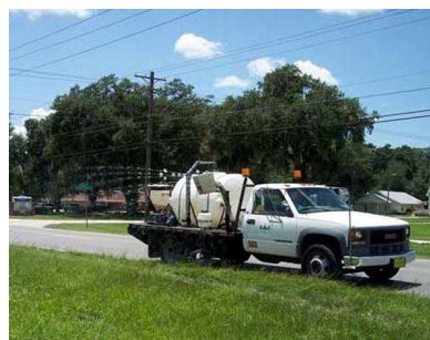
Figure 7. Invert emulsion formulations are useful for drift control along rights-of-way.

water, invert emulsion droplets shrink less; therefore, more pesticide reaches the target. The oil helps to reduce runoff and improves rain resistance. It also serves as a sticker-spreader by improving surface coverage and absorption. Because droplets are relatively large and heavy, it is difficult to get thorough coverage on the undersides of foliage. Invert emulsions are most commonly used along rights-of-way where drift to susceptible nontarget plants or sensitive areas can be a problem (Figure 7).