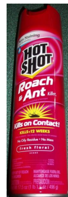
Figure 9. Ready-to-use aerosol insecticide.

Formulations for smoke or fog generators are aerosol formulations but not under pressure. They are used in machines that break the liquid formulation into a fine mist or fog (aerosol) using a rapidly whirling disk or heated surface. These formulations are used mainly for insect control in structures such as greenhouses and warehouses and for mosquito and biting fly control outdoors. Their advantages include: