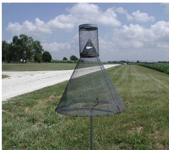
Figure 19. Insect cone trap containing pheromone.

to kill insects or retard fungal growth. Fertilizers also may be impregnated with pesticides.