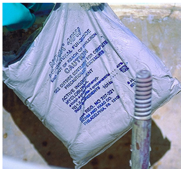
Figure 18. Water-soluble packet dissolves in the tank.

Water-soluble packets reduce the mixing and handling hazards of some highly toxic pesticides (Figure 18). Manufacturers package precise amounts of wettable powder or soluble powder formulations in a special type of plastic bag. When you drop these bags into a filled spray tank, they dissolve and release their contents to mix with the water. There are no risks of inhaling or contacting the undiluted pesticide as long as you do not open the packets. Once mixed with water, however, pesticides packaged in water-soluble packets are no safer than other diluted pesticides.