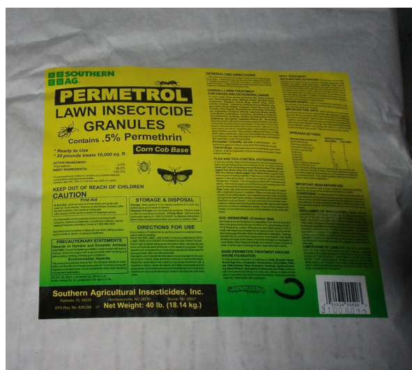
Figure 2. Granular, ready-to-use formulation.

A single active ingredient often is sold in several kinds of formulations. Abbreviations are frequently used to describe the formulation (e.g., WP for wettable powders); how the pesticide is used (e.g., TC for termiticide concentrate); or the characteristics of the formulation (e.g., ULV for an ultra-low-volume formulation). Common abbreviations and their interpretations are listed in Table 1. The amount of active ingredient (a.i.) and the kind of formulation are listed on the product label. For example, an 80% SP contains 80 percent by weight of active ingredient and is a "soluble powder." If it is in a 10-pound bag, it contains 8 pounds of a.i. and 2 pounds of inert ingredient. Liquid formulations indicate the amount of a.i. in pounds per gallon. For example, 1E means 1 pound, and 4E means 4 pounds of the a.i. per gallon in an emulsifiable concentrate formulation (Figure 3).