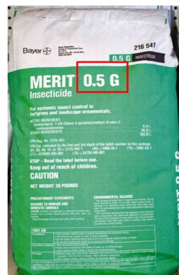
Figure 12. Granular formulations typically contain a low a.i. content.

Granular pesticides are most often used to apply chemicals to the soil to control weeds, fire ants, nematodes, and insects living in the soil or for absorption into plants through the roots (Figure 13). Granular formulations are sometimes applied by airplane or helicopter to minimize drift or to penetrate dense vegetation. Once applied, granules release the active ingredient slowly. Some granules require soil moisture to release the active ingredient. Granular formulations also are used to control larval