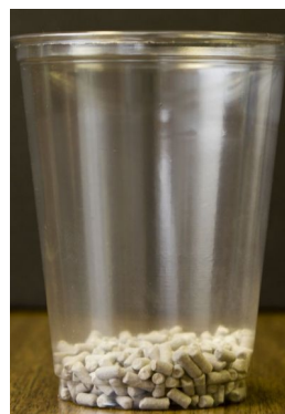
Figure 14. Pellet formulation.

Most pellet formulations are very similar to granular formulations; the terms often are used interchangeably. In a pellet formulation, however, all the particles are the same weight and shape (Figure 14). The uniformity of the particles allows use with precision application equipment. A few fumigants are formulated as pellets; some may be referred to as tablets (Figure 15). However, these are clearly labeled as fumigants. Do not confuse them with nonfumigant pellets.