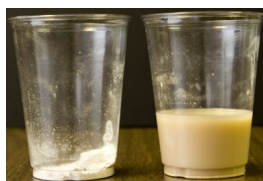
Figure 16. Undiluted and diluted wettable powder formulation.

usually must be mixed with water for application as a spray. A few products, however, may be applied either as a dust or as a wettable powder—the choice is left to the applicator. Wettable powders contain 5 to 95 percent active ingredient by weight, usually 50 percent or more. The particles do not dissolve in water. They settle out quickly unless constantly agitated to keep them suspended. Wettable powders are one of the most widely used pesticide formulations. They can be used for most pest problems and in most types of spray equipment where agitation is possible. Wettable powders have excellent residual activity. Because of their physical properties, most of the pesticide remains on the surface of treated porous materials such as concrete, plaster, and untreated wood. In such cases, only the water penetrates the material.