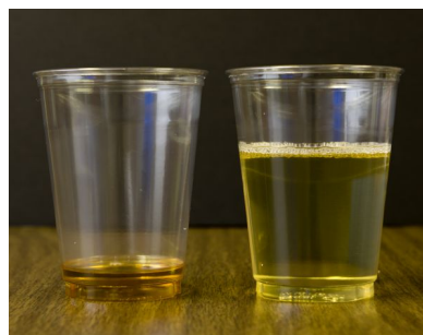
Figure 5. Undiluted and diluted solution formulation.

Some pesticide active ingredients dissolve readily in a liquid carrier, such as water or a petroleum-based solvent. When mixed with the carrier, they form a solution that does not settle out or separate (Figure 5). Formulations of these pesticides usually contain the active ingredient, the carrier, and one or more other ingredients.