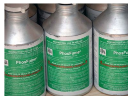
Figure 15. Fumigant formulated as tablets (pellets).