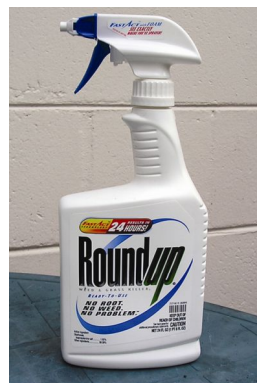
Figure 6. Ready-to-use diluted formulation.

Low-concentrate RTU formulations are ready to use and require no further dilution before application (Figure 6). They consist of a small amount of active ingredient (often 1 percent or less per unit volume) dissolved in an organic solvent. They usually do not stain fabrics nor have unpleasant odors. They are especially useful for structural and institutional pests and for household use. Major disadvantages of low-concentrate formulations include limited availability and high cost per unit of active ingredient.