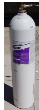
Figure 21. Gaseous fumigant stored under pressure. Credit: UF/IFAS Pesticide Information Office.

Fumigants are pesticides that form gases or vapors toxic to plants, animals, and microorganisms. Some active ingredients are formulated, packaged, and released as gases (Figure 21); others are liquids when packaged under high pressure and change to gases when they are released. Other active ingredients are volatile liquids when enclosed in an ordinary container and therefore are not formulated under pressure. Others are solids that release gases when applied under conditions of high humidity or in the presence of water vapor. Fumigants are used for structural pest control, in food and grain storage facilities, and in regulatory pest control at ports of entry and at state and national borders (Figure 22). In agricultural pest control, fumigants are used in soil, greenhouses, granaries, and grain bins (Figure 23).