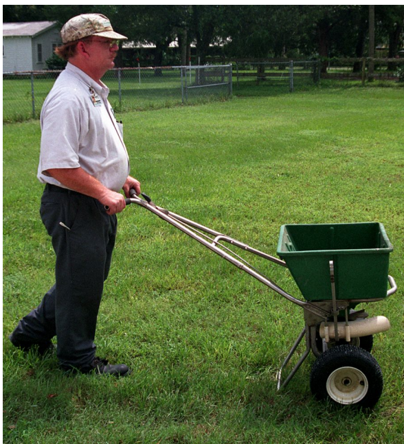
Figure 13. Granular formulations are often applied to the soil.

mosquitoes and other aquatic pests. Granules are used in agricultural, structural, ornamental, turf, aquatic, right-of-way, and public health (biting insect) pest control operations.