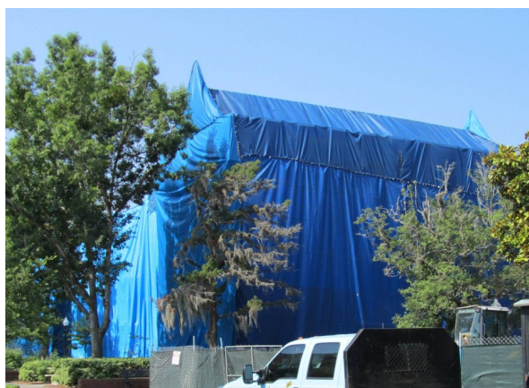
Figure 22. Structural fumigation of a dormitory on UF campus (June 2010).