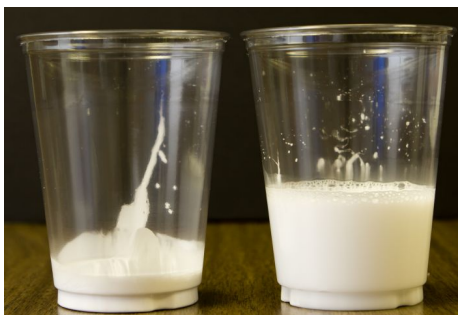
Figure 8. Undiluted and diluted liquid formulation.