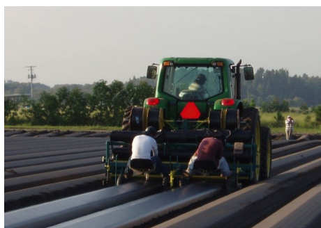
Figure 23. Soil fumigant application.