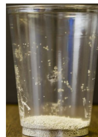
Figure 11. Granular pesticide formulation.

Granular formulations are similar to dust formulations except granular particles are larger and heavier (Figure 11). The coarse particles are made from materials such as clay, corncobs, or walnut shells. The active ingredient either coats the outside of the granules or is absorbed into them. The amount of active ingredient is relatively low, usually ranging from less than 1 to 15 percent by weight (Figure 12).