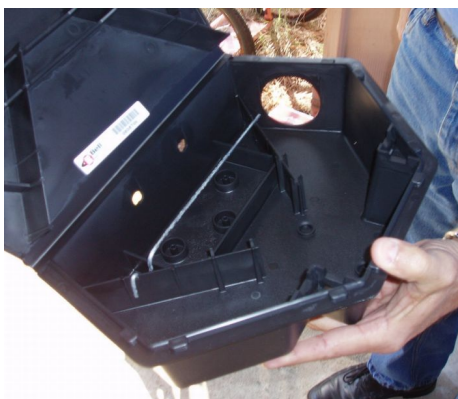
Figure 10. Tamper-resistant bait station.