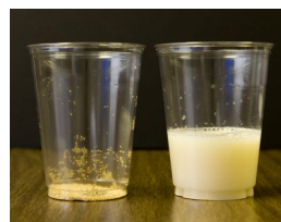
Figure 17. Undiluted and diluted dry flowable formulation.