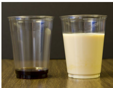
Figure 4. Undiluted and diluted emulsifiable concentrate formulation.

health pests. They are adaptable to many types of application equipment including portable sprayers, hydraulic sprayers, low-volume ground sprayers, mist blowers, and low-volume aircraft sprayers.