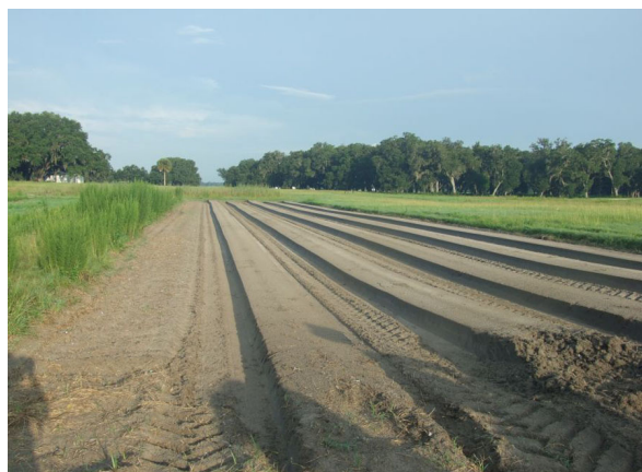
Figure 2. Raised beds, cleared and ready for solarization.

The plastic should be left in place with all edges buried for at least 6 weeks. After that, the plastic can be removed, and if the procedure was successful, weeds and soil pests should be reduced for 3-4 months (Fig. 9). Do not plant anything until the plastic is removed because the heat under clear plastic will kill seeds and plants! Disposal of used plastic can be a problem, especially if the plastic is not strong and breaks apart before or during removal (Fig. 10).