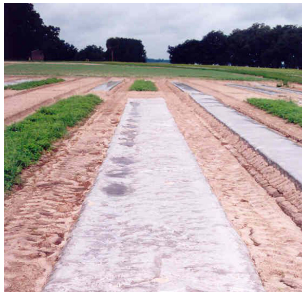
Figure 16. Puddles of water in low spots on plastic.

Raised beds are more work to prepare, but can be designed so water will run off. If water pools in low spots on the plastic (Fig. 16), it should not be a problem as long as the water is clear, since light will pass through. But if there is dirt in the puddle it will block light, so dirt or soil in the puddle should be washed away or removed, especially if the area is large.