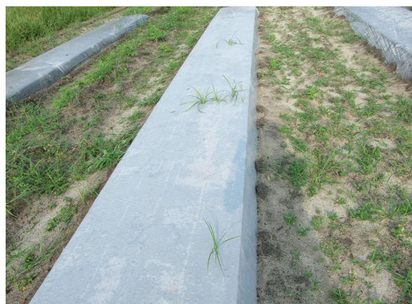
Figure 13. A few nutsedge plants emerging through plastic.