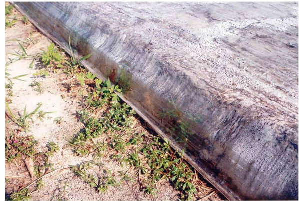
Figure 8. Weeds growing under loose plastic edges.