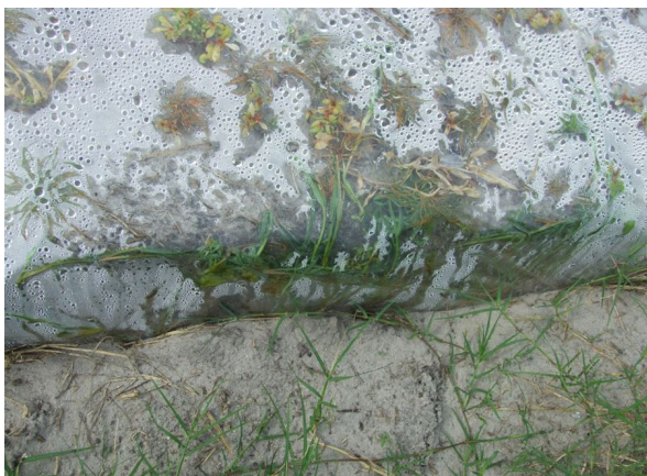
Figure 14. Advanced weed growth under plastic in a failed solarization.