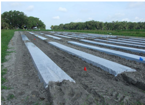
Figure 1. Overview of solarization in a field.

Soil solarization is a practice used to manage weeds, nematodes, diseases, and insects in soil (Fig. 1). The soil surface is covered with clear plastic, which allows sunlight to pass through and heat up the soil to temperatures that are lethal to many of these pests. If effective, solarization can reduce population levels of these pests for 3-4 months, sometimes longer. The benefits, risks, and use of solarization are the subject of a recent article that summarizes results of solarization tests in Florida (Krueger and McSorley, 2009). However, many people may be unaware of solarization or have not tried it. The method may be a convenient way for managing some soil pests in home gardens or small field sites. This