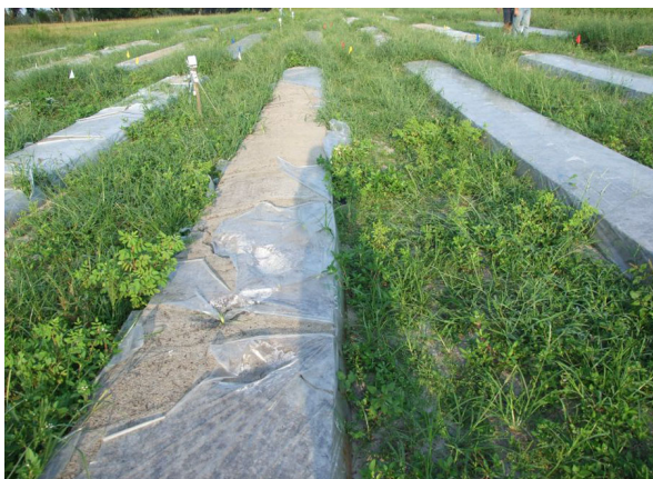
Figure 10. Plastic breaking apart after exposure to sunlight.