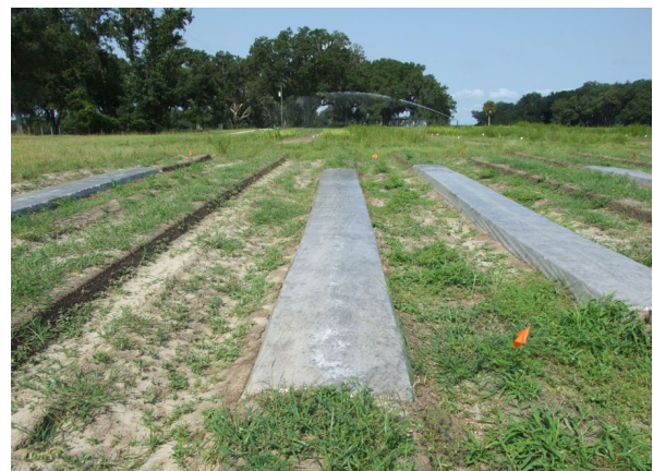
Figure 9. No weeds under clear plastic on solarized bed, compared to weeds on non-solarized bed on left.

immediately after that (double-cropping), the recolonizing pests and weeds may damage the second crop.