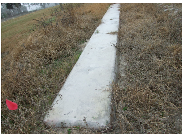
Figure 15. Small holes in plastic.