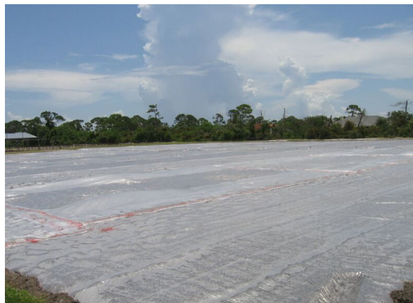
Figure 3. Solarization on flat ground.