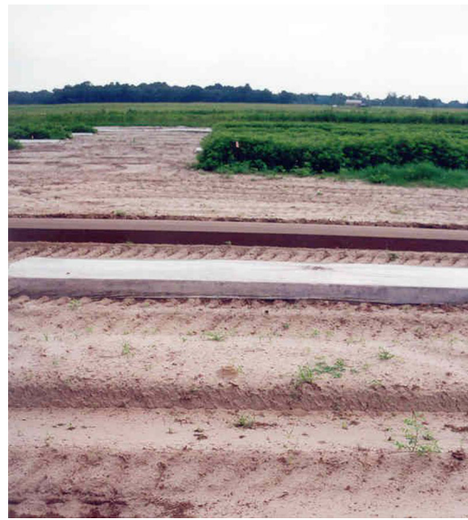
Figure 7. Plastic edges not sealed into soil.

solarized area. This re-invasion of the solarized soil usually takes about 3-4 months, so after that time, the effects of solarization diminish. Solarization is best used for short-season crops. Pests may be reduced in a vegetable or ornamental crop planted right after solarization, but if another crop is planted