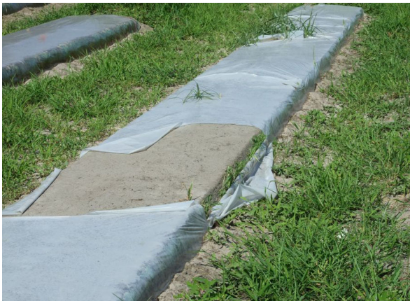
Figure 6. White plastic will not allow maximum sunlight to pass through. Note poor quality plastic breaking apart.

solarized area. This re-invasion of the solarized soil usually takes about 3-4 months, so after that time, the effects of solarization diminish. Solarization is best used for short-season crops. Pests may be reduced in a vegetable or ornamental crop planted right after solarization, but if another crop is planted