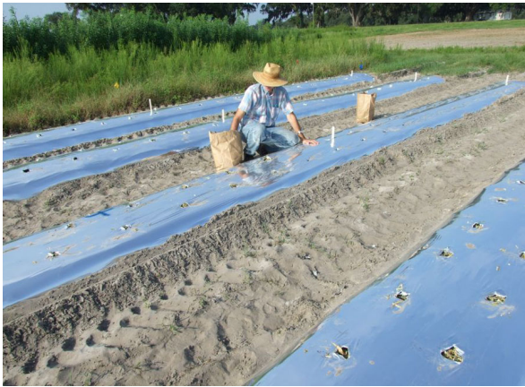
Figure 5. Silver reflective plastic will not pass sunlight to the soil below.