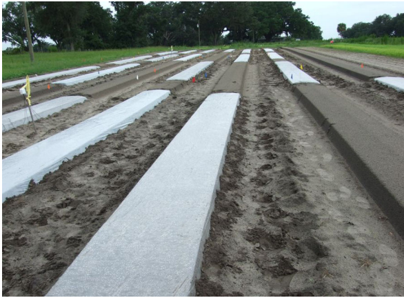
Figure 4. Note clear plastic on bed in center.