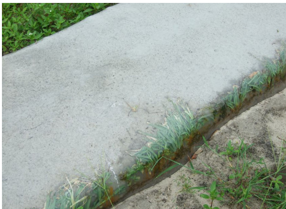
Figure 17. Weed growth on north side of a solarized bed oriented in an east-west direction.

edges of the beds are cooler, and weeds may grow on the edges, particularly on the north side of the bed (Fig. 17).