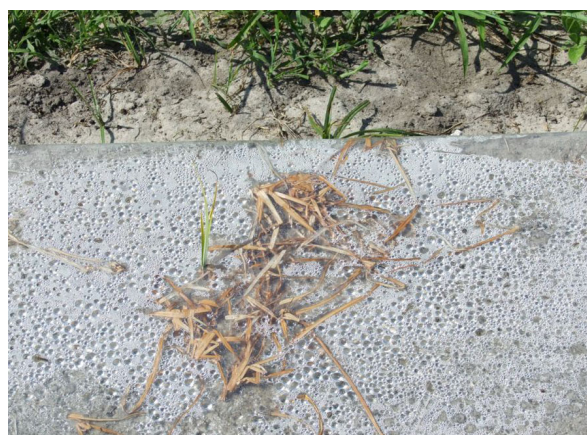
Figure 12. Nutsedge killed under clear plastic.