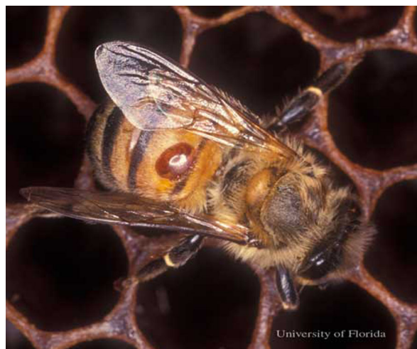
Figure 6. A female varroa mite, Varroa destructor Anderson & Trueman, feeds on the hemolymph of a worker bee. The mite is the oval, orange spot on the bee's abdomen.

Although small, varroa mites can be seen on adult bees with the naked eye. They often are found feeding between segments on the bees' abdomens or crawling quickly elsewhere on the bees' bodies.