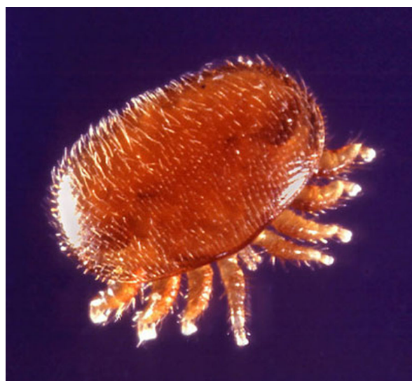
Figure 4. Dorsal view of adult varroa mite, Varroa destructor Anderson & Trueman.

Nymphs: Male and female protonymphs are undistinguishable without dissection. Protonymphs