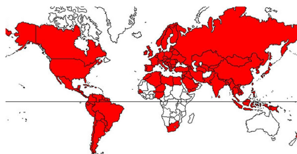
Figure 1. Current varroa mite distribution - 2010. Red areas indicate establishment of Varroa destructor .