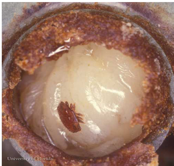
Figure 8. A female adult varroa mite, Varroa destructor Anderson & Trueman, feeds on the hemolymph of a honey bee pupa.

A much better way to look for varroa in a colony is to examine bee brood. It is easier to find mites on drone brood (although finding them on worker brood is possible) because (1) varroa mites are attracted to drone brood more strongly than they are to worker brood and (2) drone brood is easier to remove from the cells. Immature bee brood is white, making it very easy to see the reddish-brown varroa mite.