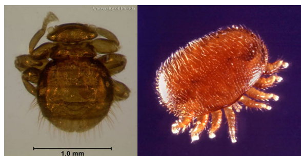
Figure 7. Dorsal views of an adult bee louse, Braula coeca Nitzsch, (left); and an adult varroa mite, Varroa destructor Anderson and Trueman, (right). Varroa mites are more oval in shape, and have eight legs as compared to the bee louse, which has six legs.

Varroa mites look very similar to another bee commensal, the bee louse, ( Braula coeca , Diptera: Braulidae) and this has led to mistaken identifications. Despite this, identifying them is simple if one remembers that the bee louse is a wingless fly with six legs, while varroa is a mite with eight legs.