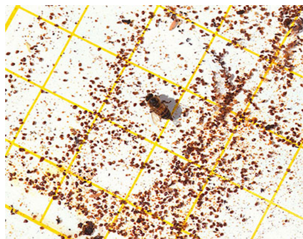
Figure 9. Parasitic varroa mites, Varroa destructor Anderson & Trueman, attached to a sticky board removed from the bottom of a beehive.

screen are present underneath the nest, the falling varroa will pass through the screen and get trapped on the sticky surface of the cardboard. Researchers have been able to correlate varroa mite fall in 24-, 48-, and 72 hour periods with actual varroa mite populations in the colony (Delaplane and Hood 1997). Sticky boards are useful because they sample the entire colony for the presence of varroa, rather than any subset of bees within the colony.