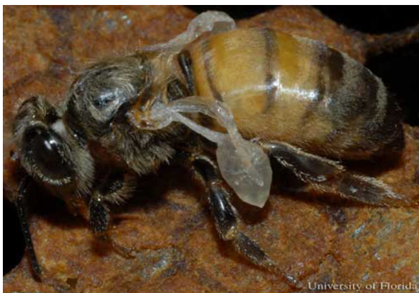
Figure 5. Newly emerged worker honey bee exhibiting symptoms of Deformed Wing Virus, which is transmitted by the varroa mite, Varroa destructor Anderson & Trueman.

To illustrate this point, one of the most telling signs of a varroa presence in a colony is the occurrence of newly-emerged adult bees with misshapen wings. A virus, called deformed wing virus (DWV) and present in immature bees, is responsible for this symptom. Bees with this virus are unable to use their wings. As such, the bees will never be able to contribute to the colony's foraging efforts since they never will be able to fly. Deformed wing virus can be so prevalent in maturing bees that they can emerge without any wings at all. Researchers suspect that other viruses play an important role in the varroa mite/honey bee relationship, but the roles of these viruses are not well understood.