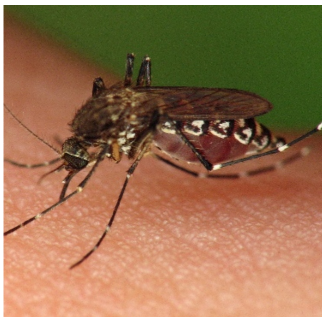
Figure 4. Aedes taeniorhynchus

Aedes taeniorhynchus (Wiedemann) – Black salt marsh mosquito (Figure 4). This species is not known as a typical container mosquito but it may infrequently take advantage of such sites if available. The species is predominantly a salt/brackish marsh inhabitant. It can bite day or night and can transmit dog heartworm. Even though this is primarily a coastal species, it can be found throughout the state of Florida.