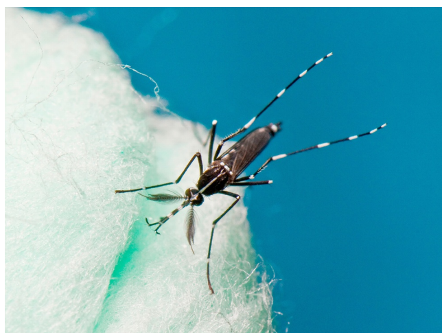
Figure 3. Aedes albopictus

Aedes albopictus (Skuse) – Asian tiger mosquito (Figure 3). Similar habitat requirements as the yellow fever mosquito, although may be more common in suburban and rural areas. This exotic, invasive species can be found in every Florida county, however, it has not been able to establish long-term populations in the Florida Keys.