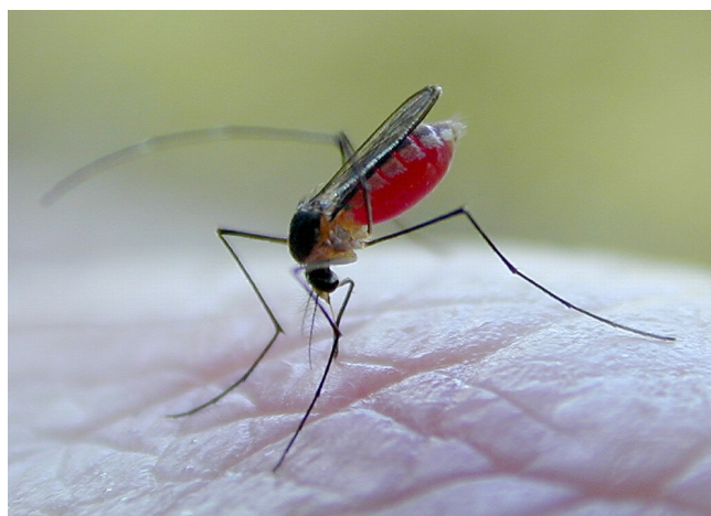
Figure 10. Wyeomyia vanduzeei

Wyeomyia vanduzeei Dyar and Knab (Figure 10). This mosquito also develops in the waters held in bromeliad leaf axils. It is a day biter not known to transmit any important diseases. The distribution of this species is limited to the distribution of bromeliad plants, and occurs throughout the southern peninsula of Florida.