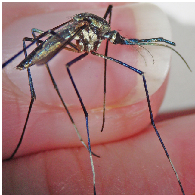
Figure 9. Toxorhynchites rutilus

Toxorhynchites rutilus (Coquillett) - Elephant mosquito (Figure 9). The larvae are predatory on other mosquito larvae and can be cannibalistic. Adults of these species are the largest in North America and are covered with iridescent scales. The females do not feed on blood, and therefore are not a concern for disease transmission. Males and females feed on nectar and other sources of sugar for energy. Tx. rutilus is wide-spread in Florida, but not abundant.