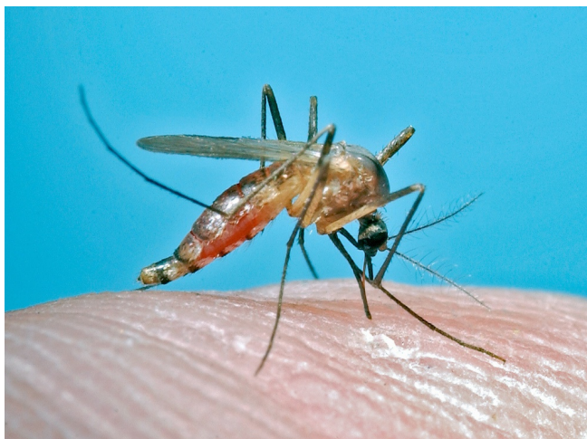
Figure 5. Aedes triseriatus

day. This species can be found in most Florida counties.