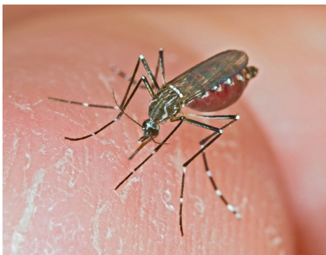
Figure 2. Aedes aegypti

Aedes aegypti (Linn.) – Yellow fever mosquito (Figure 2). Common container mosquito that will feed during the daytime indoors and out. Common in urban and suburban areas. Can transmit yellow fever, dengue, and chikungunya viruses and dogheartworm. This species is present throughout the state of Florida, but not in abundance except in the Florida Keys.