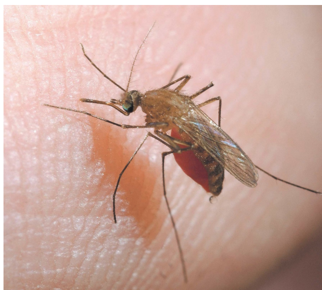
Figure 6. Culex nigripalpus

Cx. quinquefasciatus Say – Southern house mosquito (Figure 7). Common in polluted waters with high organic content, including containers, ditches, drains and catch basins, animal waste ponds, watering tanks, cesspits, and others. Mostly a night