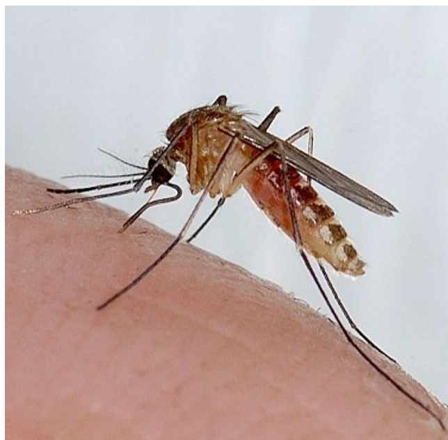
Figure 7. Culex quinquefasciatus

biter, but will bite indoors. This species can vector the viruses that cause West Nile and St. Louis encephalitis, although it is a secondary vector in Florida. Cx. quinquefasciatus occurs throughout the entire state.