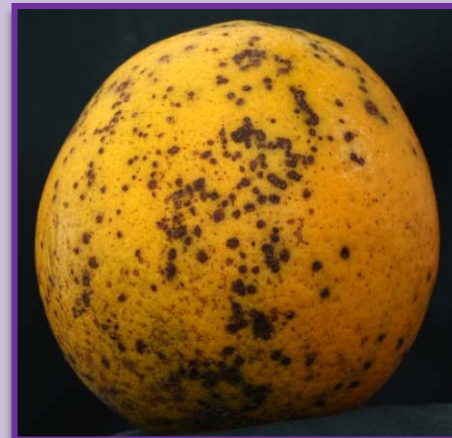
Small lesions that will likely develop into hard spot