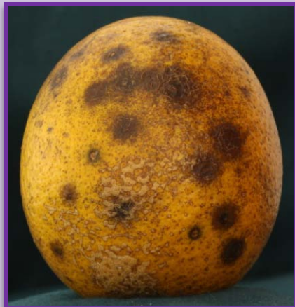
Cracked spot symptoms on 'Valencia'