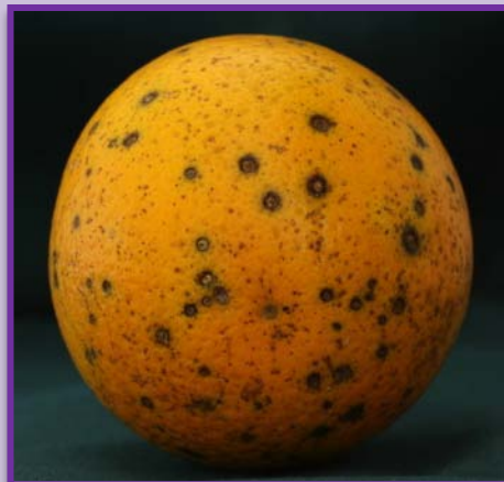
Hard spot symptoms on 'Valencia'