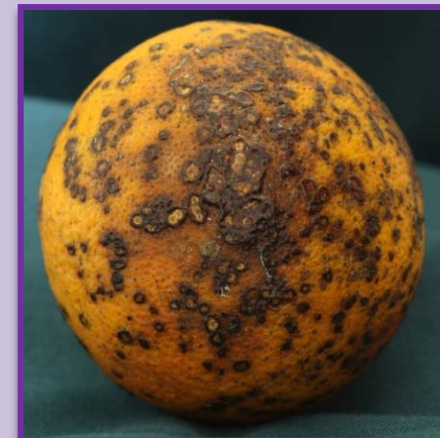
Severe hard spot symptoms on 'Valencia'

Fungal disease: Caused by Guignardia citricarpa (sexual stage) / Phyllosticta citricarpa (asexual stage)