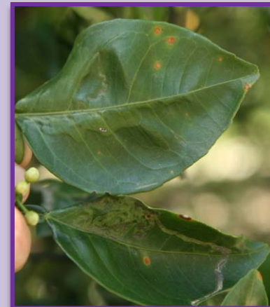
Young lesions on 'Valencia' leaves