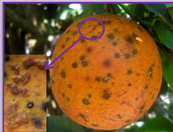
Early virulent (circled) and hard spot lesions with a close-up of virulent spots