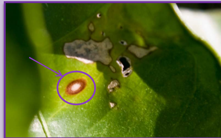
Leaf symptoms on 'Valencia'

4) Early virulent spot (freckle spot) – Small, reddish, irregularly shaped lesions. Occurs on mature fruit as well as postharvest in storage. Can develop into either virulent spot or hard spot. Virulent spot is caused by the expansion and/or fusion of other lesions covering most of the fruit surface toward the end of the season.