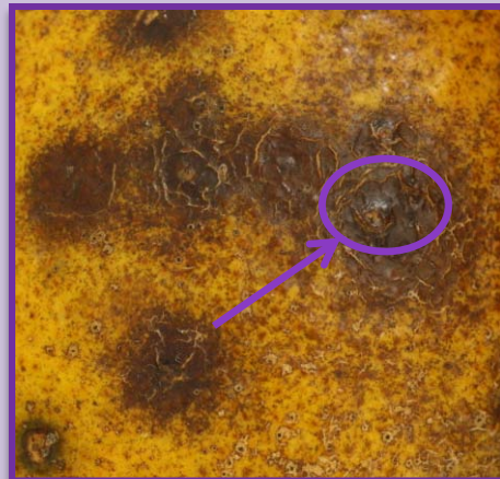
Close view of cracked spot with hard spots forming