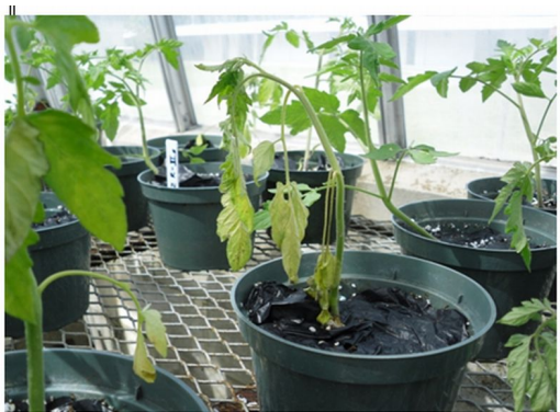
Figure 3. The development of progressive wilting on a tomato plant inoculated with S. rolfsii .

the cortical tissues, leading to girdling of the plant (Ferreira and Boley 1992). Unlike wilts of flowering vegetables caused by Fusarium and Verticillium spp., the wilted leaves of affected plants generally remain green and hang on the plant. These symptoms can initially be confused with bacterial wilt caused by Ralstonia spp. However, unlike bacterial wilt, white mycelia can be seen near the soil line, often forming a mat around affected plant parts and serving as a clear sign of the pathogen (Fig. 2). In addition, numerous tan, round, or irregular mustard-seed-sized sclerotia are produced on affected plant parts and the surrounding soil surface shortly after mycelial growth is observed (Fig. 4).