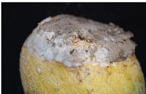
Figure 6. Cantaloupe infected with S. rolfisii .

produced by S. rolfisii . The teleomorph (sexual or perfect stage) of S. rolfisii is described as Athelia rolfisii (Curzi) Tu and Kimbrough (Tu and Kimbrough 1978). It produces a specialized structure (basidiocarp) that produces specialized spores (basidiospores) similar to other basidiomycetes (such as mushrooms, puffballs, stinkhorns, etc.). While it has been observed under lab conditions, it has rarely been observed in the field, and the exact role of basidiospores in disease epidemiology, if any, remains unclear (Punja 1985).