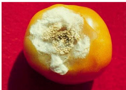
Figure 5. The formation of sclerotia on an infected tomato fruit.

Fruits can also be infected when in contact with soil or infected tissue, leading to a watery or mushy fruit rot with slightly sunken lesions on tomato, watermelon, and cantaloupe (Mullen 2001). Sclerotia can also develop on fruit (Figs. 5 and 6).