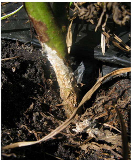
Figure 2. The development of a white hyphal mat of Scierlotium rolfsii around the base of an infected tomato plant and on the surrounding soil surface.