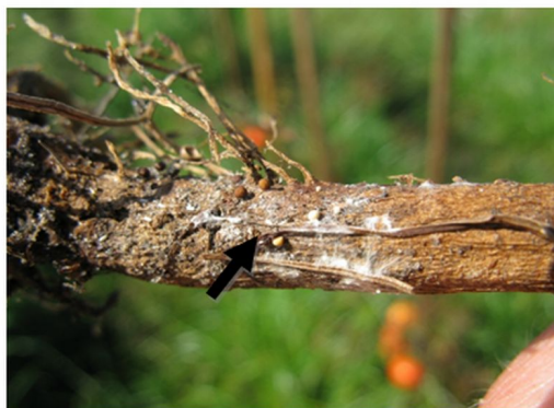
Figure 4. The formation of sclerotia (arrow) on infected crown tissues.

the cortical tissues, leading to girdling of the plant (Ferreira and Boley 1992). Unlike wilts of flowering vegetables caused by Fusarium and Verticillium spp., the wilted leaves of affected plants generally remain green and hang on the plant. These symptoms can initially be confused with bacterial wilt caused by Ralstonia spp. However, unlike bacterial wilt, white mycelia can be seen near the soil line, often forming a mat around affected plant parts and serving as a clear sign of the pathogen (Fig. 2). In addition, numerous tan, round, or irregular mustard-seed-sized sclerotia are produced on affected plant parts and the surrounding soil surface shortly after mycelial growth is observed (Fig. 4).