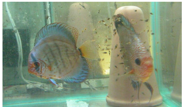
Figure 2. Discus young feed at first on the mucus secreted by their parents. (The ceramic object behind the fish in the foreground is a type of breeding cone.)

The feeding on the mucus was correlated with the onset of protease activity in the stomachs of the developing larvae. Protease activity has been found to be high at around 20 days post-hatch; it coincides with development of the gut in the fry and suggests that 20 days after hatching could be an appropriate time to implement a microdiet. When discus larvae have reached the appropriate size and it is no longer necessary for them to feed on parental mucus, they can be switched over to a diet consisting of Artemia nauplii , Spirulina powder, and rotifers. When examining the discus species for aquaculture, the problems associated with larval nutrition and development of a first feed need to be further explored in order to achieve a more controlled intensive culture.