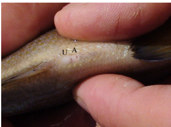
Figure 2. Strip-spawning of a pigfish male, displays milt expressed from the urogenital opening (U) posterior to the anus (A).

administered following manufacturer instructions. Spawning at 26°C (78.8°F) and 35 g/L salinity occurred within 48 hours of injection. The eggs are buoyant in seawater and were collected by sieving water skimmed from the surface through a mesh-screened collection device concentrating the eggs (unpublished data). The corocoro grunt, Orthopristis ruber , a cousin to the pigfish, has also been induced to spawn using LHRHa at a dose of 50 ng/kg female body weight and 25 ng/kg male body weight (Mata et al. 2004). Spawning began 28 hours after injection with an average fecundity of 120,000 eggs/female (Mata et al. 2004).