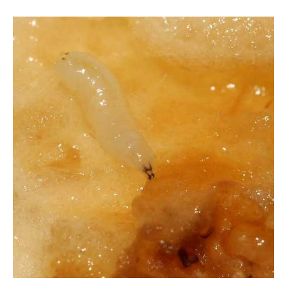
Figure 3. Larva of the apple maggot fly, Rhagoletis pomonella (Walsh).

Larvae are white or yellowish tapered maggots slightly smaller than those of the house fly. The maggots are about 1/2 inch in length and tapering toward the head. Key characters for the separation of the larval stage from those of related species are given by Phillips (1946).