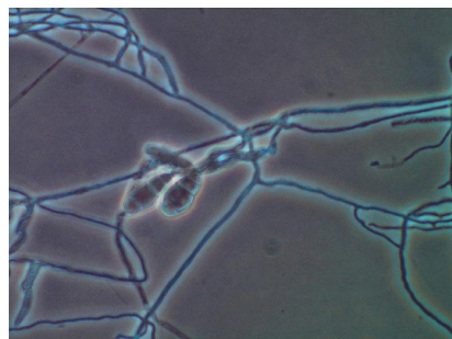
Figure 1. Microscopic threads (hyphae) and spores of a typical plant-pathogenic fungus.

minute size of these disease-causing pathogens accounts for the mystery that often surrounds their presence and impact in the garden.