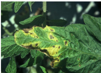
Figure 16. Early blight on tomato leaves.

Similar concentric rings are seen in lesions that develop on stems and fruit. When the fungus attacks young stems, complete girdling of the stems may occur with subsequent plant death. Fruit lesions are usually at the junction of the fruit and fruit stem or on the portions of the fruit nearer the stem and are conspicuously sunken.