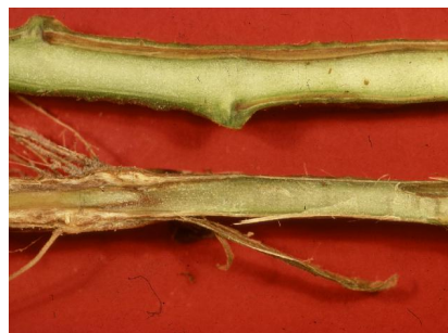
Figure 15. Internal browning of water-conducting tissue in tomato stem of plant with Fusarium wilt.

To confirm Fusarium wilt, make a vertical cut of the lower stem of suspect plants and examine the water-conducting tissue. This is a narrow column of solid-appearing tissue to the outside of the stem. If it is brown (Fig. 15), Fusarium wilt is likely.