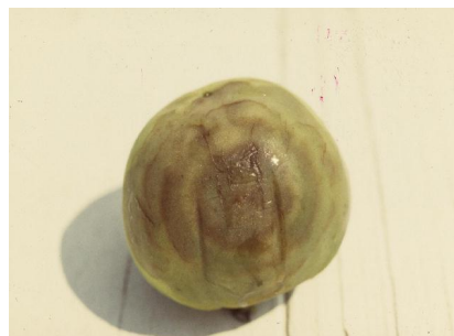
Figure 9. Late blight on tomato fruit.

To control late blight, begin with disease-free transplants. Next, space plants far enough apart in the garden so that plants will dry off quickly during the day. If late blight is a yearly problem in your garden, you may have to resort to periodic use of fungicide sprays.