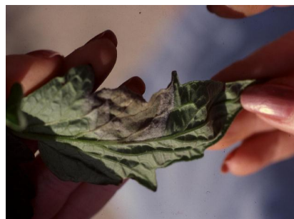
Figure 8. Late blight symptoms on the lower leaf surface of tomato.

On infected tomato fruit, mahogany to purple blotches appear, sometimes in a ring pattern (Fig. 9), and fruits often become overcome by a foul-smelling soft rot, as secondary bacteria follow the late blight infection.