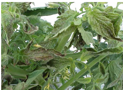
Figure 10. Leaf symptoms caused by TSWV.

followed by a general browning of leaves that die and appear drooped on stems. Brown to purple brown streaks form on stems. Plants are often stunted and, with the droopy leaves, appear wilted. Green fruit show concentric rings of yellow or brown alternating with the background green color (Fig. 11). Striking brown rings occur on red-ripe fruit.