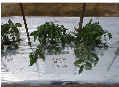
Figure 12. Ultraviolet (UV) reflective mulch.

Vigilant weed control may reduce the incidence of TSWV on your garden tomatoes but will not eliminate TSWV. Control of thrips with insecticides may help to reduce late infections (secondary cycle). However, in controlled experiments, insecticides have not been all that successful. Ultraviolet (UV) reflective mulch (Fig. 12), used as a physical repellent, can reduce TSWV incidence. UV-reflective mulches are available commercially in small packages for homeowners.