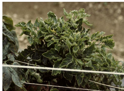
Figure 13. Extremely stunted tomato plant infected with TYLCV.

This virus is transmitted by a species of whitefly. Severe symptoms occur on tomato, especially when young plants are infected. Young, diseased plants are severely stunted. Leaf edges curl upward and appear mottled (i.e., show alternating areas of light and dark green) (Fig. 13). The tops of plants appear bushy. Often, fruit set is poor or nonexistent.