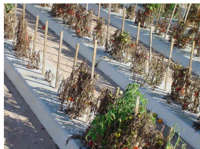
Figure 17. Bacterial wilt symptoms on tomato.

The vascular tissues in the lower stem of wilted plants show a dark brown discoloration. A cross section of the stem of a plant with bacterial wilt produces a white, milky strand (ooze) of bacterial cells in clear water (Fig. 18). This feature distinguishes the wilt caused by the bacterium from that caused by fungal pathogens (e.g., Fusarium wilt).