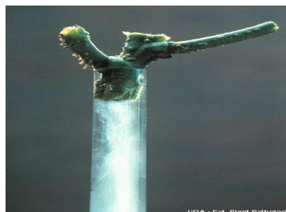
Figure 18. Bacterial ooze due to Ralstonia infection.

In the southeastern United States, bacterial wilt of tomato is caused predominantly by race 1 of R. solanacearum . These strains have a wide host range that guarantees a long-term survival of the pathogen in soil in the absence of the main susceptible crop. The pathogen can survive in the rhizosphere of nonhost plants, including weeds.