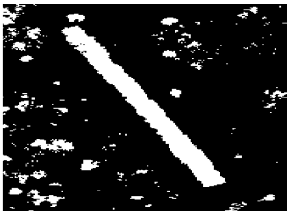
Figure 3. Typical rod-shaped virus as seen through a powerful electron microscope.

Viruses are most strange, indeed (Fig. 3). They are not “organisms” in the sense of the fungi and bacteria. Viruses are very large molecular structures consisting of a nucleic acid (DNA or RNA) wrapped in a protective coating of protein. Once viruses are inside a tomato cell, they take over the host cellular machinery and use it to produce more viruses. Most of the important tomato viruses are transmitted to garden plants by insects such as aphids, whiteflies, or thrips.