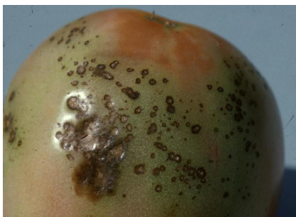
Figure 7. Target spot on tomato fruit.

plants. Consult with the UF/IFAS Cooperative Extension Service for recommended fungicides. Gardens planted close to commercial tomato production fields may be more likely to be affected by target spot.