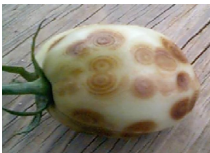
Figure 11. Fruit symptoms caused by TSWV.

Vigilant weed control may reduce the incidence of TSWV on your garden tomatoes but will not eliminate TSWV. Control of thrips with insecticides may help to reduce late infections (secondary cycle). However, in controlled experiments, insecticides have not been all that successful. Ultraviolet (UV) reflective mulch (Fig. 12), used as a physical repellent, can reduce TSWV incidence. UV-reflective mulches are available commercially in small packages for homeowners.