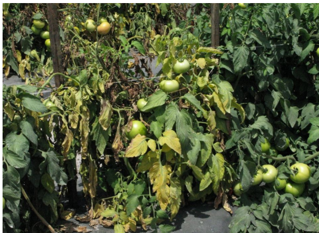
Figure 14. Tomato plants exhibiting one-sided wilt and bright yellowing of foliage characteristic of Fusarium wilt.

Once the fungus is inside the tomato plant, the water-conducting (vascular) system is colonized and becomes plugged, accounting for wilt symptoms. As the name implies, progressive wilt is the predominant symptom. The wilt cannot be overcome by simply watering the tomatoes thoroughly (Fig. 14).