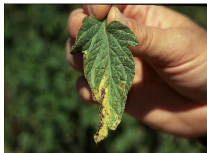
Figure 4. Typical bacterial spot symptoms on tomato leaves.

Dark brown leaf spots (lesions) appear as small (1/8 of an inch or so), wet-to-greasy areas on both upper and lower leaf surfaces (Fig. 4). There may or may not be yellow halos around these spots. These lesions may run together to form rather large, blighted areas on leaves. It is not unusual for affected leaves to drop off plants prematurely.