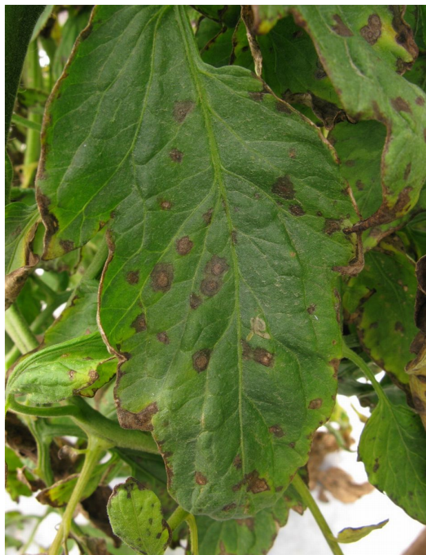
Figure 6. Target spot on tomato leaves.

On tomato leaves, the disease first appears as small, brown spots with light brown centers and darker brown margins (Fig. 6). There can be yellow halos around these spots. Especially in early stages, target spot on the leaves is extremely difficult to differentiate from bacterial spot. Even experienced professionals can have difficulty telling these two diseases apart without laboratory tests. As the target spot disease develops, spots run together, and large blighted areas appear on leaves.