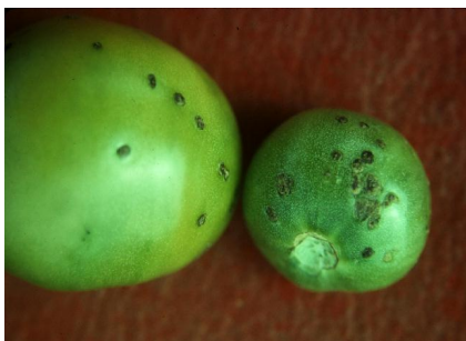
Figure 5. Bacterial spot on tomato fruit.

spots become larger, raised, and scabby in appearance (Fig. 5). Infected fruits are unappealing, and many home gardeners choose not to bring such fruit into the kitchen.