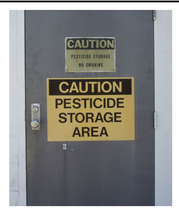
Figure 2. Post signs that indicate pesticides are stored in the facility.

Advisable proactive measures also include the following: