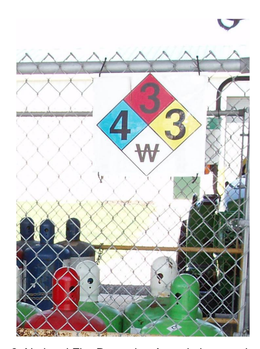
Figure 3. National Fire Protection Association warning at a fumigant storage site. The strikeover on the letter "W" in the white diamond alerts firefighters not to use water to put out a fire.

A hazardous rating system used to assist emergency response personnel is the National Fire Protection Association (NFPA) Hazard Identification System. This system uses a diamond-shaped warning symbol. The top, left, and right boxes refer to flammability, health, and instability hazards, respectively, and each contains a number from 0 to 4 (Table 1). The bottom box is a warning against the use of water. Some pesticides and their storage sites will be marked with such a warning to alert firefighters not to use water to put out a fire (Figure 3).