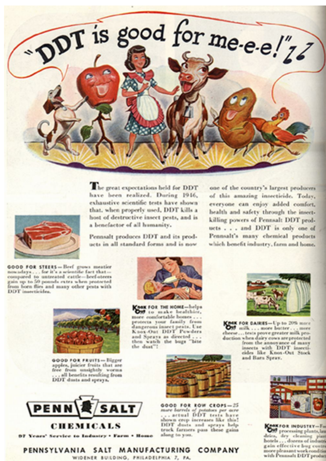
Figure 3. DDT advertisement flyer circa 1950.