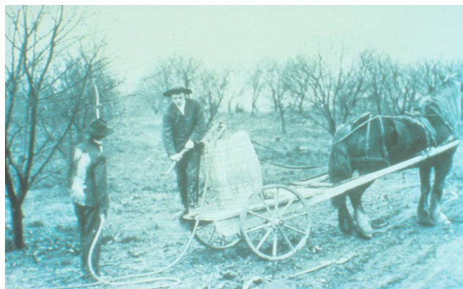
Figure 2. Orchard spraying circa 1900.

wide variety of insects. Lead arsenate was first used in 1892 as an orchard spray (Figure 2).