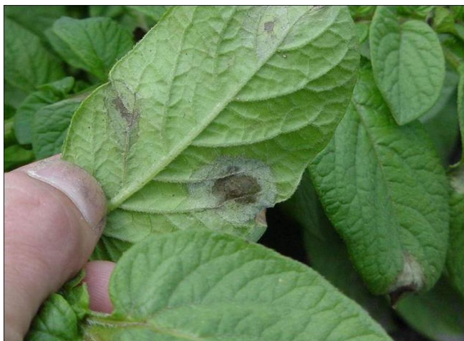
Figure 1. Potato late blight.

and, to a lesser extent, tomato, another member of the Solanaceous plant family.