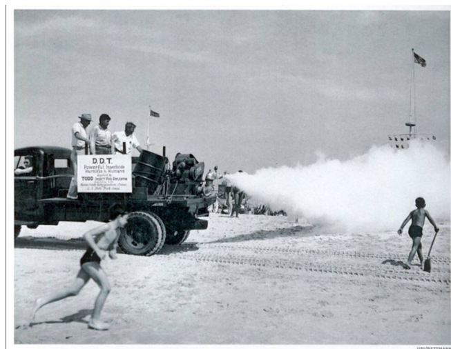
Figure 4. Area-wide DDT application circa 1950.