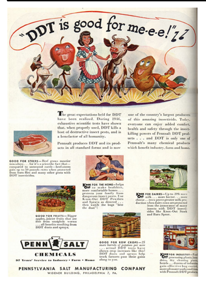
Figure 3. DDT advertisement flyer circa 1950.