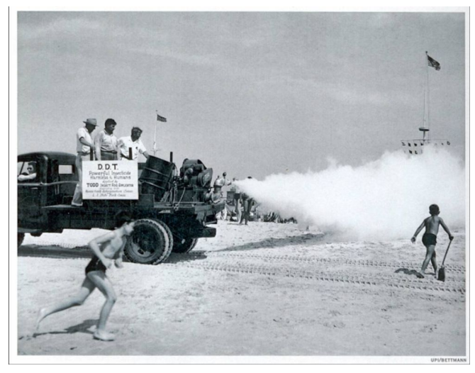
Figure 4. Area-wide DDT application circa 1950.