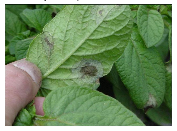
Figure 1. Potato late blight.

and, to a lesser extent, tomato, another member of the Solanaceous plant family.