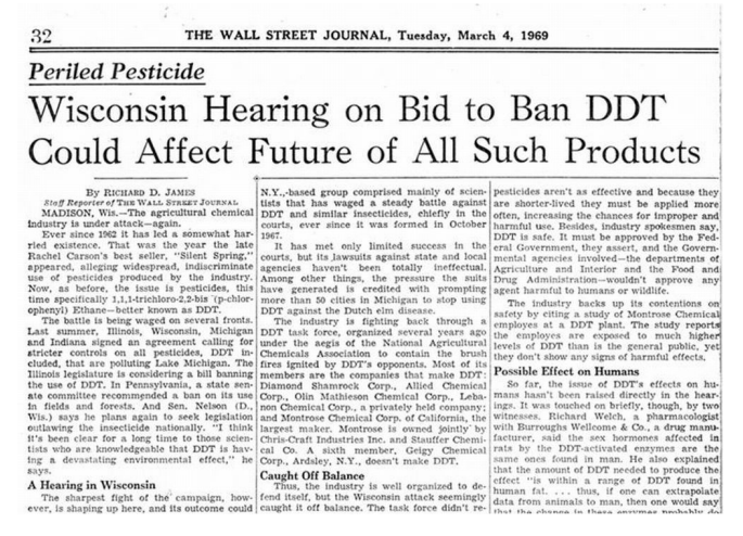
Figure 6. Press release regarding DDT ban.

and remains today, to implement by regulation the laws passed by Congress to protect the environment and the health of humans and other animals. Since the 1972 EPA ban on DDT use in the United States, regulatory action has been taken against many chemicals, including pesticides, thought to pose significant environmental and health hazards. Public concern has led to stringent regulation of pesticides and changes in the types of pesticides used (Figure 6).