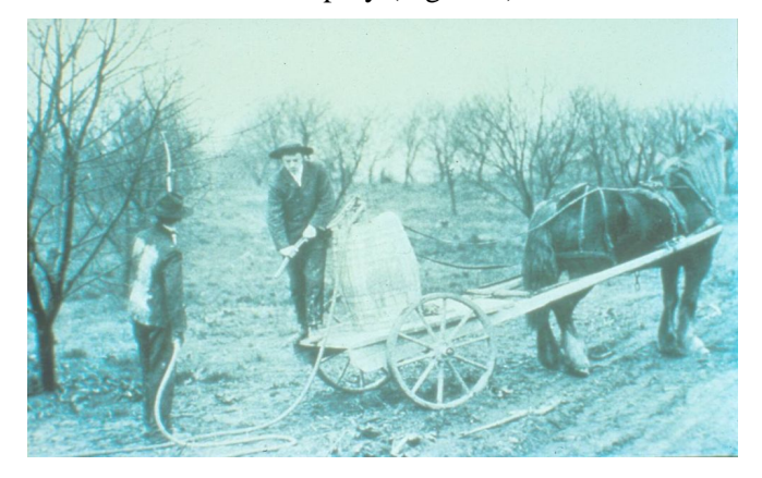
Figure 2. Orchard spraying circa 1900.

wide variety of insects. Lead arsenate was first used in 1892 as an orchard spray (Figure 2).