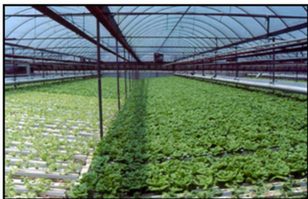
Figure 4. Bibb lettuce growing in a hydroponic system that uses nutrient film (flow) technique in a greenhouse in Live Oak, FL, 1995.

The soil mix raised beds hydroponic system consists of a potting-mixture combination of peat, perlite, vermiculite, composted product or similar substrate, mixed together with or without fertilizer (Figure 3). Drip irrigation supplies water and nutrients to crops grown similar to outdoors, in rows, but under the protected greenhouse structure. This category includes crops reported as “native soil floor.”