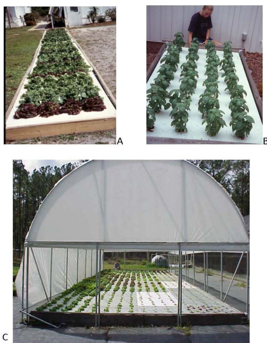
Figure 6. Floating raft hydroponic systems in Sanford, FL, 2007.

Rockwool production techniques are similar to perlite lay-flat bags, with drip irrigation through the rockwool slabs, two rows draining to a central collection trough, and gravity feeding of the effluent to a collection tank. The solution can be sterilized and re-circulated or flow through and used for another purpose, such as providing water and nutrients for an adjacent float system.