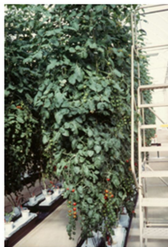
Figure 5. Rockwool hydroponic culture in a greenhouse in Lake Buena Vista, FL, 1998.

Because of the risk of root pathogens being spread throughout the greenhouse once an infection starts, most tomato growers are no longer using recirculating systems unless the system includes some means of sterilizing the water. Instead, many tomato and pepper growers now use some variation of a media nutrient flow-through system, such as the lay-flat bag, Dutch bucket or rockwool systems, which do not recirculate the nutrients. In these systems, root infections remain localized.