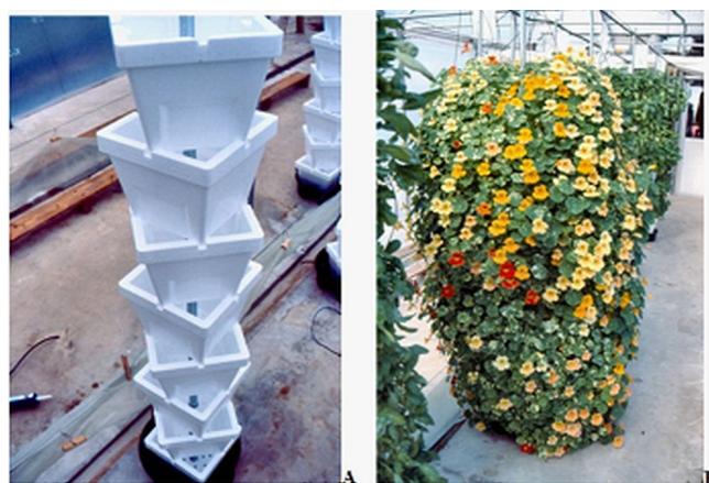
Figure 7. Verti-Gro ® stacked pots (A) planted with nasturtium (B) in a vertical hydroponic system in Live Oak, FL, 2001.

The vertical systems are popular for producing strawberries, leafy greens, edible flowers and fresh-cut herbs. More recently, vertical-production techniques have also been developed for tomato.