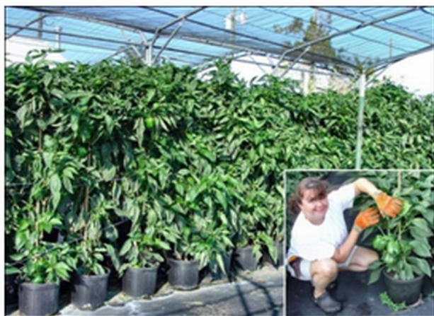
Figure 10. A hydroponic system outdoors, under shade, in Live Oak, FL, October, 2007.

Outdoor hydroponic systems typically are used with some provision for frost protection with row-cover materials. (See Figure 9.) In addition, there is an increasing interest in extending the hydroponic growing season into the summer by using open shade structures (Hochmuth et al., 2007) to supply vegetables for local markets. (See Figure 10.)