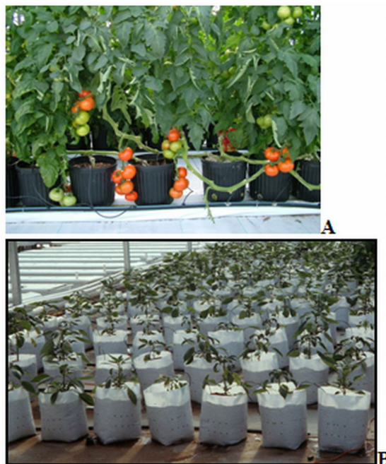
Figure 2. Tomatoes growing in media-filled, plastic nursery pots (A) and in upright bags (B) in a greenhouse in Wellborn, FL, in 2001.

Perlite is also used in a variety of other cropping systems, including the bench-bed system (example: perlite-filled, aluminum roofing panels) and vertical systems (described below). When used in these systems, perlite is often mixed with coconut coir, peat, or other organic components to increase water and nutrient holding capacity of the media.