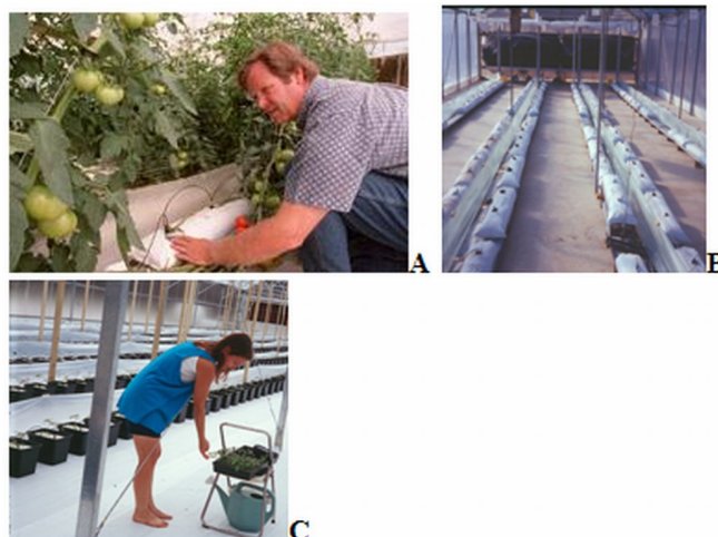
Figure 1. Photos A and B, taken in 1995 in a greenhouse at UF's North Florida Research and Education Center in Live Oak, FL, show a perlite lay-flat-bag system. Photo C pictures a Dutch-bucket system in a greenhouse in Sanford, FL, in 2004.

These changes in crops produced (Table 1), hydroponic systems employed (Table 2) and greenhouse designs (Table 3) demonstrate the ability of growers to adapt. However, these dynamics also reflect the general instability of this industry as it competes with less expensive, field-grown and imported vegetables. Hurricanes and tropical storms in Florida also contribute to uncertainty in this industry since large greenhouse ranges located near coastal areas can be destroyed overnight, as occurred in Collier County in 2004.