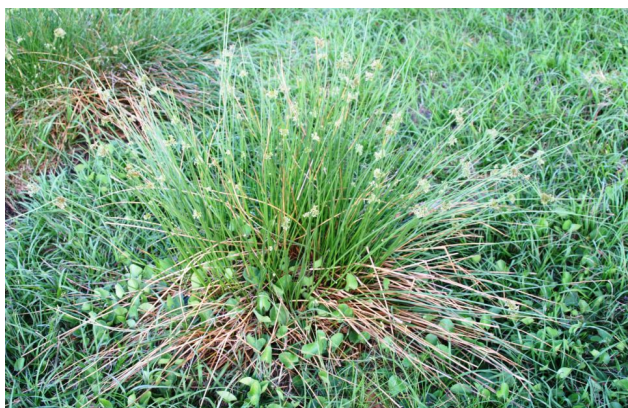
Figure 3. Soft rush typically flowers in the spring, April through June. Each plant is capable of producing at least 8,500 seeds per year.

Soft rush is a clump-forming perennial that spreads by both short rhizomes and seed (Figure 3). Leaves are limited to small, brown scales near the base of the stems. Stems are cylindrical, pointed, and can reach up to of 5 feet in length. The inflorescence is a many-flowered, loosely clustered panicle, approximately 1 - 2 inches long (Figure 3). Seed production is extremely high with each shoot capable of producing 8,500 seeds per year.