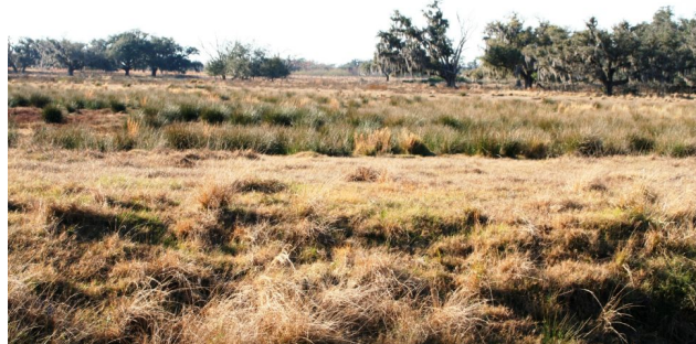
Figure 1. Soft rush commonly grows in low-lying areas in pastures. During the dry season, these areas can be treated to control soft rush.

Soft rush, often called bull rush, is a clump-forming perennial plant that frequently infests low-lying areas in Florida pastures and is typically found in pastures that are seasonally wet with alternating wet and dry seasons (Figure 1). Soft rush does not generally grow where water is present year-round, but is often present along the perimeters of ponds, lakes, streams, and canals.