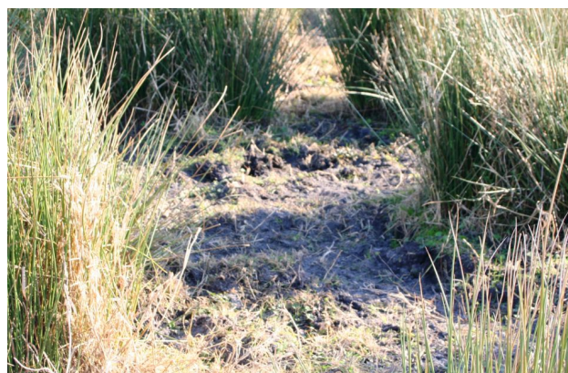
Figure 2. Dense soft-rush infestations result in overgrazing of desirable forage and excessive trampling around soft-rush clumps.

rush tends to limit the area available to cattle for grazing. Cattle avoidance of soft rush is often evidenced by the signs of trampling around individual soft rush plants (Figure 2).