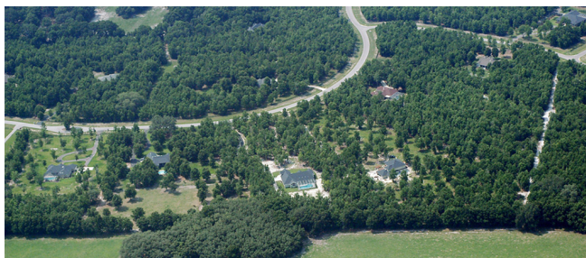
Figure 2. The intermix is a mixing of rural and urban land uses in the same area.

Determining the extent of total land area in the WUI in the South is difficult due to the variety of