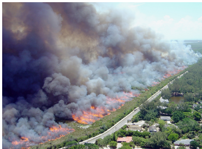
Figure 1. The wildland-urban interface is often shown engulfed in flame.

interface is an area where human-made infrastructure is in or adjacent to areas prone to wildfire. On a community scale, the interface is an area where conditions can make a community vulnerable to a wildfire disaster.