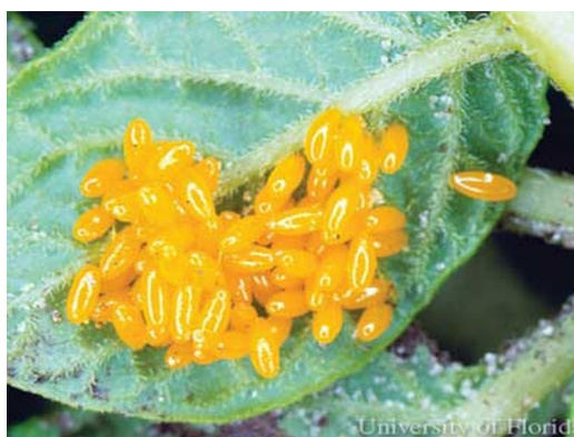
Figure 5. Egg cluster of the Colorado potato beetle, Leptinotarsa decemlineata (Say).

False potato beetle larva are generally paler (almost white) and have one row of black spots.