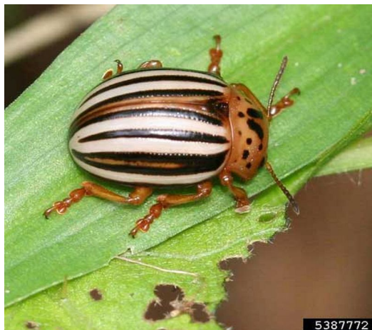
Figure 4. Frontal view of a Colorado potato beetles, Leptinotarsa decemlineata (Say).

bordering sutural margin and extending from just below the base to the apex. Vitta 2 is shorter than first and not reaching base. Vitta 3 and 4 connect at the apex of elytron with space between black. Vitta 5 is along the lateral margin of elytron. Punctuation is coarse, in very regular rows outlining each vitta. There is a distinct black spot on outer margin of femur. The legs are mostly orangish in color.