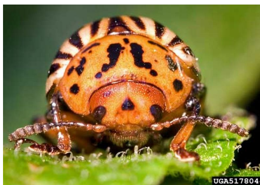
Figure 3. Frontal view of a Colorado potato beetle, Leptinotarsa decemlineata (Say).

In L. juncta , each pale yellow elytron has five black vittae (broad longitudinal stripes), with vitta 1