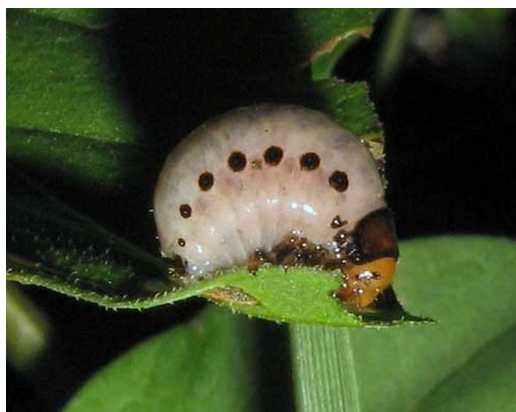
Figure 7. Larva of the falsepotato beetle, Leptinotarsa juncta (Germar).

Pupae: Mature larvae burrow 2-5 cm into the soil and after about two days begin to pupate. Colorado potato beetle pupae are oval and orangish in color. The mean development time is about 5.8 days (Capinera 2001).