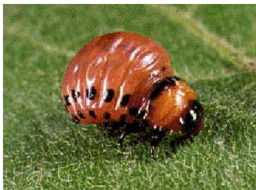
Figure 6. Larva of the Colorado potato beetle, Leptinotarsa decemlineata (Say)