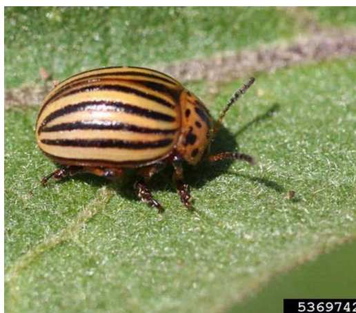
Figure 2. Adult Colorado potato beetle, Leptinotarsa decemlineata (Say).

In L. decemlineata , the pale yellow elytra are outlined in black, with each elytron having five vittae (broad longitudinal stripes). Vitta 1 is shorter than other four and adjacent to the sutural margin. Vittae 2 through 5 extend more than half the length of the elytron and are very distinct. Elytron punctation is coarse in irregular rows. The underside of the beetle and the legs are mostly dark (Capinera 2001).