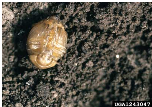
Figure 8. Colorado potato beetle, Leptinotarsa decemlineata (Say), pupa.