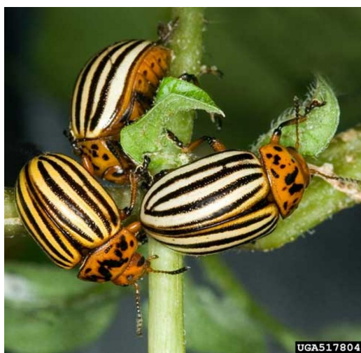
Figure 1. Colorado potato beetles, Leptinotarsa decemlineata (Say), feeding on foliage.

The Colorado potato beetle was first discovered by Thomas Nuttall in 1811 and described in 1824 by Thomas Say from specimens collected in the Rocky Mountains on buffalo-bur, Solanum rostratum Ramur. The insect's association with the potato plant, Solanum tuberosum (L.), was not known until about 1859 when it began destroying potato crops about 100 miles west of Omaha, Nebraska. The insect