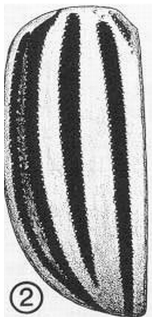
Figure 10. False potato beetle, Leptinotarsa juncta (Germar) Illustrations by: Division of Plant Industry