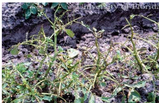
Figure 9. Colorado potato beetle, Leptinotarsa decemlineata (Say), damage to potato.

Potatoes are the preferred host for the Colorado potato beetle, but it may feed and survive on a number of other plants in the family Solanaceae, including belladonna, common nightshade, eggplant, ground cherry, henbane, horse-nettle, pepper (rarely), tobacco, thorn apple, tomato, and its first recorded host plant: buffalo-bur. The Colorado potato beetle has displayed an ability to adjust its host range to locally abundant Solanum species. Colorado potato beetles also feed on non-solanaceous plants, but this is rare and these plants should not be considered normal hosts (Capinera 2001).