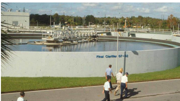
Figure 2. The clarifier in this 1999 photo is still used for producing reclaimed water at the McLeod Road Water Pollution Control Facility in Orlando. Reclaimed water from this clarifier is subsequently disinfected and then used for irrigation of residential areas, golf courses, and citrus groves near Orlando.

While reclaimed water can meet drinking water standards for many elements, the FDEP does not require that reclaimed water meet all drinking water standards. Reclaimed water is not intended for drinking.