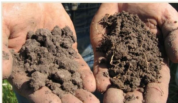
Figure 2. Poor structure (left) results in soil that clumps together but breaks apart readily with tillage, does not hold water well, and is an impediment to rooting. Good structure (right) is illustrated by the presence of many aggregates that allow for water infiltration and good plant rooting, and is indicative of high organic matter concentrations.