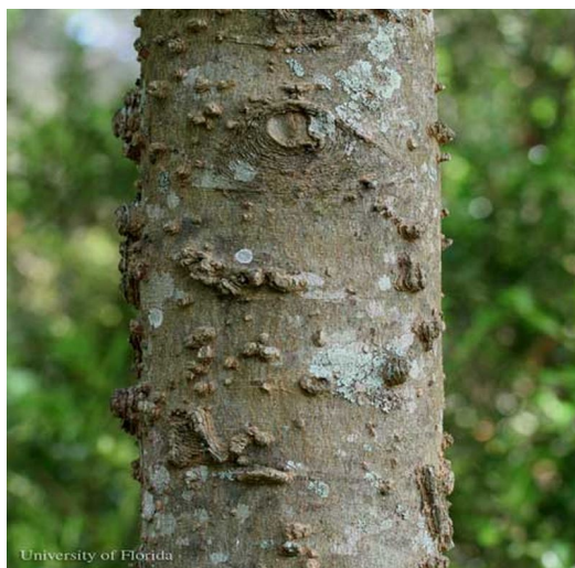
Figure 7. Warty trunk of the sugarberry, Celtis laevigata Willd., a host of the hackberry emperor, Asterocampa celtis (Boisduval & Leconte).