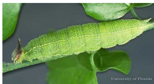
Figure 4. Larva of the hackberry emperor, Asterocampa celtis (Boisduval & Leconte).

excellent drawings of the cephalic horns and lateral spines of the hackberry emperor and tawny emperor.