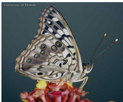
Figure 2. Ventral wing view of an adult hackberry emperor, Asterocampa celtis (Boisduval & Leconte).