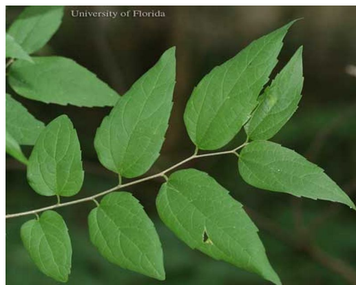
Figure 6. Sugarberry, Celtis laevigata Willd., a host of the hackberry emperor, Asterocampa celtis (Boisduval & Leconte).

The larval hosts of the hackberry emperor are hackberry trees ( Celtis spp.) in the family Celtidaceae. The two most common hackberries in the eastern U.S., the more northern hackberry, Celtis occidentalis Linnaeus and the more southern sugarberry, Celtis laevigata Willd., can usually be recognized by the slightly to heavily warty appearance (or pronounced ridges on mature C. occidentalis ) of the bark. More information and a key to the Celtis species is available at efloras.org (undated).