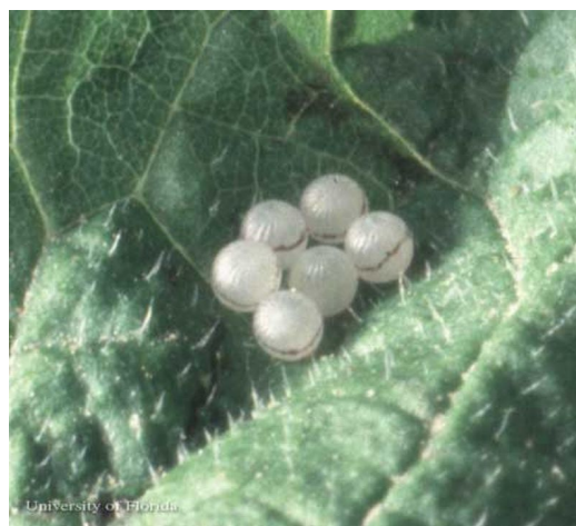
Figure 3. Eggs of the hackberry emperor, Asterocampa celtis (Boisduval & Leconte).

Larvae: Full grown larvae are approximately 1.4 inches in length (Minno et al. 2005). The lower half of the head is green with short green spines laterally. The upper half of the head is brown with a pair of stout black horns dorsally. See Wagner (2005) for