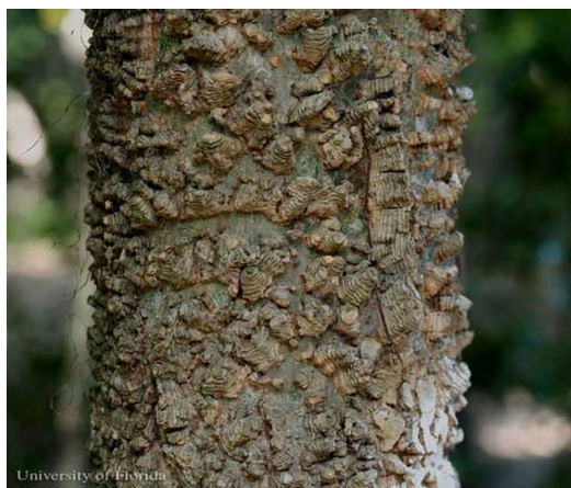
Figure 8. Heavily warty trunk of the sugarberry, Celtis laevigata Willd., a host of the hackberry emperor, Asterocampa celtis (Boisduval & Leconte).