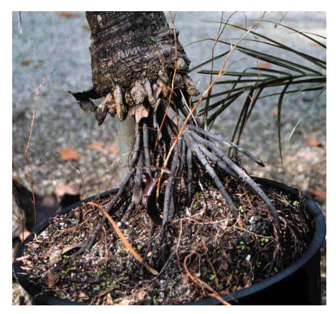
Figure 2. Container substrate subsidence and shallow planting resulted in the root- initiation zone of this palm being above the current soil line. These new root initials will probably never enter the soil.

adventitious roots arising from the root initiation zone will initially supplement and will ultimately replace those early roots that were confined to the container.