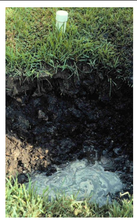
Figure 8. This planting site has a high water table, which is unsuitable for palm installation. Credits: Timothy K. Broschat

Field-grown palms should always be transplanted to the same depth at which they were previously growing. Palms transplanted deeper have been shown to have increased incidence of chronic nutritional deficiencies, such as iron or manganese deficiencies (Broschat, 1995). (For more on these nutritional deficiencies in palms, see EDIS Publication ENH1013, Iron Deficiency in Palms, http://edis.ifas.ufl.edu/ep265, and EDIS Publication ENH1015, Manganese Deficiency in Palms, http://edis.ifas.ufl.edu/ep2657.) Such palms are also often stunted and grow poorly, compared to properly planted palms (Figure 9). In addition to nutrient deficiencies, deeply planted palms may also suffer from water stress. As a result of these palms' weakened condition, they may attract secondary pests, such as palm weevils (Rhychophorus sp.).