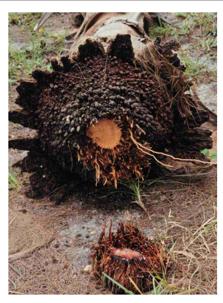
Figure 3. This palm had been planted too shallowly from a container and eventually fell over from its own weight.

If shallowly planted palms are encountered in the landscape, stabilize the palms by mounding up soil to cover the root-initiation zone. This mound of soil will allow the root initials to continue their growth down into the soil, firmly anchoring the palm.