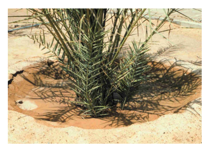
Figure 11. Mounding up soil around the rootball forces water into the rootball, where it is needed.

When backfilling palm planting holes, be sure to wash soil down into all voids to eliminate air pockets (Figure 10). A shallow berm should be constructed around the perimeter of the rootball of the newly transplanted palm to retain water in the rootball area during irrigation (Figure 11). The soil around the rootball should be kept uniformly moist, but never saturated during the first four to six months following transplanting. After that time, irrigation frequency can be reduced or eliminated altogether if adequate rainfall is received. Research has shown no benefit to irrigating the crown of the palm versus soil application of water (Broschat, 1994).