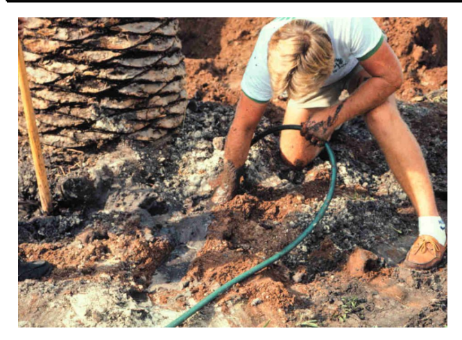
Figure 10. Using water to force sand under and around the rootball.

When backfilling palm planting holes, be sure to wash soil down into all voids to eliminate air pockets (Figure 10). A shallow berm should be constructed around the perimeter of the rootball of the newly transplanted palm to retain water in the rootball area during irrigation (Figure 11). The soil around the rootball should be kept uniformly moist, but never saturated during the first four to six months following transplanting. After that time, irrigation frequency can be reduced or eliminated altogether if adequate rainfall is received. Research has shown no benefit to irrigating the crown of the palm versus soil application of water (Broschat, 1994).