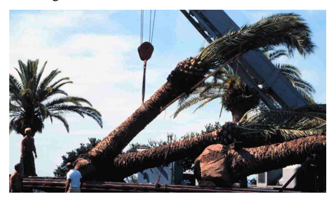
Figure 6. A palm being lifted in a nylon sling. The splint attached to the crown provides support.

During transport on truck or trailer, palms should be well supported along their entire length (Figure 7). Unsupported crowns may crack or damage the bud, resulting in reduced survival rates.