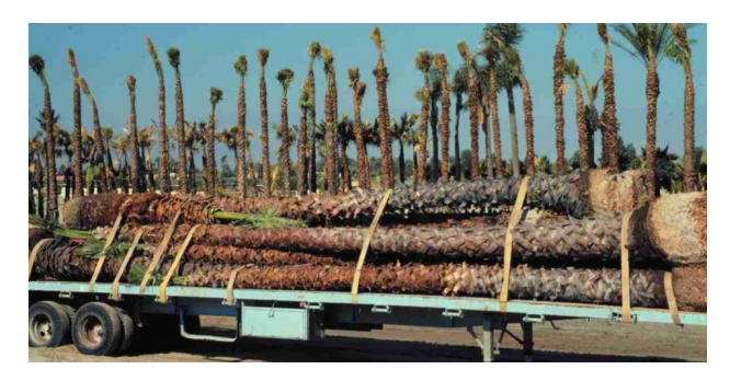
Figure 7. These palms are well supported on the trailer bed for transportation.