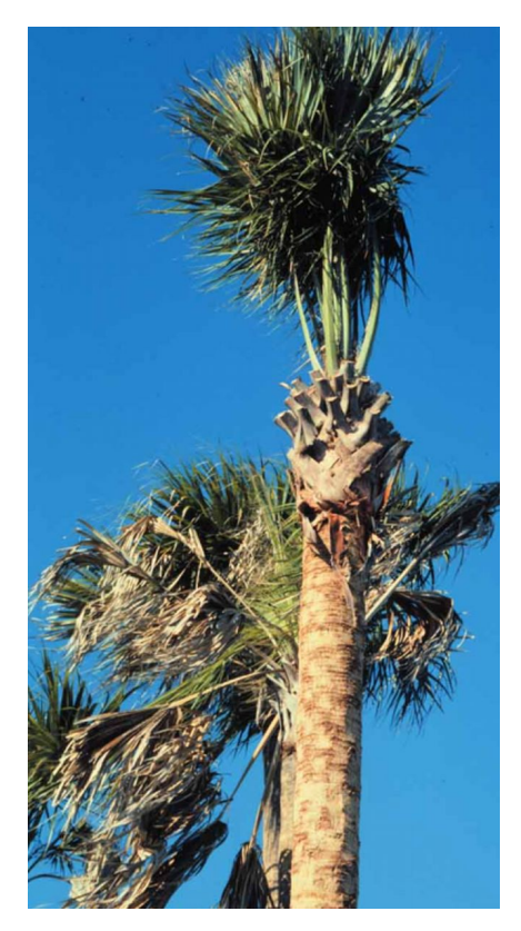
Figure 5. The lower leaves of this palm have been removed, and the remaining ones tied into a bundle for transport.

Palms should be lifted only by means of nylon slings wrapped around the trunk (Figure 6). Never attach chain, cables, or ropes directly to palm trunks;