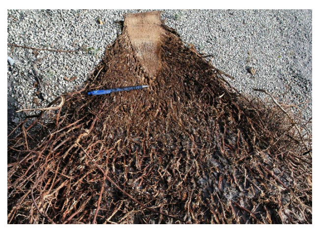
Figure 1. The inverted-cone-shaped tissue at the bottom of the trunk -- an area from which all primary palm roots arise -- is called the root-initiation zone. The pen marks the soil line.

Understanding how palm roots grow and respond to being cut can greatly improve the chances of success when transplanting palms. In addition, other factors -- such as rootball size, leaf removal and tying, physiological age of the palm, transplanting season, and planting depth -- can also have a significant impact on the success of palm transplants. The purpose of this document is to discuss how these and other factors contribute to palm transplant survival rate.