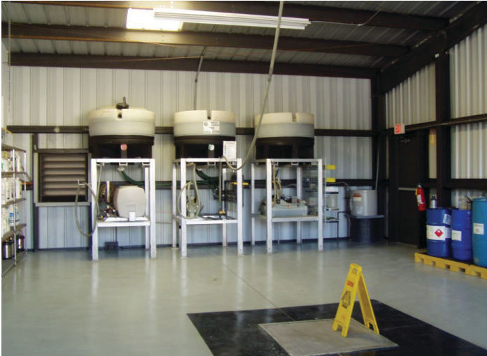
Figure 8. Bulk storage tanks holding spray mix and rinse for later use.

Follow the label when disposing of pesticides. Triple or pressure rinse empty pesticide containers and add the rinse to the spray tank. Apply excess spray mix and rinse water from equipment cleaning to crops or sites listed on the label. Do not drain the excess on the ground. Mount a tank of fresh water on the sprayer to rinse the tank and sprayer. Where practical, excess spray mix or rinses can be held in a tank for use in a later spray mix (Figure 8).