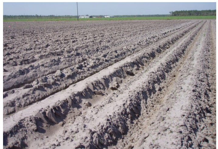
Figure 1. Many of Florida's agricultural soils are well drained, high in sand and low in organic matter.

vulnerability of these surface-water bodies to contamination from pesticides.