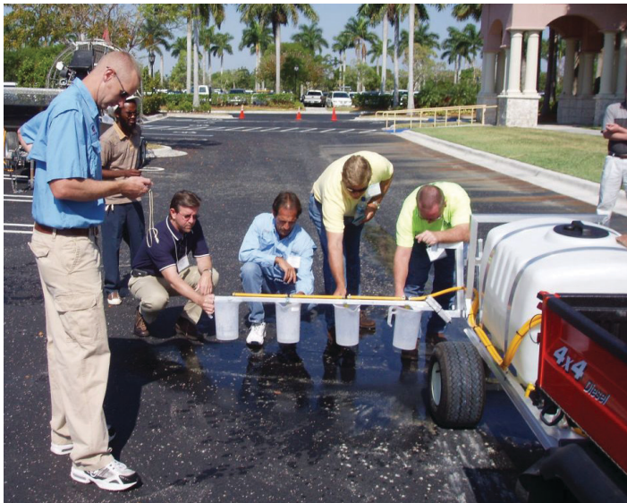
Figure 4. Checking a sprayer's output to determine the amount applied.

(Figure 5). If the water source (well, canal, or pond) used for filling a spray tank is not protected by a concrete pad, berm, or wall to prevent runoff into the source, fill the spray tank as far as possible from the water source or fill the tank in the field from a nurse tank. Nurse tanks are used to transport clean water for mixing and loading. Add the pesticide concentrate to the sprayer in the field.