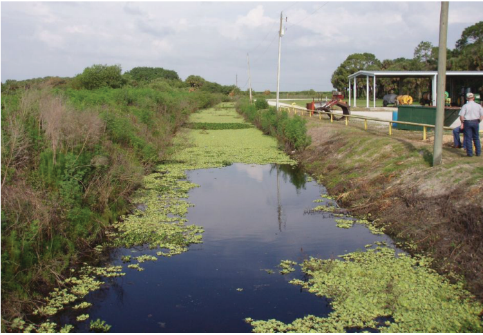
Figure 2. Grass and weeds provide a filter strip between a citrus grove and mixing site and canal.