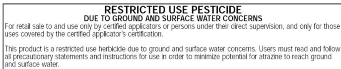
Figure 3. Restricted-use pesticide classification due to concerns over protecting groundwater and surface water.

Select pesticides that are less likely to leach. Pesticides that have the greatest potential to leach to groundwater are highly water soluble, relatively persistent, and do not adsorb to soil. Some pesticides are classified as restricted use and have label statements because of concerns over water contamination (Figure 3). Read the label before you purchase, use, or dispose of a pesticide. You are required by law to follow label directions. Be aware that there are several Florida-specific laws that place limitations on use of certain pesticides, including aldicarb and bromacil. Label language will alert users of such limitations. The Cooperative Extension Service can assist you in selecting the appropriate pesticide. For your local UF/IFAS Extension office, see http://solutionsforyourlife.ufl.edu/map/index.html .