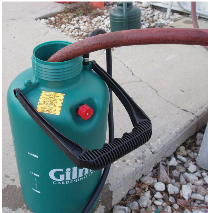
Figure 6. Never place a hose into a tank while filling; always leave an air gap to prevent back-siphoning.

Store pesticides in a facility with restricted access and away from all water resources. Use a facility with a concrete floor that has been sealed to facilitate clean-up in the event of a spill or leak. Inspect containers regularly for leaks and corrosion. Bulk pesticide storage tanks should be placed on concrete pads with dikes built around the tanks to prevent movement of pesticide should a spill or leak occur (Figure 7).