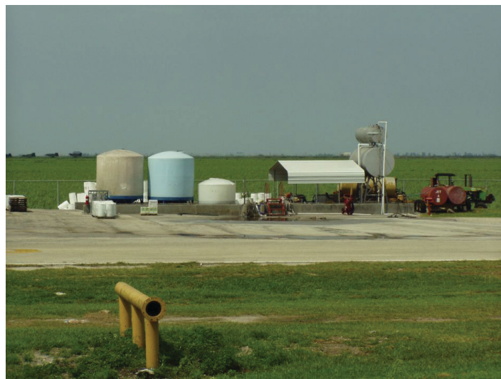
Figure 7. Bulk storage tanks on diked-concrete pad.