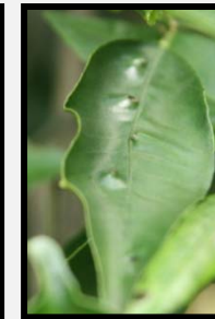
Late season scab lesion