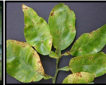
Early season Melanose