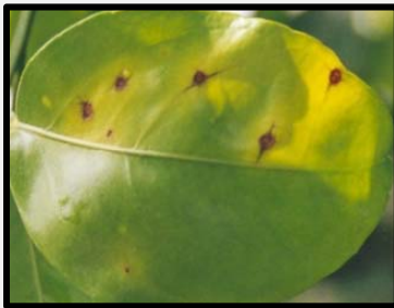
Young Alternaria lesions on leaf; Note necrosis following the vein