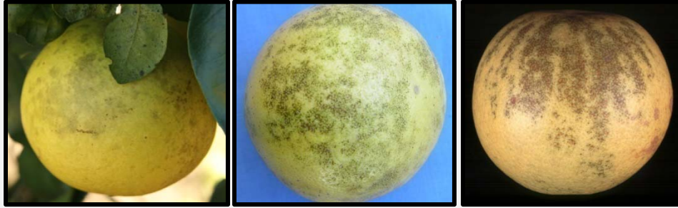
Early greasy spot rind blotch on grapefruit