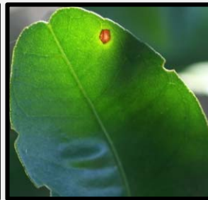
Late season Alternaria lesion on leaf