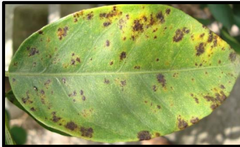
Young greasy spot lesions