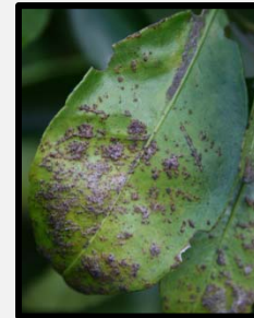
Late season Melanose