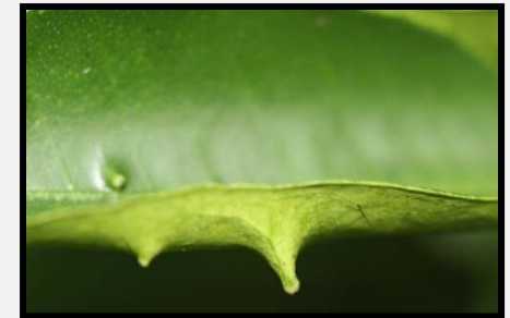
Young scab lesions forming finger-like structures on leaf