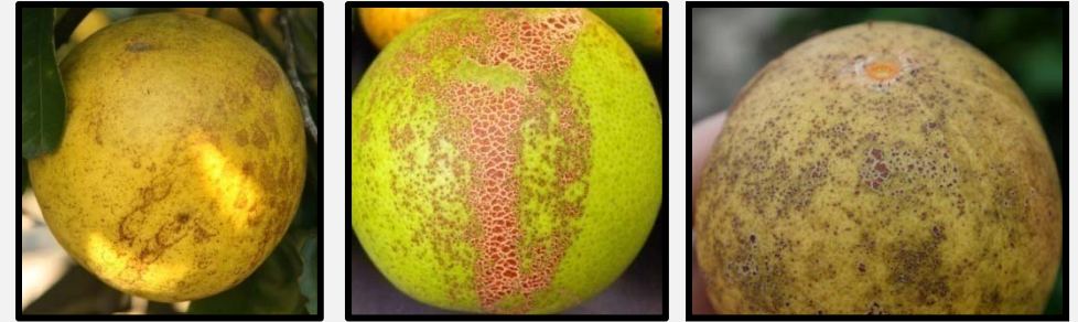
Tear stain Melanose