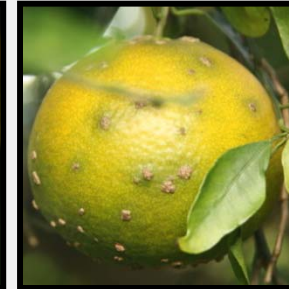
Scab lesions on mature fruit