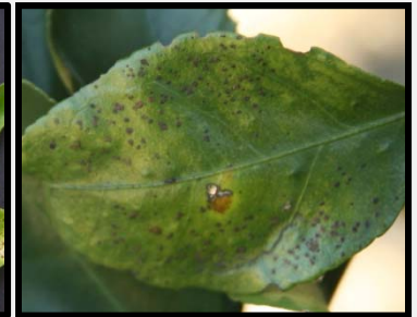
Late season Melanose