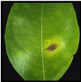
Young Alternaria lesion on leaf