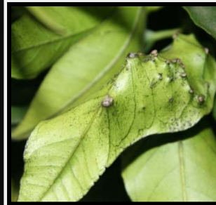
Late season scab lesions on leaves