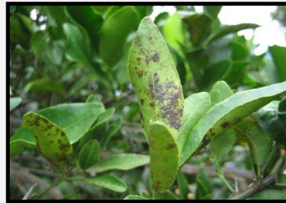
Older greasy spot lesions