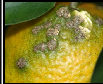
Corky or warty scab lesions on mature fruit