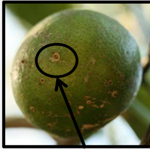
Alternaria lesions on immature fruit