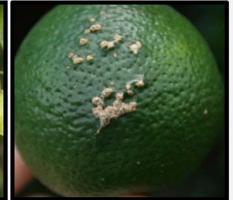
Scab lesions on immature fruit