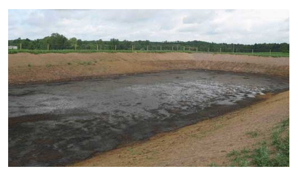
Figure 13. A dairy farm lagoon in upstate New York.

Eristalis tenax is usually not a serious pest, but occasionally the larvae can become a nuisance in livestock areas, where they are often abundant in manure lagoons and holding pits (Kaufman et al. 2000). During the summer, larvae can migrate from these sites in massive numbers as they seek dry pupation sites (Day 2008). The migrations can cause many problems, such as contamination of livestock feed, short circuits from accumulations in electrical boxes, and congregations in barn stalls, egg cartons, and other unwanted places (Kaufman et al. 2000, Day 2008).