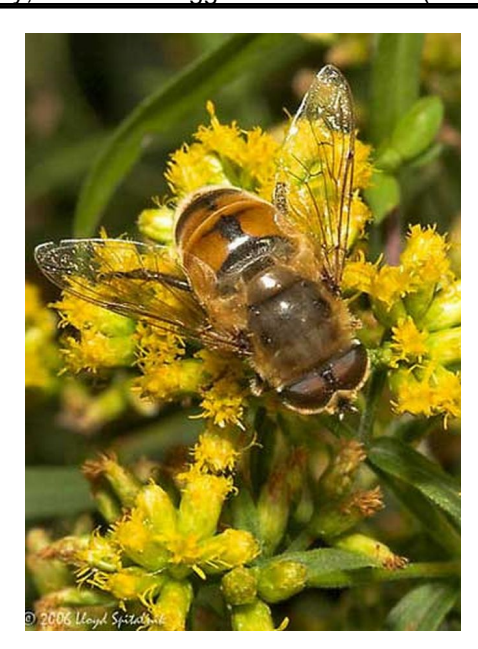
Figure 9. Adult male drone fly, Eristalis tenax (Linnaeus).