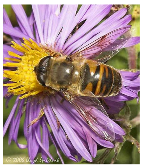
Figure 3. Adult female drone fly, Eristalis tenax (Linnaeus).

rat-tailed maggot (immature), is a mimic of the European honey bee Apis mellifera Linnaeus (Golding et al. 2001), and was introduced from Europe around 1875 (Gilbert 1986). The rat-tailed maggot is probably the source of Biblical writings that depict honey bees spontaneously developing from dead animals. This is because female drone flies can lay their eggs in carcasses (Osten-Sacken 1893).