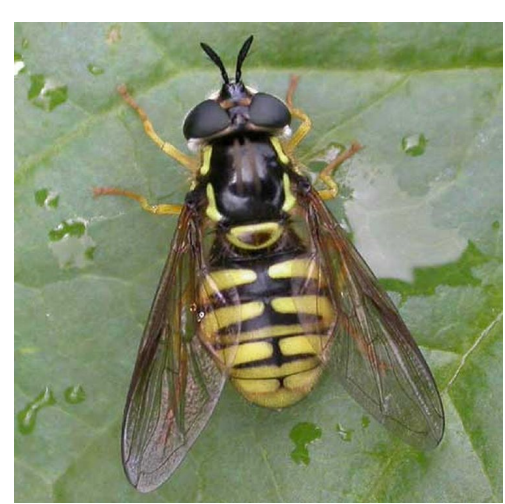
Figure 1. Adult female hover fly, Chrysotoxum cautum (Harris), showing resemblence of some hover fly species to yellowjackets. Credits: David A. Iliff, Cheltenham

(Bates 1961). In other words, predators may avoid bees, wasps and yellowjackets because they can inject toxins by stinging, so predators also avoid the flower flies that are mistaken for bees and wasps (Gilbert 1986).