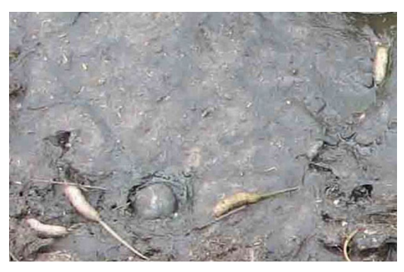
Figure 14. Rat-tailed maggots of the drone fly, Eristalis tenax (Linnaeus), infesting a dairy farm lagoon in upstate New York.

The drone fly is reported to have caused accidental myiasis, which occurs when fly larvae