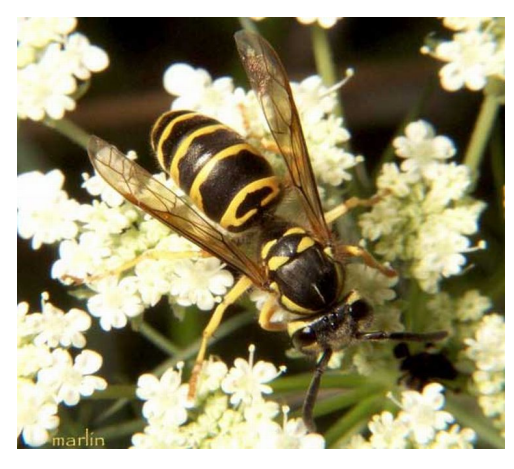
Figure 2. Adult female eastern yellowjacket, Vespula maculifrons (Buysson).

rat-tailed maggot (immature), is a mimic of the European honey bee Apis mellifera Linnaeus (Golding et al. 2001), and was introduced from Europe around 1875 (Gilbert 1986). The rat-tailed maggot is probably the source of Biblical writings that depict honey bees spontaneously developing from dead animals. This is because female drone flies can lay their eggs in carcasses (Osten-Sacken 1893).