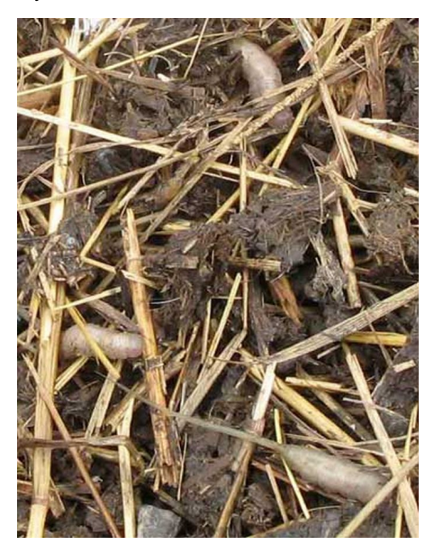
Figure 7. Larvae of the rat-tailed maggot, Eristalis tenax (Linnaeus), in manure.

generally locks in a curved position over the back (Metcalf 1913).