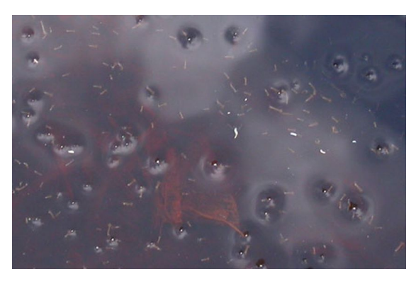
Figure 12. Larvae of the drone fly, Eristalis tenax (Linnaeus), sharing their habitat with mosquito larvae. The drone fly larvae are represented by the dimples where their siphons are attached to the surface of the water.

complete development, which is why they are found in water with high levels of organic matter (Day 2008). The respiratory appendage located posteriorly remains at the surface of the water while the larva moves through the water at various depths, allowing it to search for food without having to return to the surface to breathe (Metcalf 1913). Larvae are reported to reproduce by way of neoteny or paedogenesis, where each larva copies itself, reproducing from seven to 30 daughter larvae (Ibrahim and Gad 1978). However, there was only one observation of this occurrence.