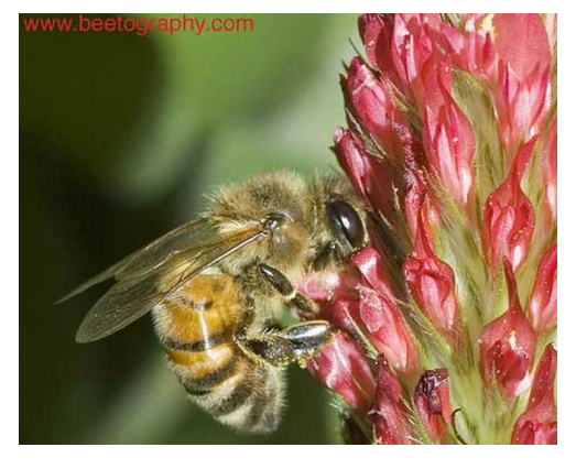
Figure 4. Adult honey bee, Apis mellifera (Linnaeus).

Adult E. tenax are important pollinators of many crops and wildflowers, while their larvae occasionally are pests around livestock (Day 2008) and cause accidental myiasis in humans (Catts and Mullen 2002). Myiasis occurs when fly larvae infest humans and other vertebrate animals and feed on the host's living tissue (Lakshminarayana et al. 1975), and is a common occurrence in certain other Dipteran