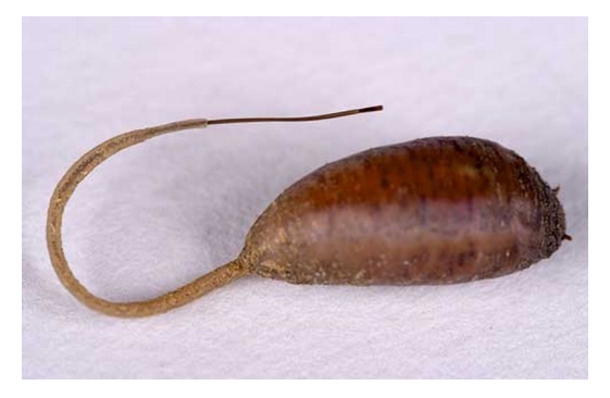
Figure 8. Rat-tailed maggot pupa, Eristalis tenax (Linnaeus).

Adult: The following information is from Milne and Milne (1980). The adult drone fly can be over half an inch in length. They can be easily differentiated from honey bees because they lack a