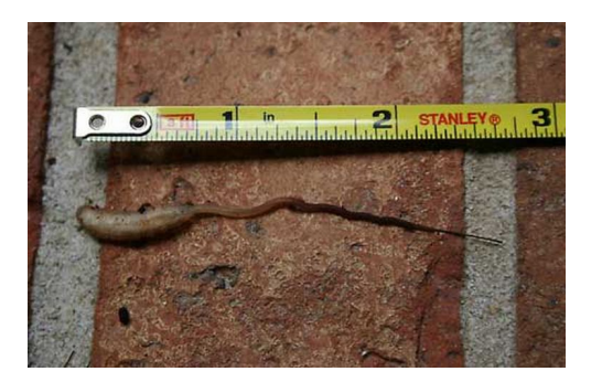
Figure 5. Larva of the rat-tailed maggot, Eristalis tenax (Linnaeus), about two and a half inches in length.