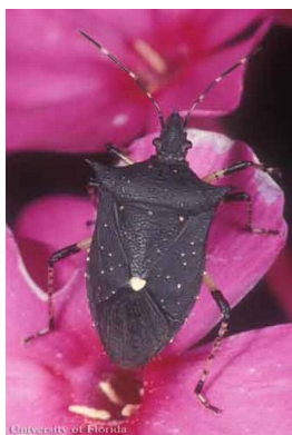
Figure 2. Dorsal view of an adult black stink bug, Proxys punctulatus (Palisot), on phlox.