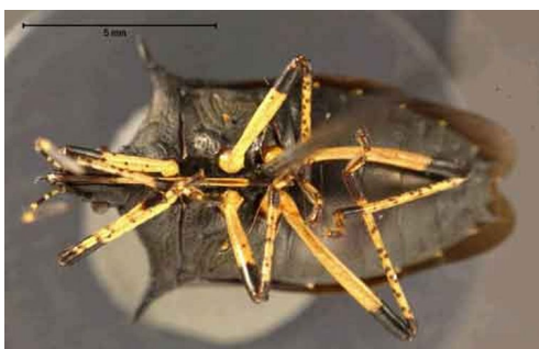
Figure 4. Ventral view of an adult black stink bug, Proxys punctulatus (Palisot).

Eggs: The eggs are usually laid singly and sometimes in pairs, which is a species characteristic. All other North American pentatomids lay their eggs in clusters. The length of the eggs is 1.05mm and their width ~0.96mm. They are white and slightly ovoid.