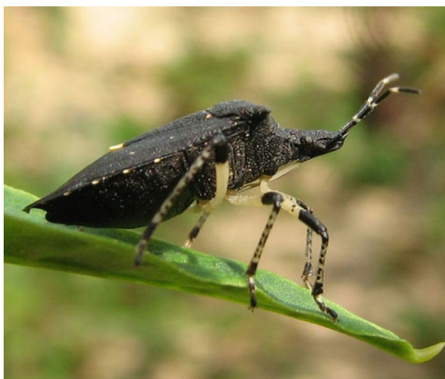
Figure 3. Lateral view of an adult black stink bug, Proxys punctulatus (Palisot).