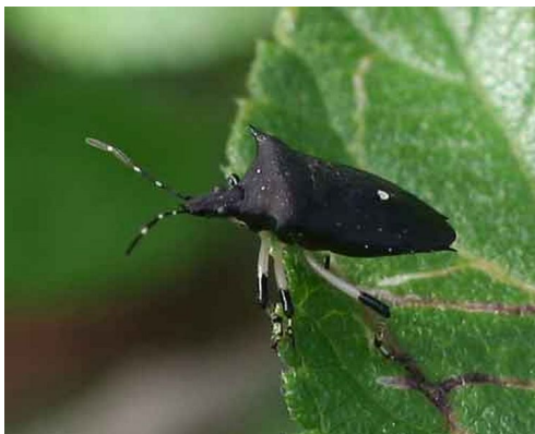
Figure 1. Adult black stink bug, Proxys punctulatus (Palisot), on lantana.

The biology of the black stink bug, Proxys punctulatus (Palisot), is not well known. It has a broad geographical range in the Americas but does not appear to damage agricultural crops as do other more important pentatomids. Black stink bugs appear to be facultative feeders on plants and other insects.