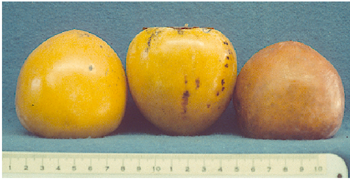
Figure 23. ‘Tanenashi’ cultivar.

‘Tanenashi’ , the most popular astringent cultivar in Florida, matures heavy crops without pollination and will seldom set seed even if pollinated (Figure 23). It is usually desirable to thin the fruit to obtain some vegetative growth during the year. The fruit, often large (3½” across), can weigh over ¾ of a pound. Skin color is deep yellow to orange when mature. The flesh is orange, pasty, comparatively dry, and of acceptable quality. Soluble solids average 16%. Harvest duration may extend from September through November. It is a good tree for homeowners.