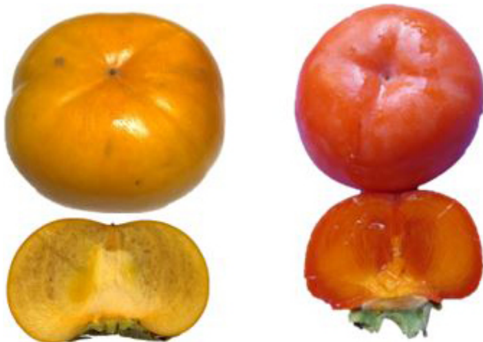
Figure 1. Nonastringent persimmon ‘Fuyu’ (left) and astringent ‘Hiratanenashi’ (right) ready-to-eat cultivars.

The second classification relates to fruit flesh color when seeds are present. In pollination-variant types, the flesh is dark and streaked around the seeds, but clear orange when seedless. Pollination-constant types lack the dark streaking regardless of seed set.