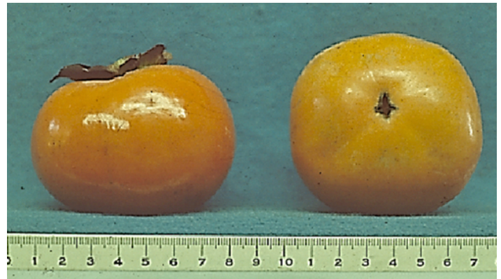
Figure 12. 'Hana Fuyu' cultivar. Credits: UF/IFAS Horticultural Sciences Department

'Hana Fuyu' , also known as 'Yotsundani' or 'Giant Fuyu', regulates crop loads well and is of medium vigor (Figure 12). The fruit are slightly larger than most, are generally free of imperfections, and may be slow to lose astringency. The tree is a good homeowner cultivar.