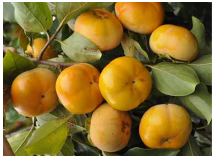
Figure 8. 'Ichikikei Jiro' cultivar.

'Ichikikei Jiro' is a bud sport of Jiro and is low to moderate in vigor (Figure 8). It blooms later than most persimmon cultivars. Fruit size is medium-large with soluble solids of 16% to 19%. Some fruit sustain tip cracking. Fruit are oblate. Harvest season is mid-October to mid-November. 'Ichikikei Jiro' is recommended for north and north central Florida.