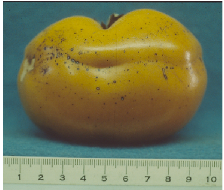
Figure 27. ‘Tamopan’ cultivar.

‘Tamopan’ is a cultivar with large fruit having a circular depression around the top third nearest the stem (Figure 27). The fruit is juicy, watery, and stringy, with a thick peel. More than one cultivar of this tree exists, some of which have better fruit than the one described.