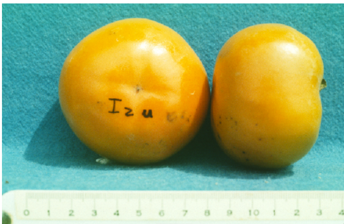
Figure 6. 'Izu' cultivar.

'Izu' has the distinction of being the earliest ripening nonstringent cultivar (Figure 6). Tree vigor is very low, and it is not precocious. Fruit size is medium-large, and soluble solids average 16%. Fruit shape is oblate, and a fair percentage of fruit show imperfections. Harvest season is late September through mid-November. 'Izu' is sometimes recommended due to early ripening.