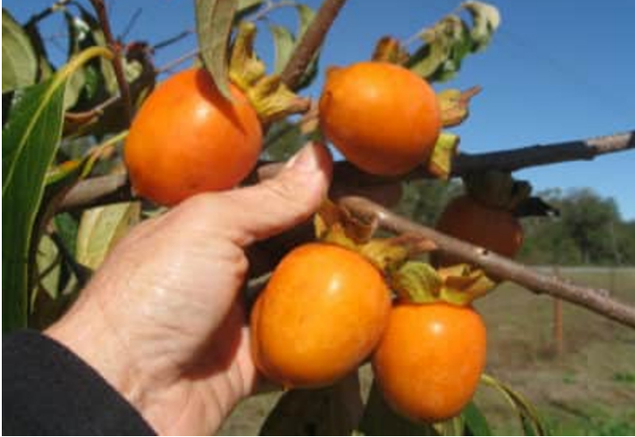
Figure 28. 'Ormond' cultivar.

'Ormond' is sometimes called the Christmas persimmon. Fruit are long, conic, and often harvested in January (Figure 28). The tree begins growing early in the spring, which increases chances for freeze injury. The fruit is juicy, with large seeds.