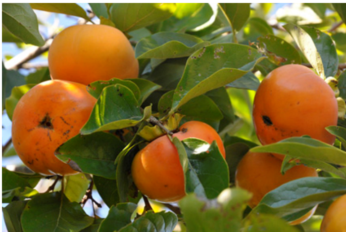
Figure 10. 'Maekawa Jiro' cultivar.

'Maekawa Jiro' , a bud sport of Jiro, is low to moderate in vigor (Figure 10). Fruit size is large, and fruit shape is oblate. There is some tendency for fruit to incur tip cracking. Harvest season is mid-October to mid-November. 'Maekawa Jiro' is not recommended for north and north central Florida.