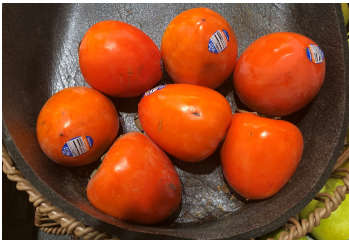
Figure 24. ‘Hachiya’ cultivar.

‘Hachiya’ is a commercial cultivar in California (Figure 24). Ability to set and hold fruit is sometimes a problem if this cultivar is propagated onto Diospyros virginiana rootstock. The fruit are high quality and jelly-fleshed, with an attractive red skin coloration. Fruit will often have concentric ring cracking at the apical end and will ripen unevenly starting from these points. In Japan, ‘Hachiya’ is mostly used for drying. It remains astringent until fully ripened and soft.