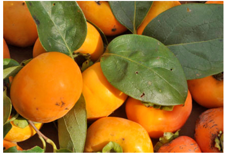
Figure 7. 'Matsumoto Wase Fuyu' cultivar.

'Matsumoto Wase Fuyu' is an earlier-ripening bud sport of 'Fuyu' (Figure 7). The tree sets many flowers and produces heavy, clustered crops. The clusters should be thinned to prevent bent limbs with excessive fruit loads. Larger fruit are sometimes prone to calyx separation. The tree is moderately vigorous and of medium size. Soluble solids range from 16% to 19%, which is generally true for most mid-season types. Fruit is medium in size and oblate in shape. There is little or no tendency for fruit to incur tip cracking.