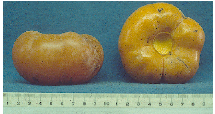
Figure 21. 'Sheng' cultivar.

' Sheng ' is a well-spreading tree with large fruit having lobed sections looking somewhat like a 4- or 6-leaf clover from the top (Figure 21). Fruit have a high jelly content, are bright orange, and when pollinated will set many seed.