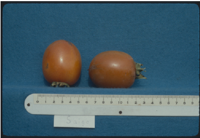
Figure 18. 'Saijo' cultivar.

' Giombo ' is similar to 'Saijo' in fruit quality, although the fruit are much larger and begin ripening 2 weeks later (Figure 19). Fruit are light translucent orange and thin-peeled with a sweet, juicy, jelly-type flesh. 'Giombo' fruit are a connoisseur's choice. The tree is early to start growth in the spring and is sometimes injured by freezing temperatures.