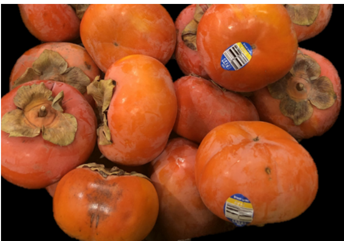
Figure 15. 'Fuyu' cultivar.

'Fuyu', also known as 'Fuyugaki', is the most popular nonastringent tree in Florida and is the most widely grown persimmon cultivar in the world. It is weakly 4-sided and firm when ripe, with very few seeds (Figure 15). Fruit thinning is usually necessary to ensure large fruit, prevent clustering, and regulate crop loads. Incidence of fruit imperfections is low, yields are good, and the tree is generally well adapted, with a soluble solids average of 18%. Many different cultivars with the name 'Fuyu' or 'Fuyugaki' exist. Fruit shape is oblate and few fruit show imperfections. Harvest season is mid-November through early December. 'Fuyu' is highly recommended for north and north central Florida.