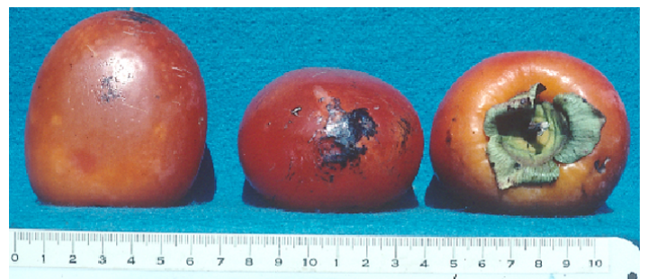
Figure 22. 'Yomato Hyakume' cultivar.

' Yomato Hyakume ' is a pollination-variant type, but it does not have a great deal of dark flesh around the seeds. The fruit are large, with a deep orange-red color (Figure 22). Concentric ring cracking often occurs. This cultivar is a heavy annual cropper with good fall leaf retention. It is excellent for dried fruit and is one of the best astringent types.