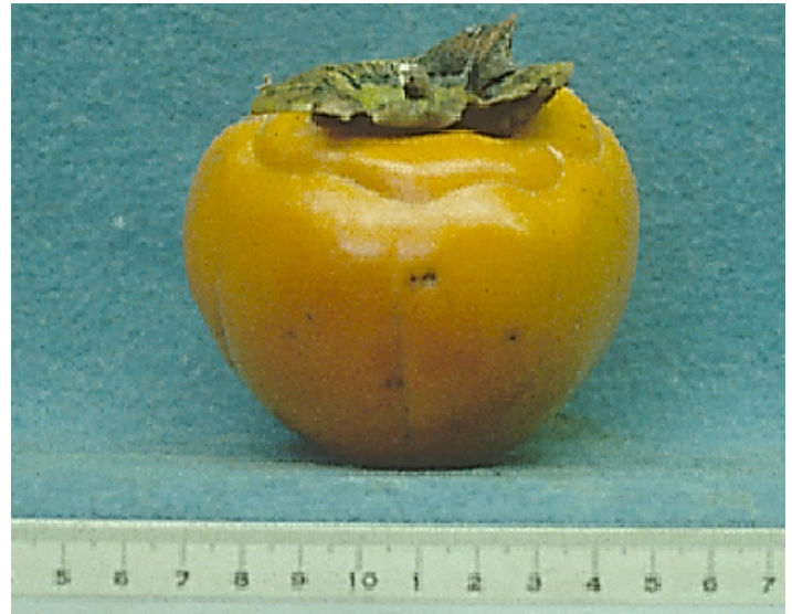
Figure 11. 'Midia' cultivar.

'Midia' trees are moderate in vigor but are more susceptible to tree decline than most other Japanese persimmons (Figure 11). Fruit set and fruit retention until harvest are not consistently high. 'Midia' produces the largest fruit of any cultivar of nonastringent persimmon. Fruit shape is round with an indented ring around the top of the fruit. Harvest season is late October to mid-November. 'Midia' is not recommended for north and north central Florida.