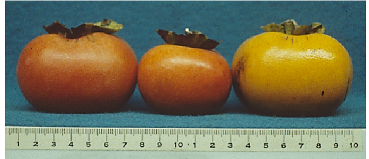
Figure 25. ‘Hiratanenashi’ cultivar

always seedless. The astringency is sometimes difficult to remove after the fruit have been harvested unless they are artificially treated.