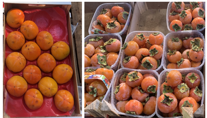
Figure 4. Fruit size among persimmon cultivars can be varied from 3.5 oz (100 g) to 14 oz (400 g).

Fruit size is affected by crop loads. The lighter the crop set, the larger the fruit. Small fruit generally weigh 3.5 oz (100 g) to 4.5 oz (130 g), medium fruit range from 5.5 oz (150 g) to 7.0 oz (200 g), and large fruit range from 8 oz (230 g) to 14 oz (400 g) (Figure 4).