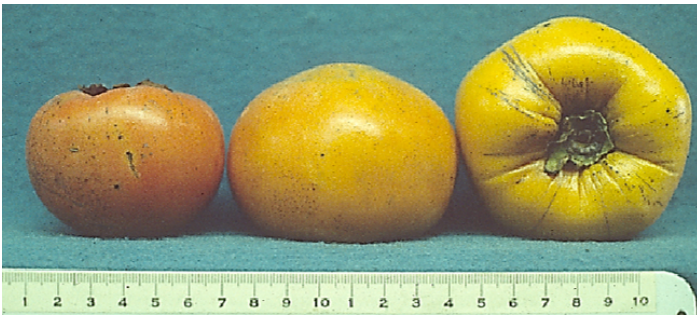
Figure 13. 'Hanagosho' cultivar.