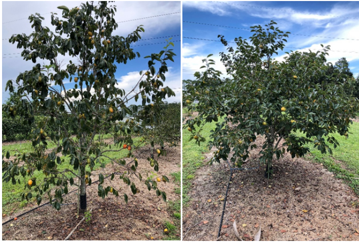
Figure 5. Tree size and shape can be varied among cultivars 'Saijo' (left) and 'Fuyu' (right).

trees fall into this category. Trees in the tall class are upright and often have small fruit. Generally, tree size is reduced south of Gainesville to south Florida. It has been observed that trees grown in Florida are often smaller than would be expected in their native land; common cultivars barely reached 10 ft in height after 10 years in trials during the 1960s.