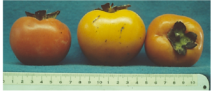
Figure 20. 'Eureka' cultivar.

' Eureka ' has been widely propagated by southern nurseries and is a common cultivar in Texas (Figure 20). It has a large, round, flat-shaped, pollination-variant fruit with a medium amount of dark flesh around the seed.