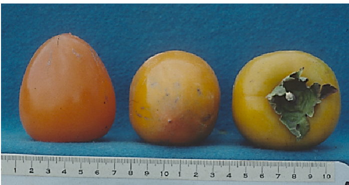
Figure 19. 'Giombo' cultivar.

' Giombo ' is similar to 'Saijo' in fruit quality, although the fruit are much larger and begin ripening 2 weeks later (Figure 19). Fruit are light translucent orange and thin-peeled with a sweet, juicy, jelly-type flesh. 'Giombo' fruit are a connoisseur's choice. The tree is early to start growth in the spring and is sometimes injured by freezing temperatures.