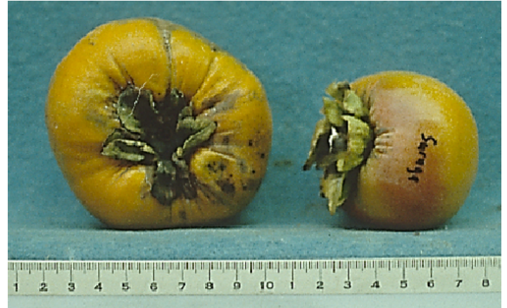
Figure 16. 'Suruga' cultivar.

'Suruga' trees are moderate in vigor (Figure 16). They produce late-ripening fruit that are exceptionally sweet (soluble solids = 18%–21%). Their fruit shape is classified as oblate conic, and fruit imperfections are fairly common. Fruit size is medium large. Harvest season is late November to early December. It appears to be susceptible to premature defoliation. 'Suruga' is not recommended for commercial cultivation.