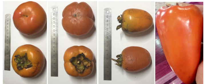
Figure 3. Different fruit shapes among persimmon cultivars.

The three general fruit shapes are conic (cone-shaped), roundish (round and sometimes pointed at the apex like an acorn), and oblate (flattened like a large standard tomato) (Figure 3). Some cultivars have other noticeable characteristics, such as an indented ring around the fruit of ‘Midia’ and ‘Tamopan’. Four sides will sometimes be apparent on fruit of ‘Great Wall’ or ‘Saijo’. Distinctly lobed sections are present on ‘Sheng’ and ‘Peiping’. Some cultivars are tucked or folded in at the calyx, like ‘Suruga’.