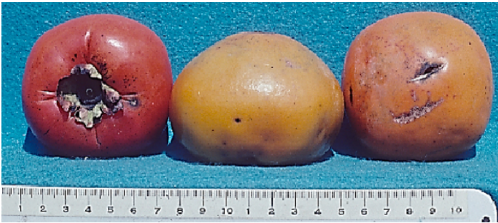
Figure 14. 'Shogatsu' cultivar.