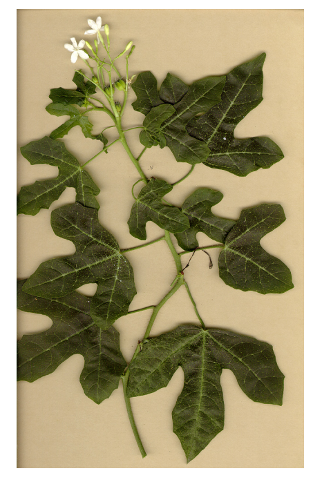
Figure 6. Whole flowering plant of Cnidoscolus stimulosus (bull-nettle).

The habit of U. chamaedryoides varies according to the environmental conditions: plants in shady areas tend to have longer, weaker stems with larger, more coarsely toothed leaves and looser flower clusters (Fig. 1), while plants in more exposed areas are much smaller with more compact flower clusters (Fig. 5).