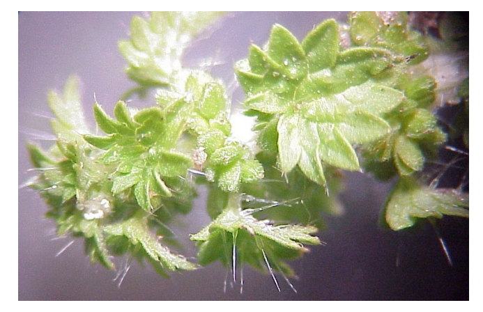
Figure 4. Stinging hairs of Urtica chamaedryoides .