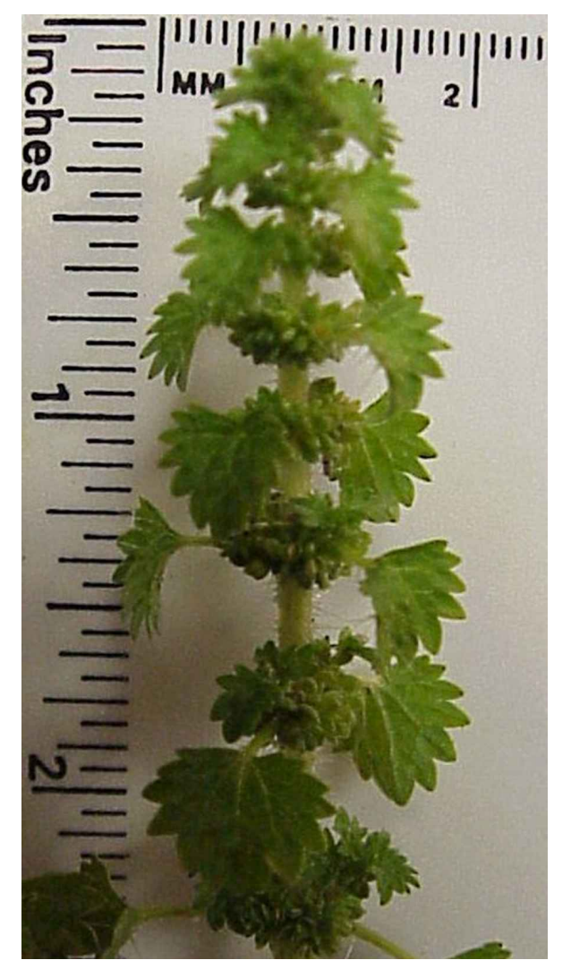
Figure 2. Flowering top of Urtica chamaedryoides .

Irritant compounds (histamines and acetocholines) that cause reddening and intense itching fill the stiff, hypodermic-needle-like stinging hairs on the stem and leaves (Fig. 4). When the tip of the brittle, tubular hair is broken, pressure on the bulbous hair base injects the irritants into the skin. The usual reaction, reddening and intense itching, is usually of short duration, although sensitive individuals may experience some swelling and burning. Washing the affected area or immediate application of baking soda paste soothes the stinging sensation for most people.