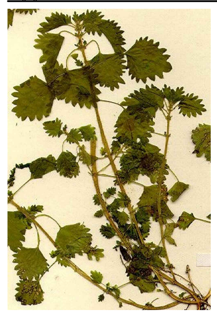
Figure 1. Shade form of Urtica chamaedryoides . Credits: Photo by Kent D. Perkins of UF Herbarium sheet.

nettle, dwarf nettle, Fig. 3: right; flowers in elongate clusters; native to Europe; reported from St. Johns, Lake, Orange, and Leon counties).