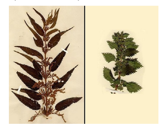
Figure 3. Left: Urtica dioica ; Right: Urtica urens . Credits: Photo by Kent D. Perkins, Left: UF Herbarium sheet #55306; Right: UF Herbarium sheet #154187.