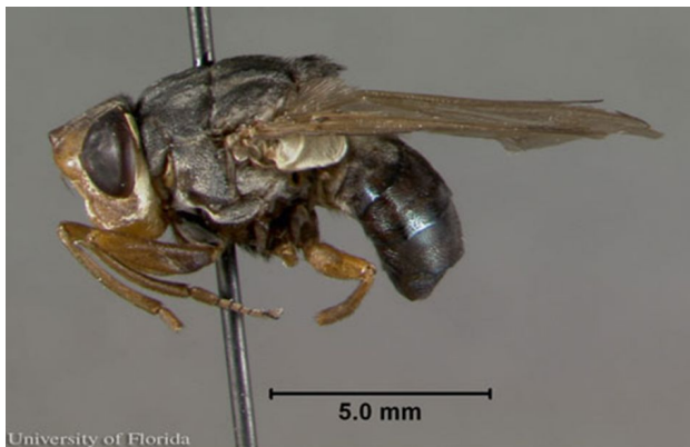
Figure 2. Lateral view of an adult human bot fly, Dermatotbia hominis (Linnaeus Jr.).

covered with hairs which give the fly a bumblebee appearance (Khan 1999).