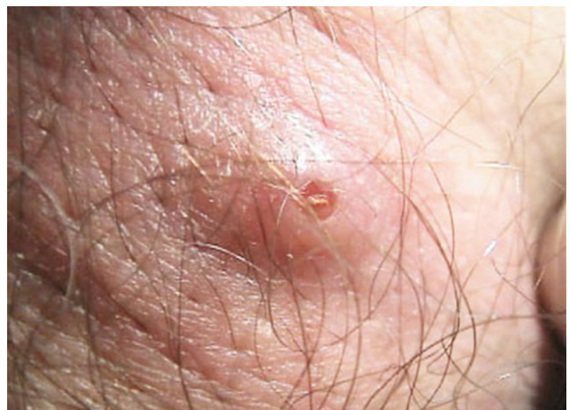
Figure 13. Raised lesion on the skin caused by the presence of a larva of the human bot fly, Dermatobia hominis (Linnaeus Jr.).