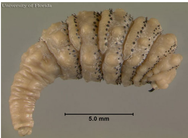
Figure 6. Third instar larva of the human bot fly, Dermatobia hominis (Linnaeus Jr.), lateral view.