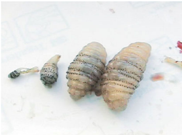
Figure 5. Left to right – 1st, 2nd, early 3rd, and late 3rd instar larva of the human bot fly, Dermatobia hominis (Linnaeus Jr.).