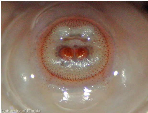
Figure 10. Posterior spiracles of the larva of the human bot fly, Dermatobia hominis (Linnaeus Jr.).