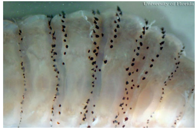
Figure 8. Backward projecting spines on larva of the human bot fly, Dermatobia hominis (Linnaeus Jr.).