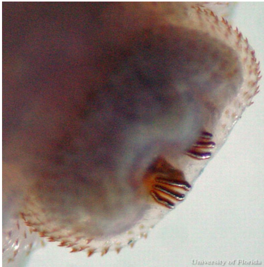
Figure 11. Side view of posterior spiracles of the larva of the human bot fly, Dermatobia hominis (Linnaeus Jr.).

Pupae: Pupation takes place in the ground and the pupae do not feed. Adults will emerge after two to three weeks.