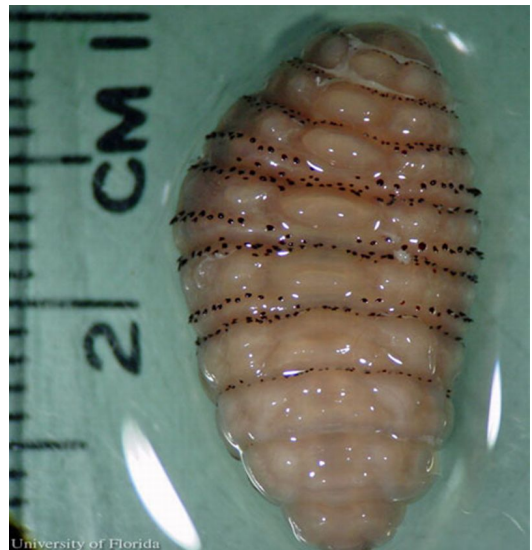
Figure 12. Third instar larva of the human bot fly, Dermatobia hominis (Linnaeus Jr.).

The most common hosts for the human bot fly are cattle and dogs. However, they are found in many warm-blooded animals including buffalo, cattle, cats, dogs, humans, monkeys, pigs, rabbits, and sheep.