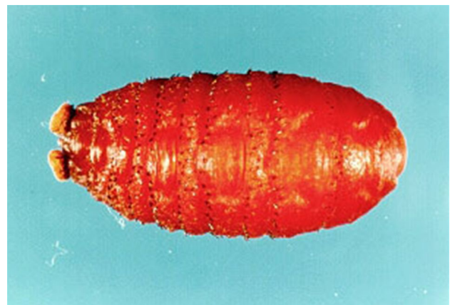
Figure 9. Pupa of the human bot fly, Dermatobia hominis (Linnaeus Jr.).