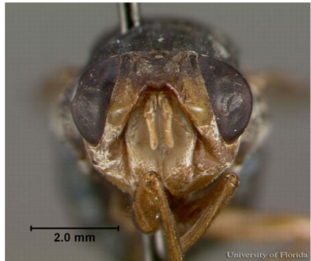
Figure 3. Frontal view of an adult human bot fly, Dermatotbia hominis (Linnaeus Jr.).

Egg: The egg of the bot fly is creamy colored and oval in shape, and is attached to different species of blood-feeding insects captured by the female bot fly. The eggs, usually attached to the ventral side of the body, hatch when the insect carrying the eggs begins to blood feed on a warm-blooded host.