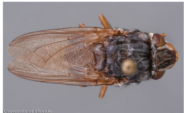
Figure 4. Dorsal view of an adult human bot fly, Dermatotbia hominis (Linnaeus Jr.).

Larva: The larva, or white maggot, goes through three instars once in the mammalian host. Each instar develops a distinctive shape. The first instar is worm-like with a bulbous end. The second instar larva has a bottle-neck shape. The third instar is cylinder shaped. Each instar possesses backward projecting spines that encircle the thorax.