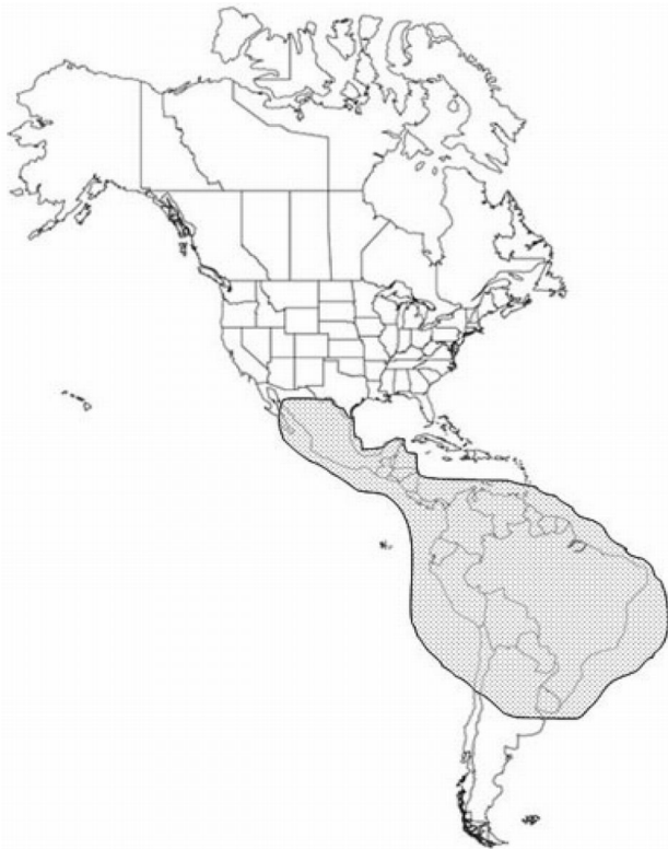
Figure 1. The geographical distribution of the human bot fly, Dermatotbia hominis (Linnaeus f.).

covered with hairs which give the fly a bumblebee appearance (Khan 1999).