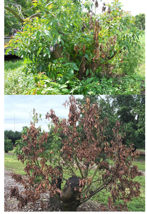
Figure 4. (A) Regrowth and some branch dieback of tree cut to a stump (~1.2 m height), and (B) tree regrowth dies back repeatedly until the tree is dead. Credits: J. H. Crane, UF/IFAS

Figure 2. The visible external symptoms of laurel wilt disease begin as green-leaf wilting (A), typically in one section of the tree (B). Frass straws from AB boring may be evident (C), and the sapwood has blackish-brown-blue streaks (D). Credits: J. H. Crane, UF/IFAS