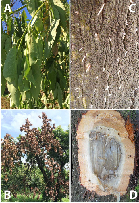
Figure 2. The visible external symptoms of laurel wilt disease begin as green-leaf wilting (A), typically in one section of the tree (B). Frass straws from AB boring may be evident (C), and the sapwood has blackish-brown-blue streaks (D).