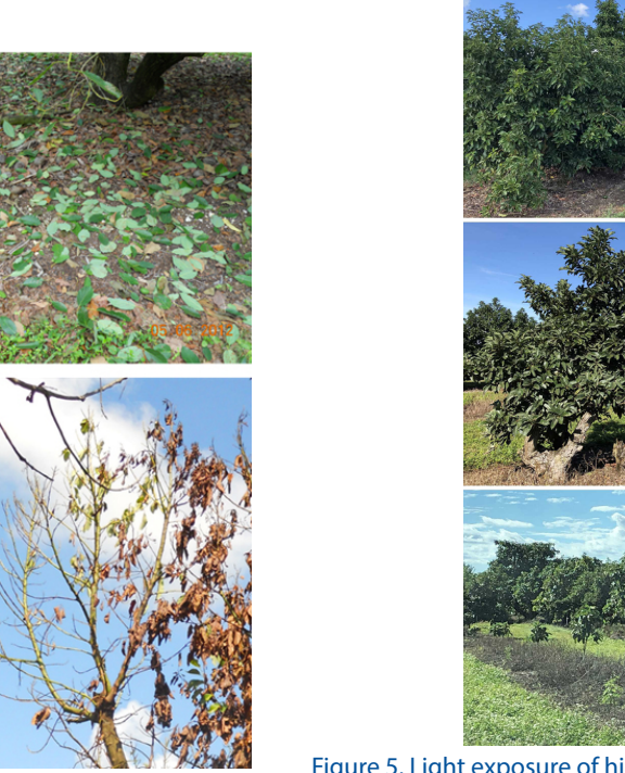
Figure 3. Mature LW-affected avocado trees with sections of the tree with copious leaf drop and other sections with leaves remaining on the stems prior to dieback and death.